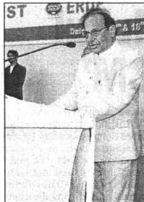
Assam governor Jagdish Mukhi speaks at the inauguration of the North East Graduate Congress on Saturday.

Various competitions, including science model contest, debate on GST is the Instrument of Economic Growth,