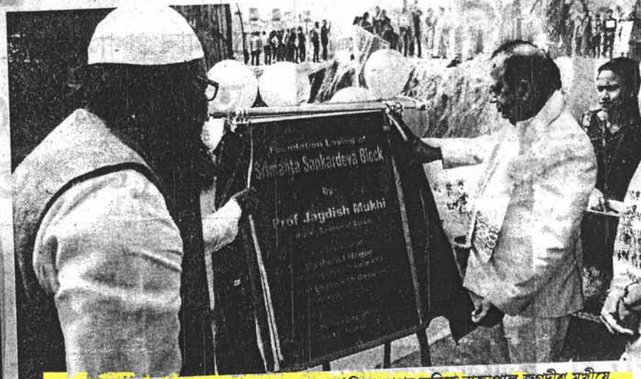
ইউ এ টি এমত শ্ৰীমন্ত শংকৰদেৱ ভৱনৰ আধাৰশিলা স্থাপন কৰিছে ৰাজ্যপাল জগদীশ মুখীয়ে

প্ৰেৰণ কৰা হৈছে। উলুপুৰ পঞ্চায়ততো এটা পথৰ কাম সম্পূৰ্ণ হৈছে। বালিপুখুৰী পঞ্চায়তৰ তিনিটা পথৰ পুনৰ নিৰ্মাণ সম্পূৰ্ণ হৈছে আৰু