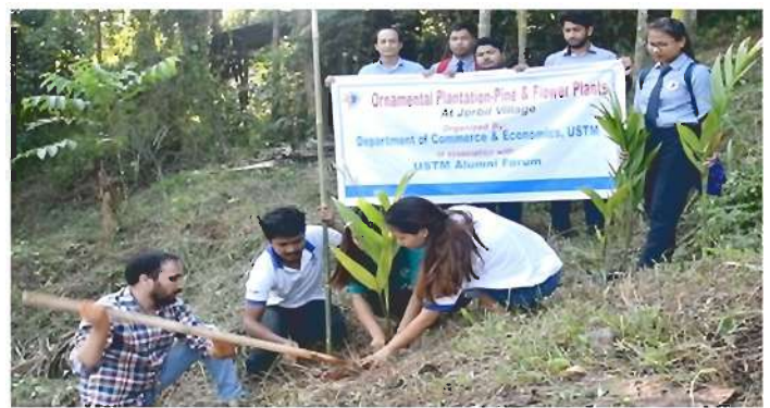
The students are seen planting the Pine and Flower Plants.