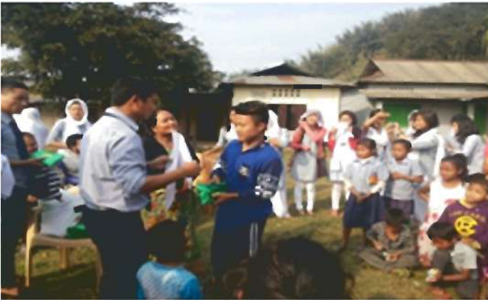
Awareness on sustainable development and Education-13-02-2016