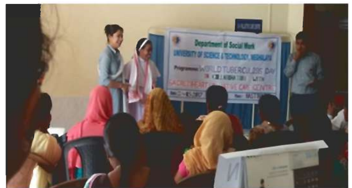
Glimpses of the activities of the Awareness Programme on World Tuberculosis Day-24-03-2017