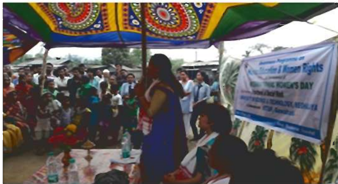
The resource person speaking on the womens rights of education