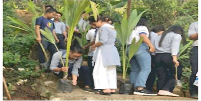
Glimpse of Coconut Plantation Drive at Jorbill Village-02-02-2018