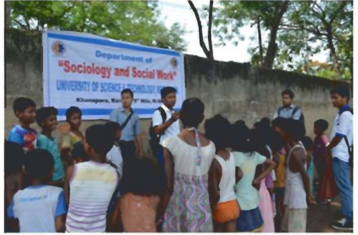
Students are seen interacting with the Children during the Awareness Programme-18-05-2014