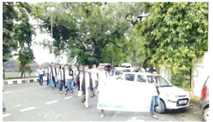
Glimpses of the rally on the occasion of World No Tobacco Day-31-05-2016