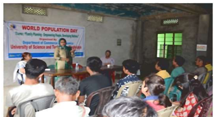
Awareness Program on World Population Day at Jorbil village, Ri-Bhoi district, Meghalaya with the theme 'Family Planning: Empowering People, Developing Nations' -11-07-2017