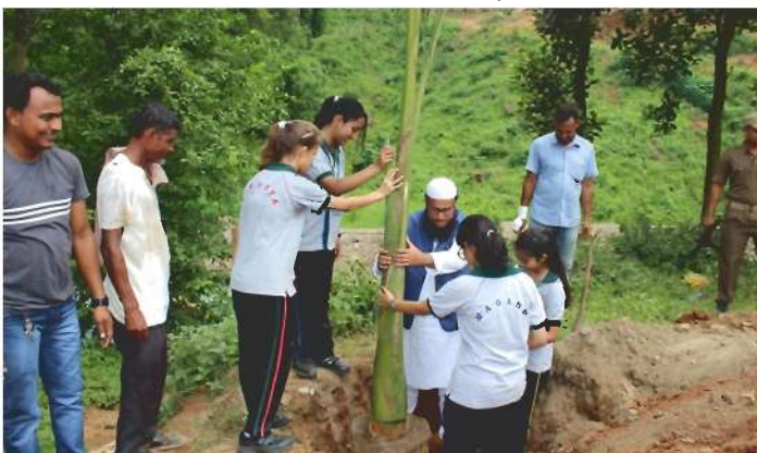
Plantation Drive at Kling Road in association with DPS, Khanapara-21-06-19