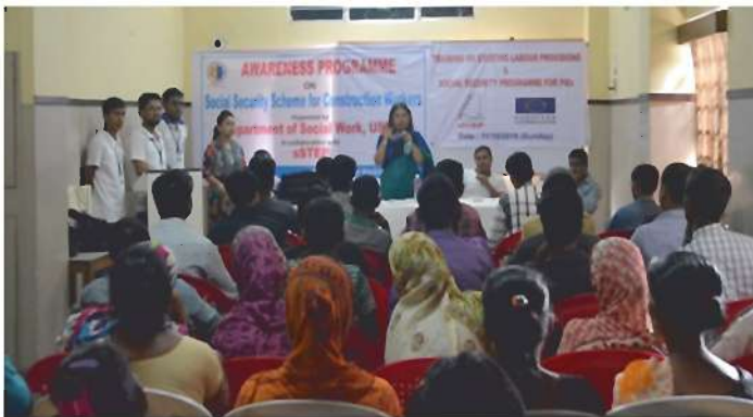
Awareness Program on "Construction Labour Social Security Scheme"-11-10-2015