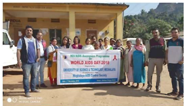
Awareness Program on HIV/AIDS on World Aids Day in association with Meghalaya AIDS Control Organisation at Baridua Village-01-12-2018