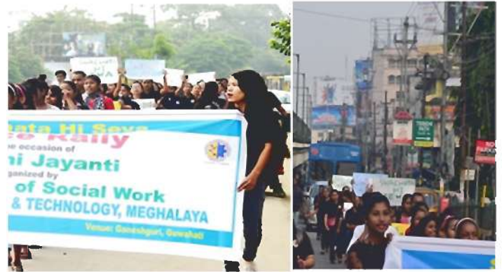
Students participating in the Awareness Rally on Peace on the occasion of Gandhi Jayanti-02-10-2018