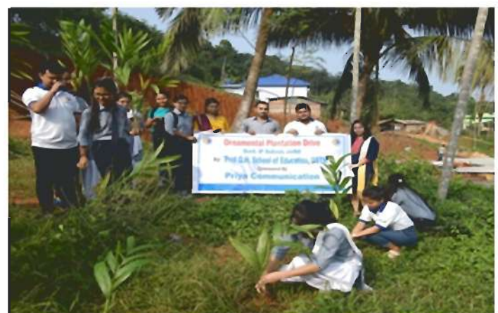
Glimpses of the plantation drive at Jorbill Village the department of B.Ed.