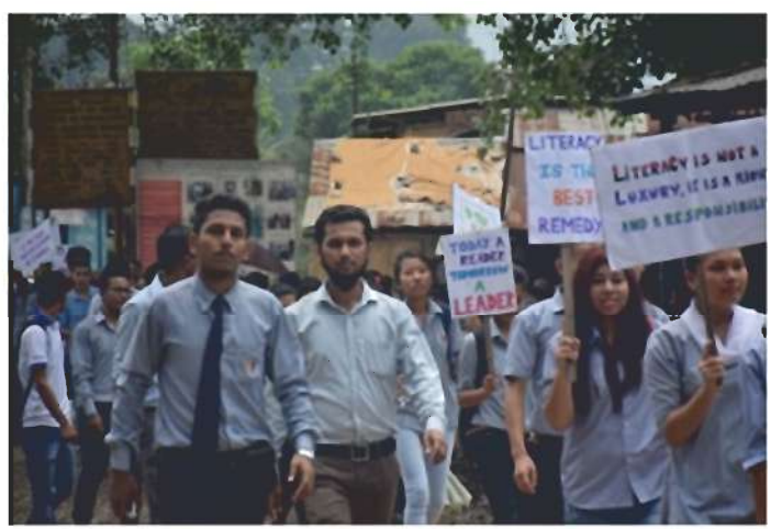
Students participating in Walk for Literacy Rally on the occasion of International Literacy Day-08-09-2018