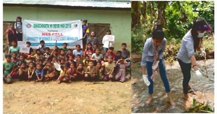
"SWACHHATA HI SEVA HAI" initiative in Timbokgre village in association with NCPE school, Meghalaya - 28-09-2018