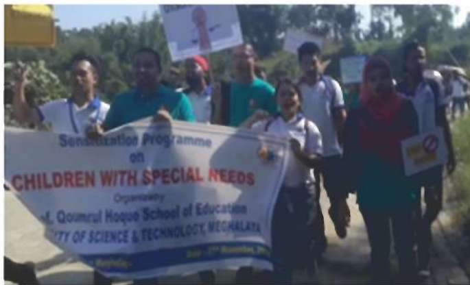
Awareness Rally on Children with Special Needs-27-11-2018