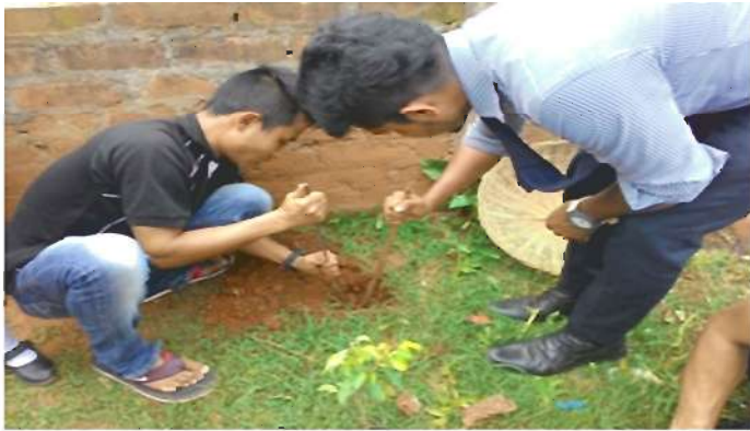
Plantation Drive at 11th Mile Madhab Nagar in participation with the village children-06-05-2015