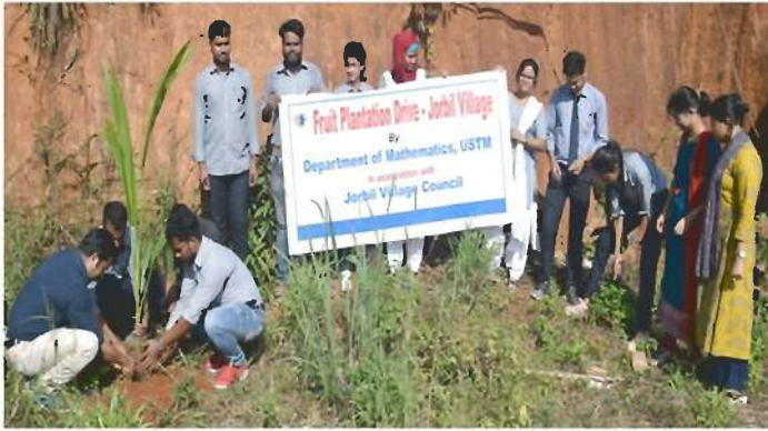
Glimpse of student sapling plantation drive at Jorbill Village by the department of Mathematics