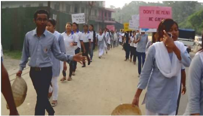
Rally on "Swachha Bharat" on the occasion of Gandhi Jayanti - 02-04-2016