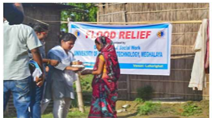
A Flood Relief Camp was organized by the department of Social Work- 05-08-2017