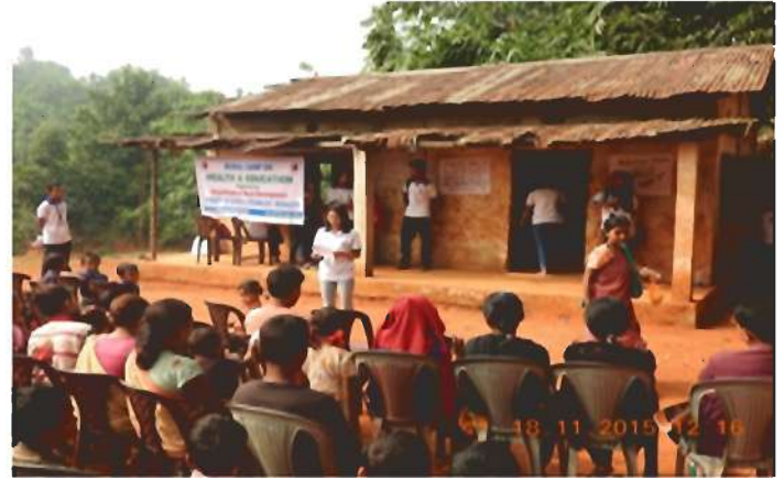
Glimpses of the activities while students are enlightening the villagers about the importance of education and health - 18-11-2015