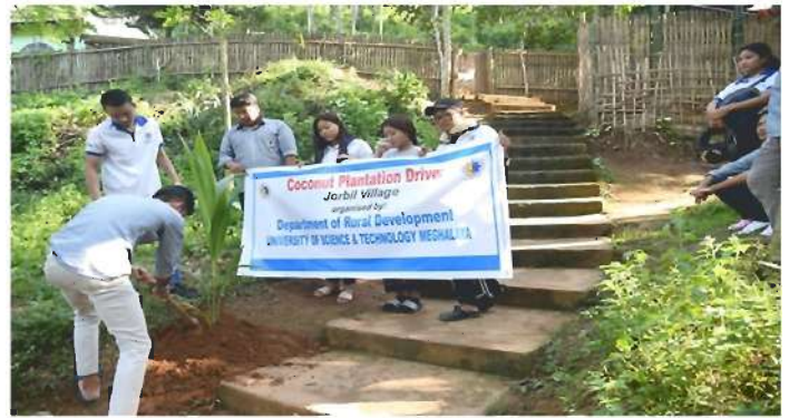
Glimpses of student planting coconut plant at Jorbill Village by the department of Rural Development