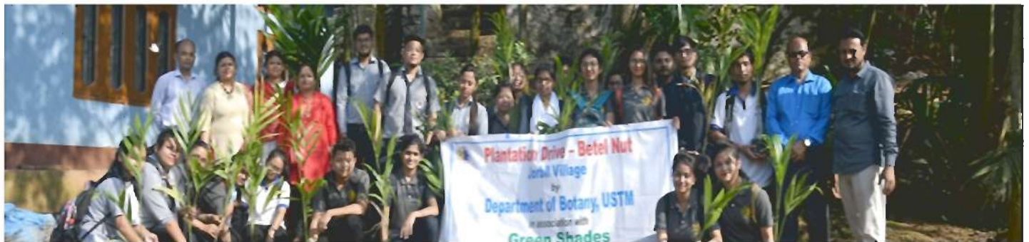
Glimpse of plantation drive by Department of Botany