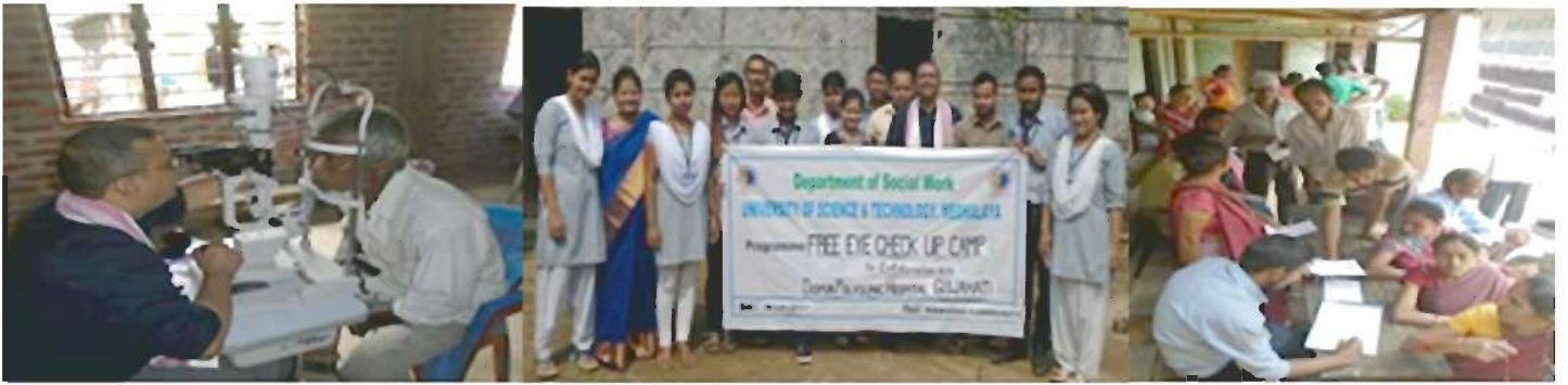
Free eye check up camp in Mawsami Village, Meghalaya-07-05-2017