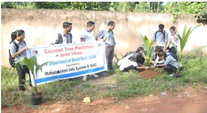
Glimpse of plantation drive by Department of Social Work