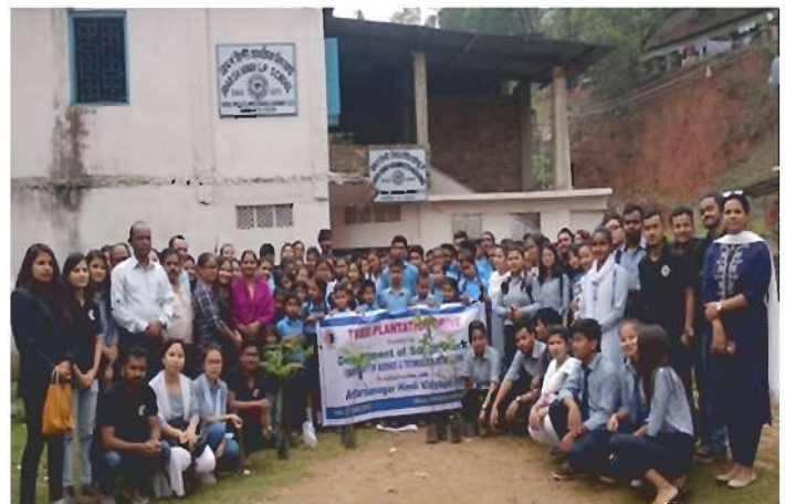
Plantation Drive at Adarsh Nagar Vidyapeeth School 10th Mile, Ri Bhoi Meghalaya-05-04-2019