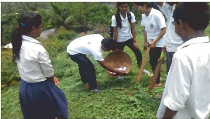
Students are participating in Swachha Bharat Abhiyan in association with Jorbil Upper Primari School, Ri-Bhoi, Meghalaya