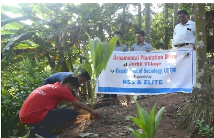
Glimpse of student sapling coconut trees at Jorbill Village by the department of Sociology