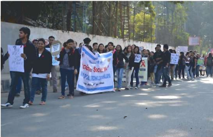
Awareness Programme on HIV/AIDS- 01-12-2014