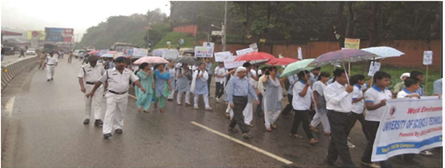
The students are seen holding the placards during the rally-05-06-2014