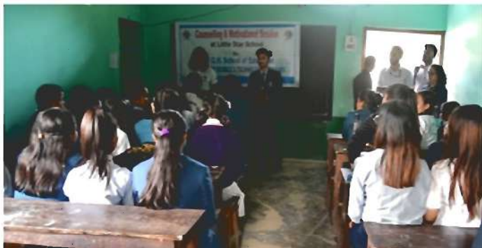
Career Counselling Program for the Rural School Children of Class X Career at Little Star School, 9th Mile Ri Bhoi, Meghalaya organised by the Department of B.Ed