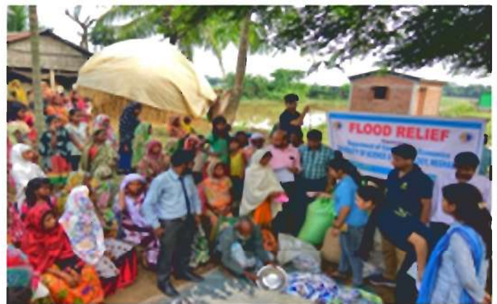
Flood Relief Distribution at Hatisola village by the students of Department of Commerce & Economics- 29-06-2019