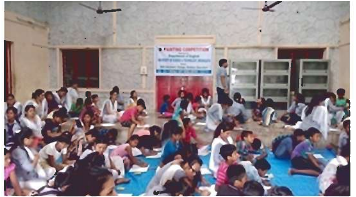
Drawing Competition is organised on Childrens day at SOS Village