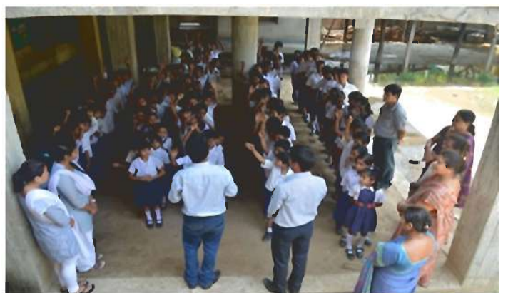
Glimpses of Awareness Programmes on Importance of Child Education