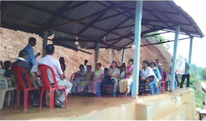
Awareness Programme on Importance of Banking at Garo Basti, 9th Mile Ri Bhoi, Meghalaya-17-05-2015