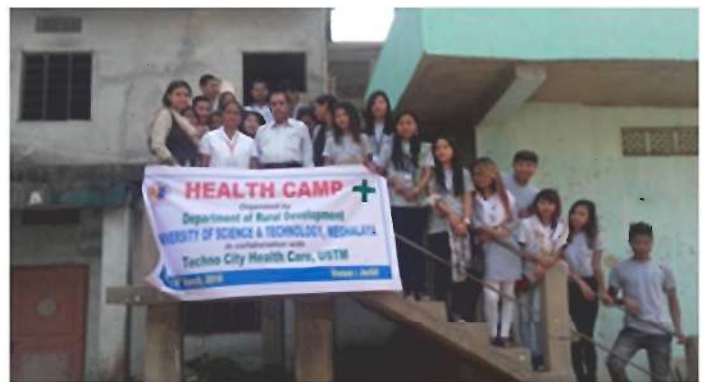
Free Health Check Up camp at the adopted village Jorbill with an aim to create awareness among the people of the village organized by the Department of Rural Development-20-11-15.