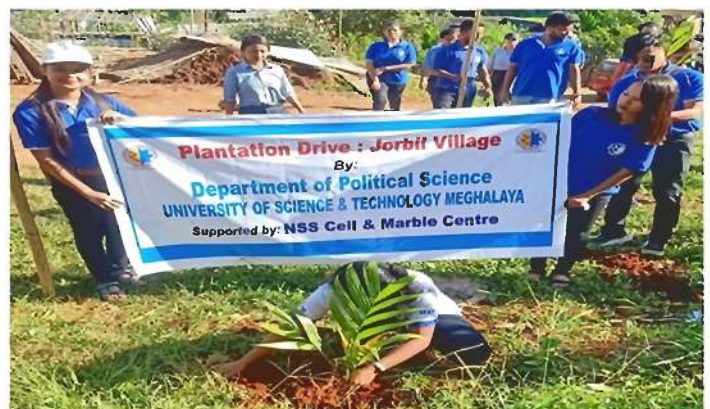
Glimpse of student sapling coconut trees at Jorbill Village-27-06-2018