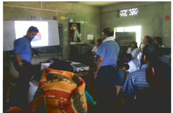
Cancer Awareness Program at Mawsmai Village-13-05-2015