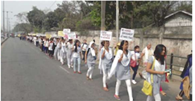
Glimpses of the flag off and the students participating in the rally on the occasion of International Womens Day- 08-03-2016