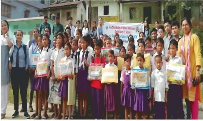
Glimpse of student distributed free school stationery at Govt. LP School, Jorbill Village