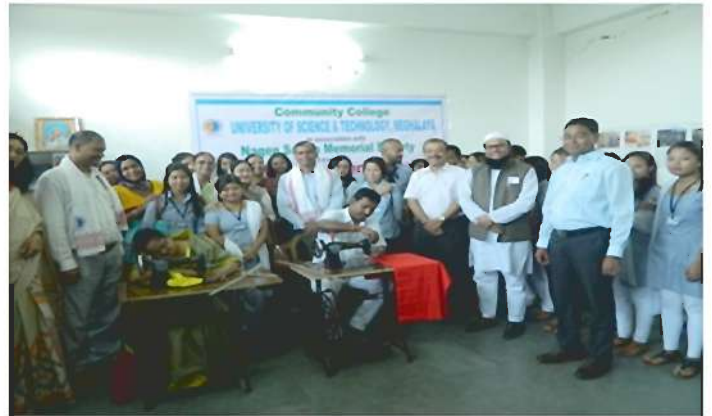
Launching of the Skill Development Centre for Jail inmates at the Central Jail- 22-10-2016