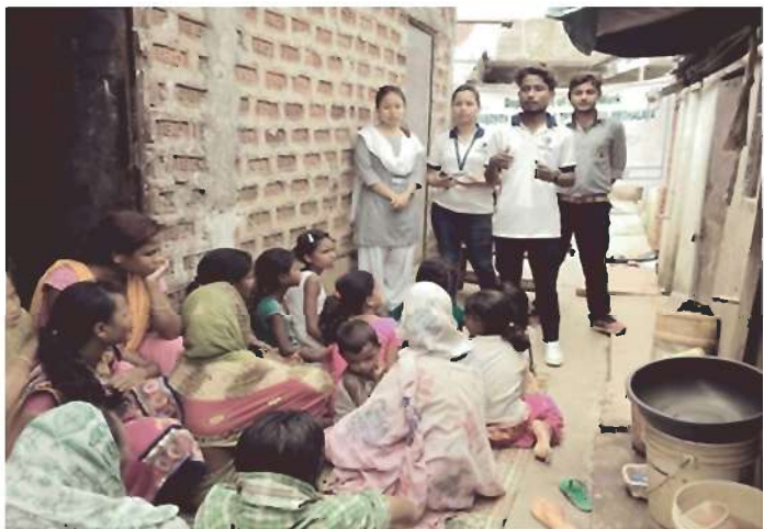
Students are enlightening the people about the importance of safe drinking water-17-07-2014