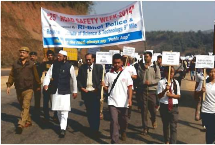
The view of the Road Safety awareness Rally-02-06-2014