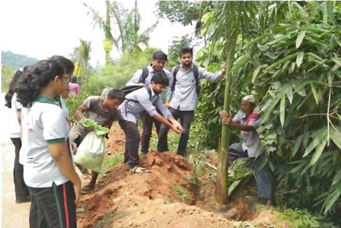
Plantation Drive at Kling Road in association with DPS, Khanapara -21-06-19