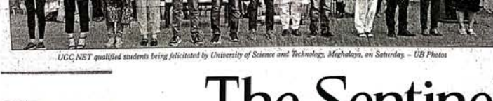
UGC, NET qualified students being felicitated by University of Science and Technology, Meghalaya, on Saturday.