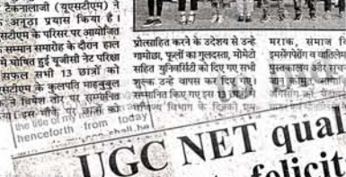
NET qualified students of University of Science and Technology Meghalaya during a felicitation on Saturday.