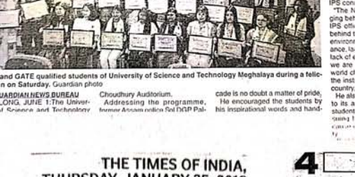
NET qualified students of University of Science and Technology Meghalaya during a felicitation on Saturday.