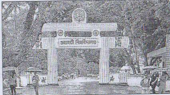
Gauhati University vice-chancellor was one of those present at the meet

All those present in the meet unanimously agreed that the