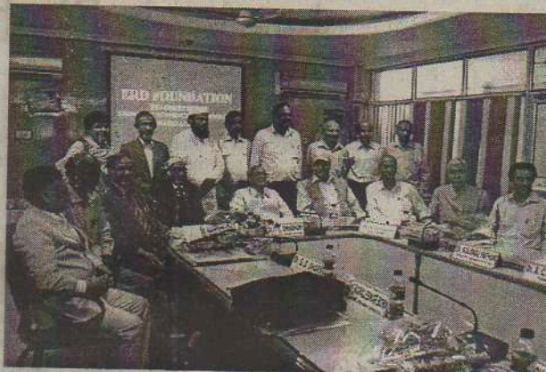
Academicians, scholars and scientists who participated in the academic meet at USTM in Baridua on the outskirts of Guwahati on Saturday.