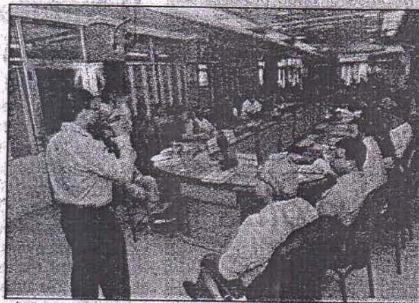
A view of the PhD orientation programme at USTM on Saturday.