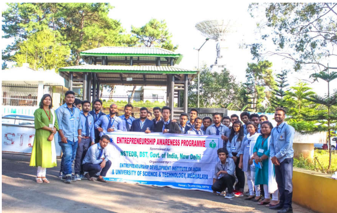
Entrepreneurship Awareness Programme (North Eastern Space Applications Centre, Umiam Meghalaya)