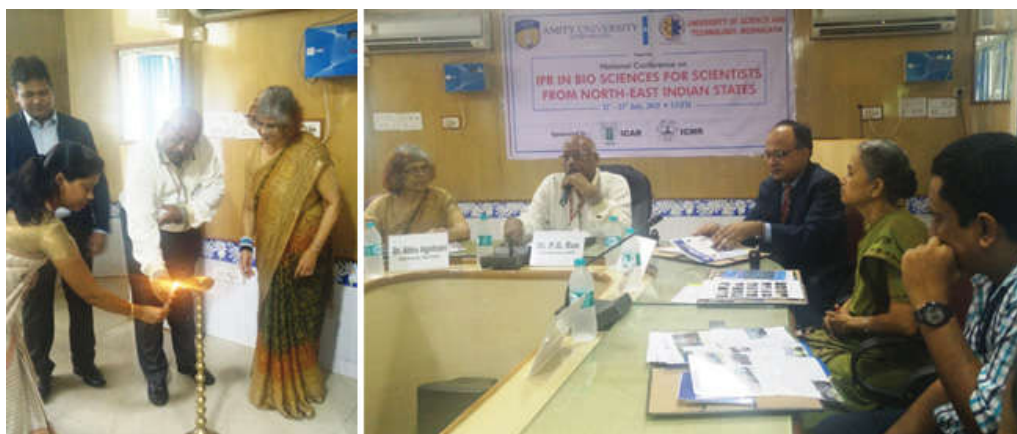
Bio-Science experts moot special IPR core group for North East