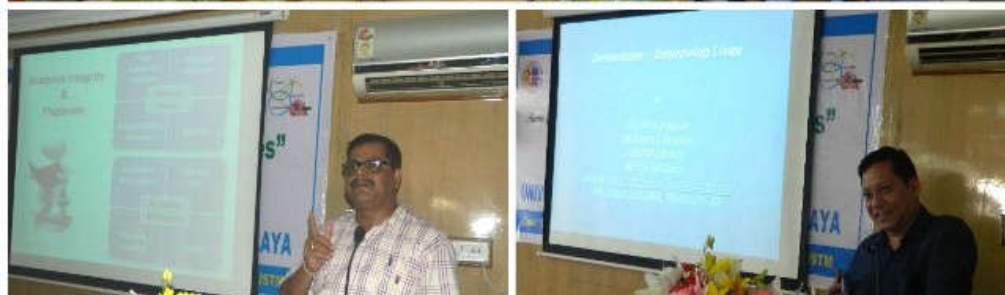
World Intellectual Property Day Celebrated at USTM