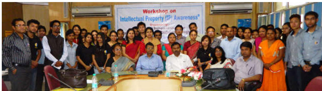
Workshop on IPR conducted by SBUS in association with Tezpur University