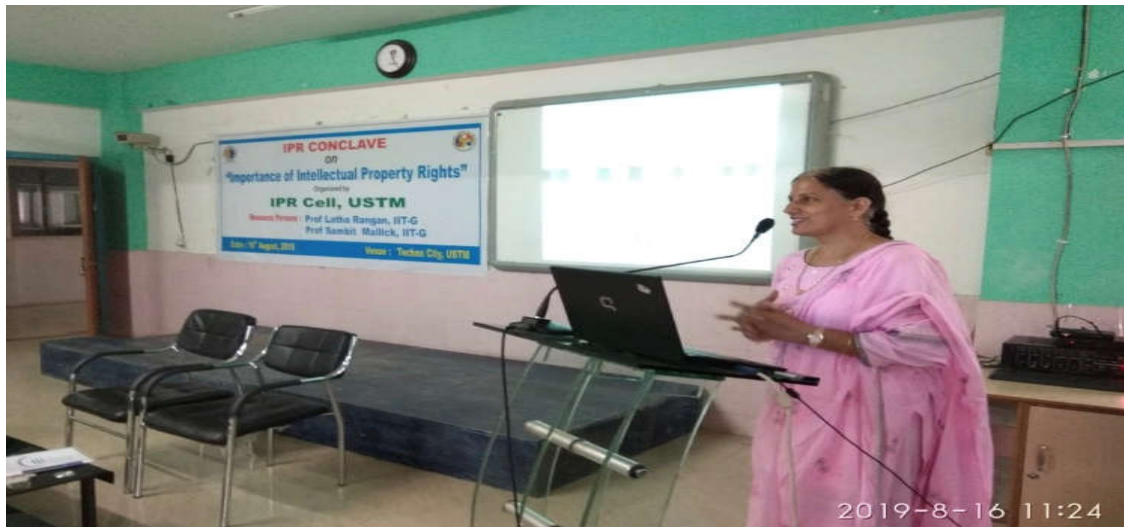
IPR Conclave on “Importance of Intellectual Property Rights”