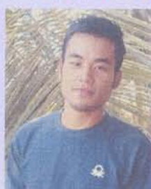
Imsemperong Sociology, UGC-NET