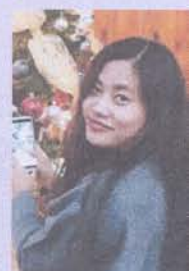
Dzuzehonu Kulnu Geography, UGC-NET