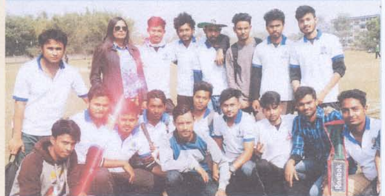
USTM cricket team after winning a match in NGPL Inter Institutions Cricket League in Mirza