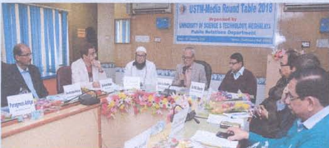
Participants discussing in the Round Table

USTM announced several media fellowships for journalists of the region at 'USTM-Media Round Table 2018' in the University campus on Thursday, 18 January, amidst a galaxy of editors of newspapers and television channels as well as stalwarts and opinion-makers from different states of the North East. They greeted the Chancellor of USTM for his educational entrepreneurship through relentless endeavour towards development of education among the people. An Academia-Media Committee will be formed as a follow up to the Round Table to finalise the topics and other details of the fellowship to be awarded by USTM to journalists from the North East. The fellowships will be formally launched by USTM in July 2018.