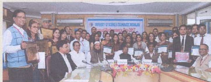
Performer faculties with the Governor of Meghalaya