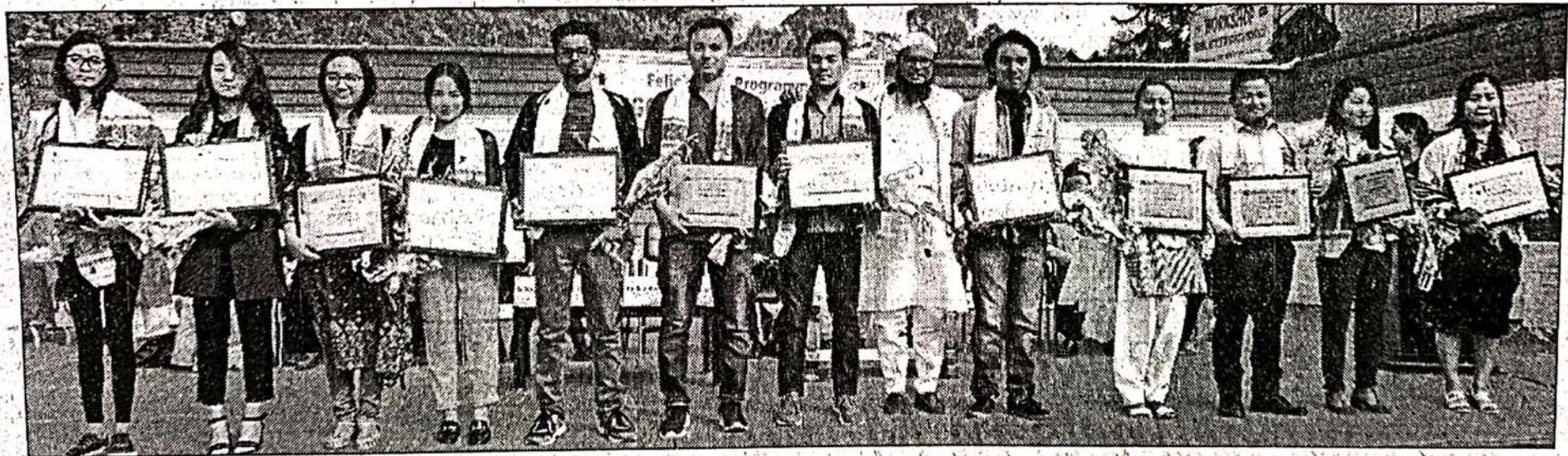
UGC, NET qualified students being felicitated by University of Science and Technology, Meghalaya, on Saturday.