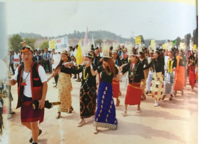
Event began with a magnificent cultural procession, a manifestation of the manifold ethnicity and culture of the North East