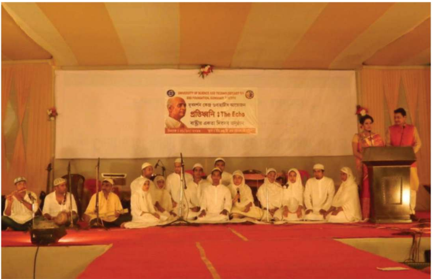
USTM Celebrating Unity Day on 31/10/2016 in Collaboration with Doordarshan Kendra, Guwahati