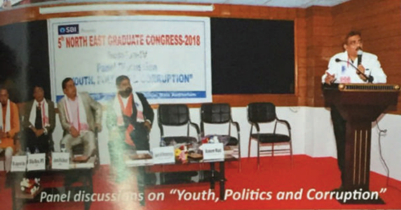
Panel discussions on "Youth, Politics and Corruption"