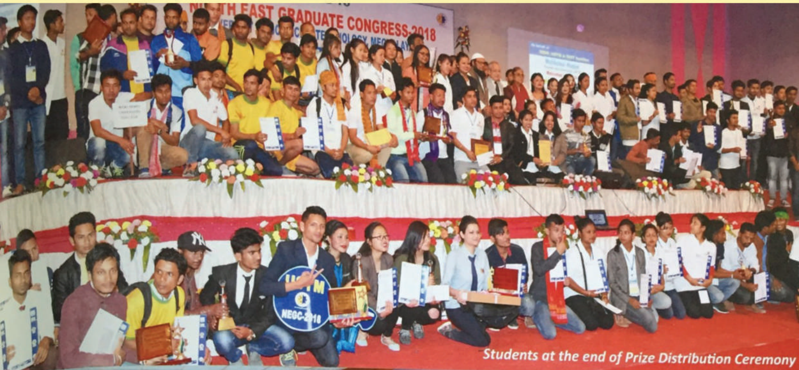
Students at the end of Prize Distribution Ceremony