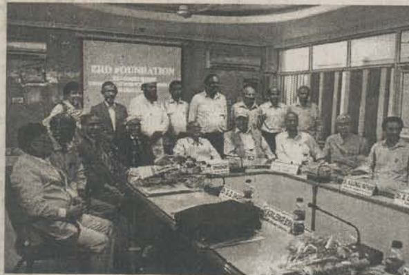
Academicians, scholars and scientists who participated in the academic meet at USTM in Baridua on the outskirts of Guwahati on Saturday.