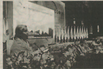
Dr Dipu Moni, Education Minister of Bangladesh, addresses the International Convention of Vice-Chancellors in Sylhet, Bangladesh on Saturday.

Terming ICVC-2019 as an exceptional initiative, Dr Dipu Moni said, "Connectivity between India and Bangladesh has to be reestablished and this is very essential. We are always