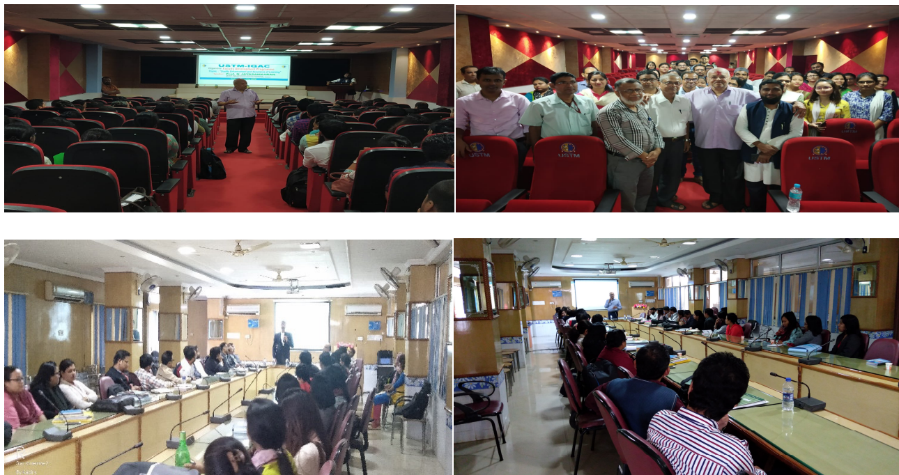
Few representative photograph of the FDP