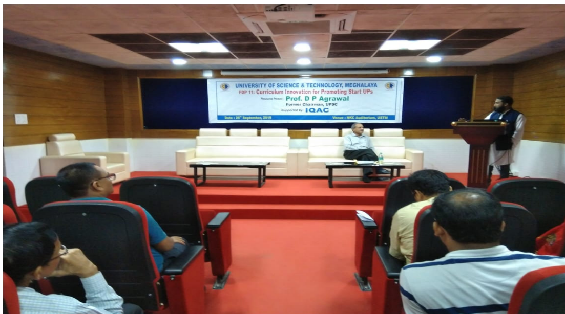
Welcoming the resource person by Academic Registrar on Day 3