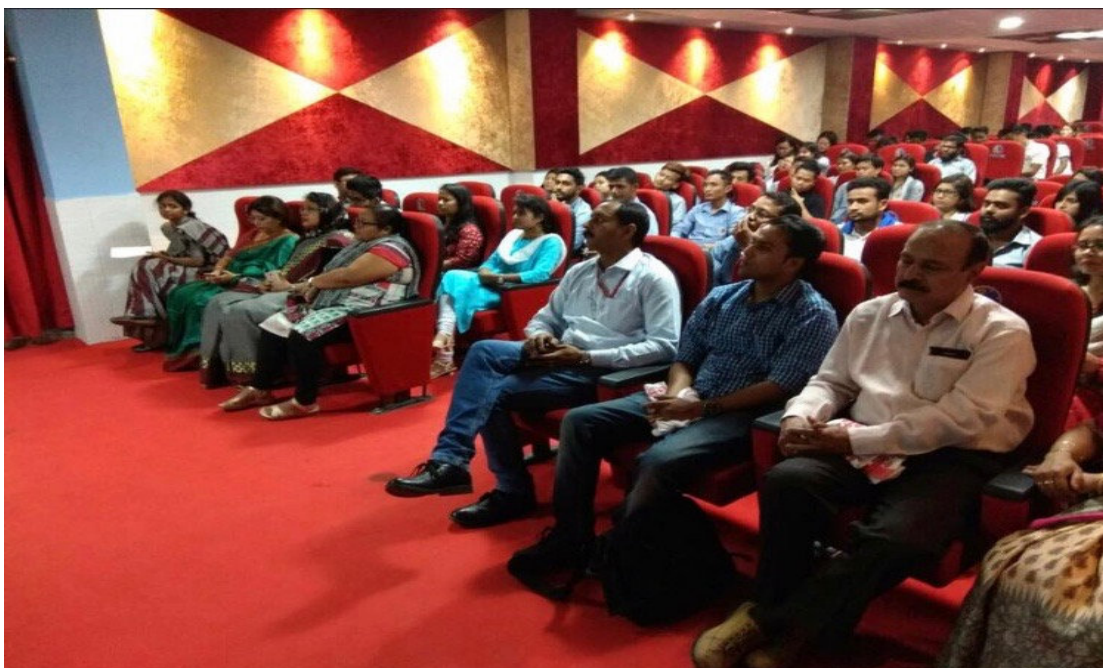
Faculty members attending the Program on Day 6