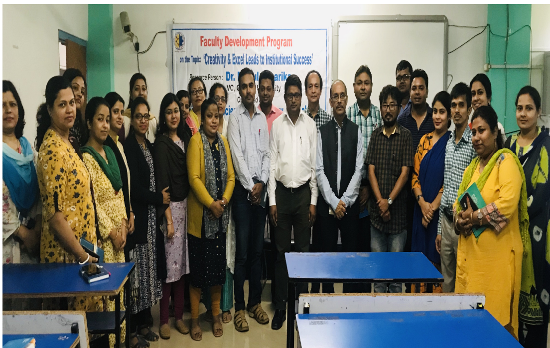
Faculty members along with resource person at the end of the session

He mentioned that restriction of resources can restrict creativity, because employees will be busy for a longer time searching for additional resources, rather than developing new products or services. He concluded with the note that leaders have to provide financial, human, time and other necessary resources which are necessary for the team to generate creative solutions.