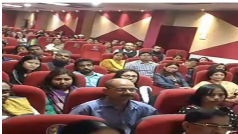
Faculty members attending Day 5 of the FDP