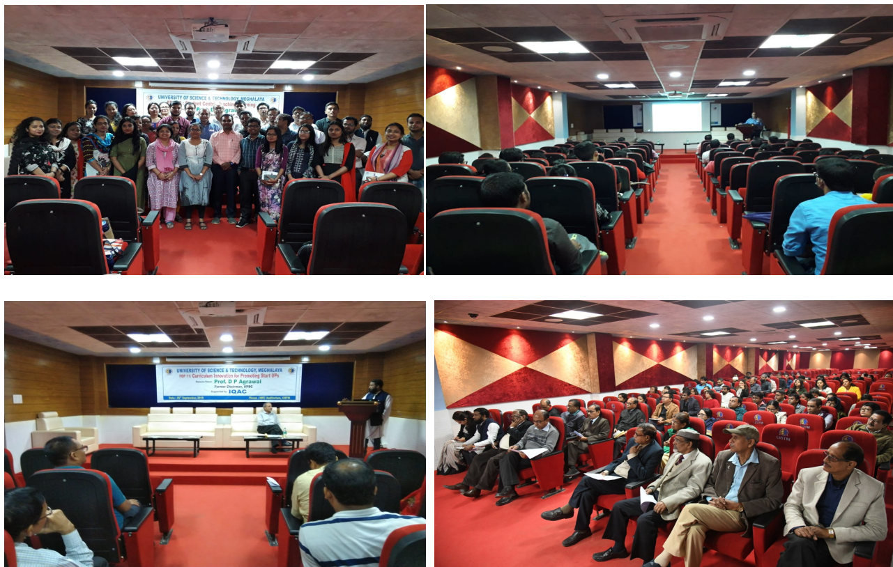
Few representative photographs of the Programme