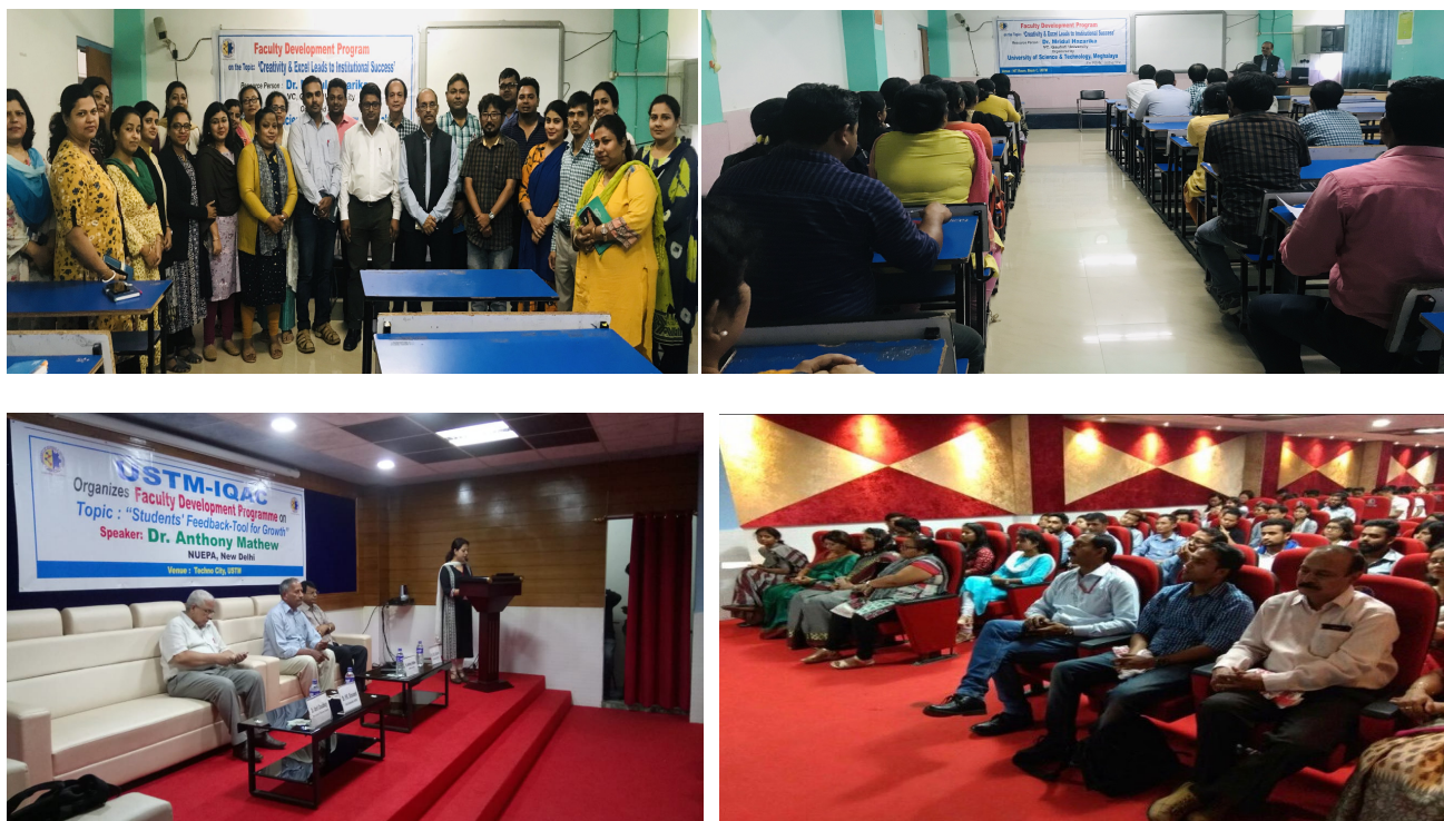
Few representative photographs of the FDP