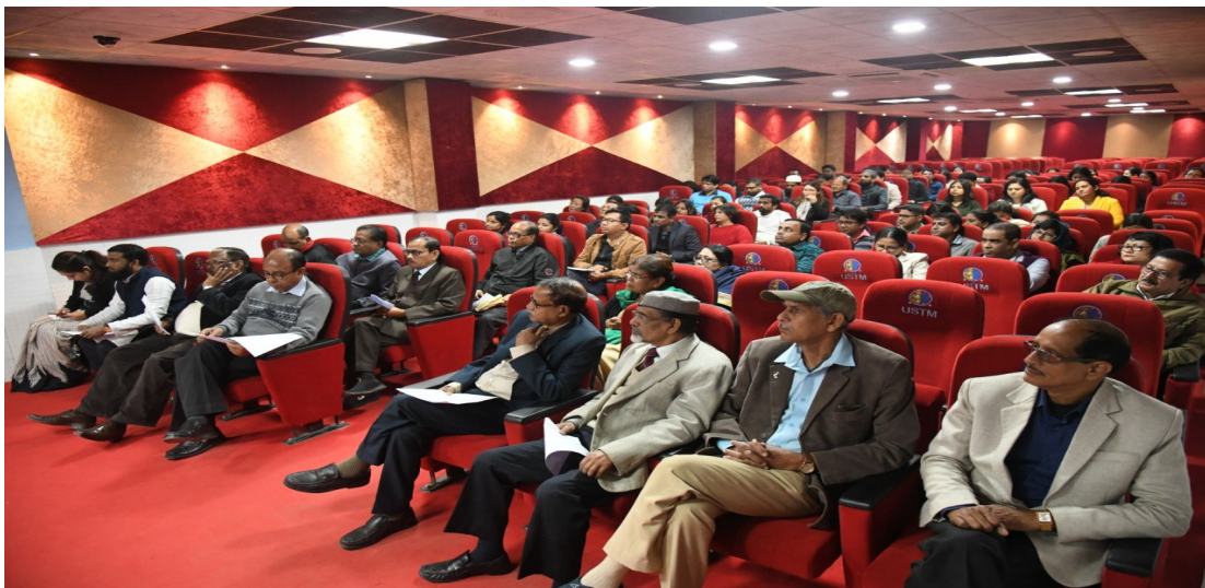
Faculty members attending the FDP in Day 6

According to him Student-centered learning is also known as learner-centered education. It is broadly encompasses methods of teaching that shift the focus of instruction from the teacher to the student. He added that Student-centered learning puts students' interests first, acknowledging student voice as central to the learning experience.