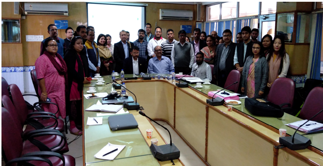
Faculty members along with resource persons at the end of the FDP

This eight days Faculty Development programs was designed to make the faculty members understand the importance of Quality Enhancement in Education Sector. Faculty members also have got a idea about enhancement of quality and assurance learning.