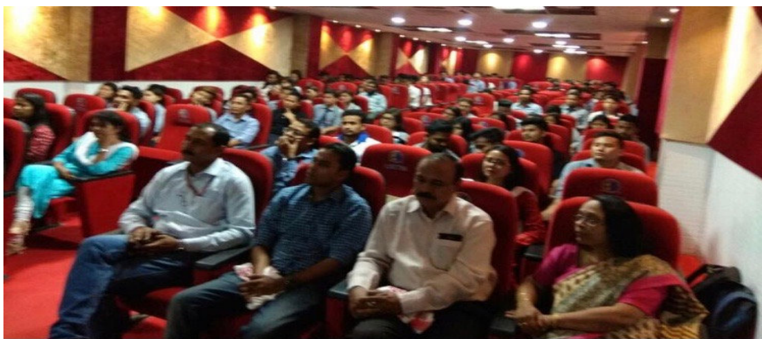
Faculty members attending Day 7 of the FDP

highlighted that it is important that students learn to function in a team environment so that they will have teamwork skill when they enter the workforce. According to her students learn best from tasks that involve doing tasks and involve social interactions. Working in teams increases collaboration and allows brainstorming. As a result, more ideas are developed and productivity improves.