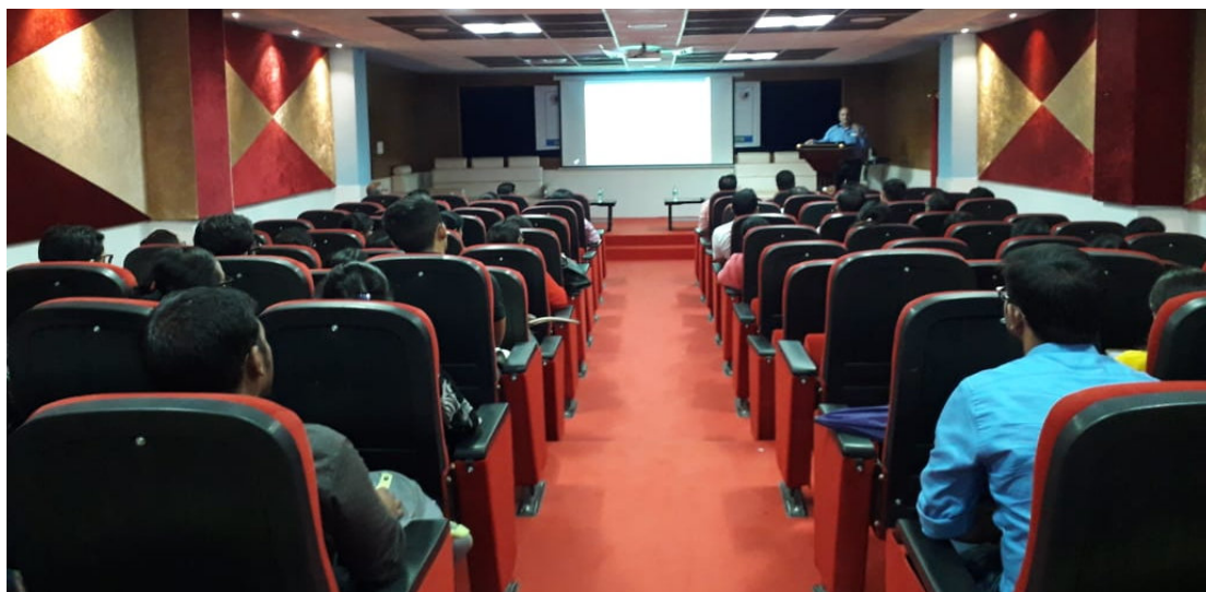
Prof. D. P. Agarwal delivering the lecture

Prof Agarwal said that the student-centered curriculum encourages students to find their passions and paths in education and follow them, resulting in students' gaining their structures of knowledge rather than simply being carriers of a standard, identical knowledge base imparted to all students. Students are not encouraged to just memorize information but are led to work with and use the information they are given, both individually and with other members of the class.