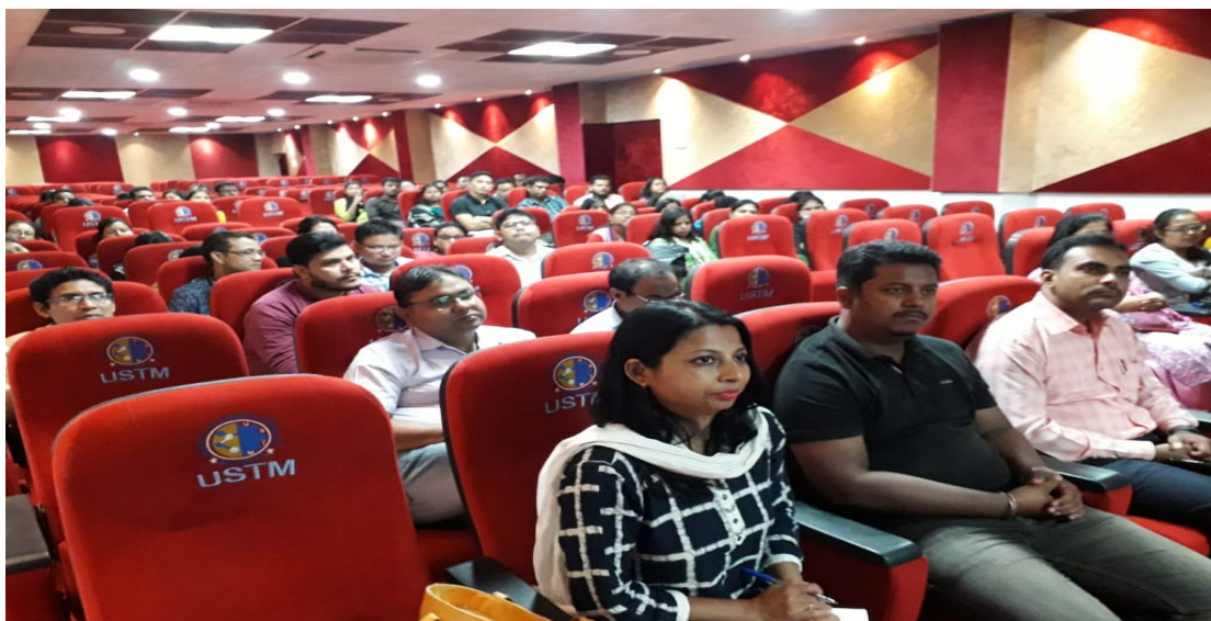
Participants attending the session on Day 5