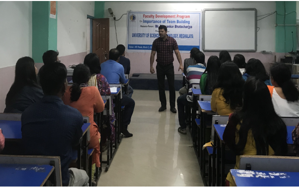
Few representative photographs of the FDP