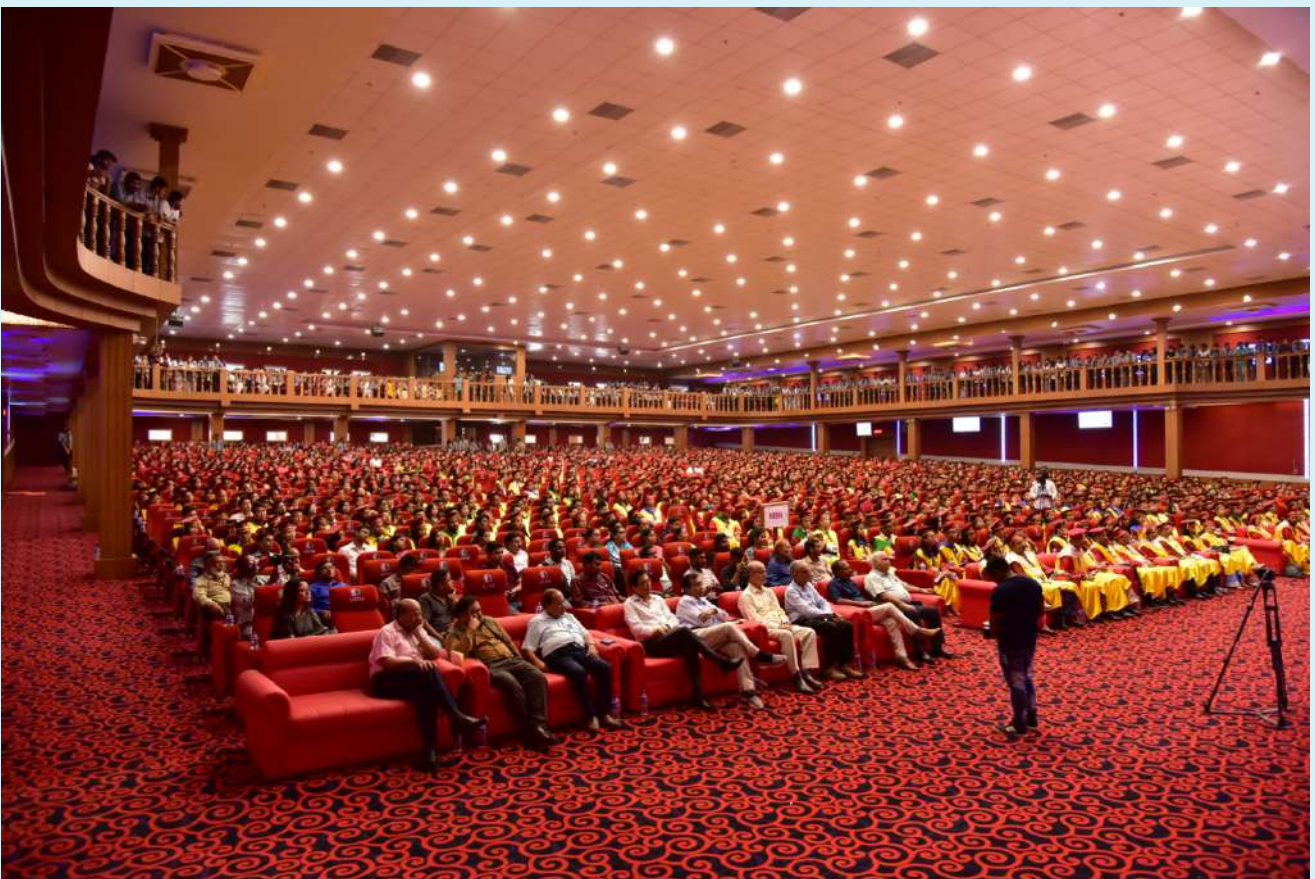
Use of LED Lights in Central Auditorium