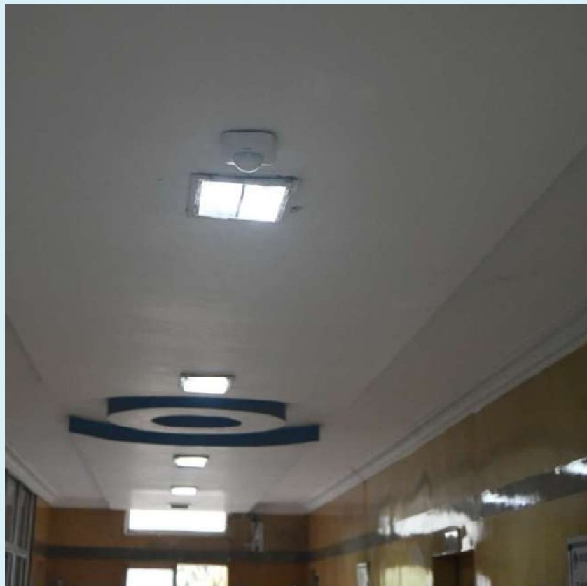
Sensor for Light