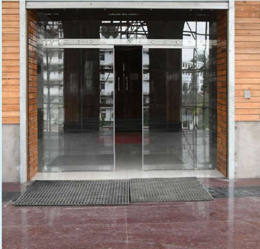
Motion Sensor Door