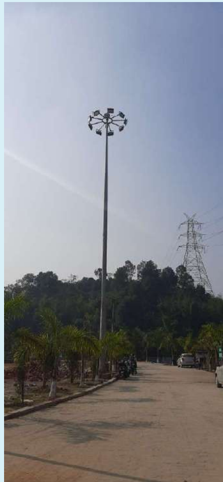
High Mast LED Lights