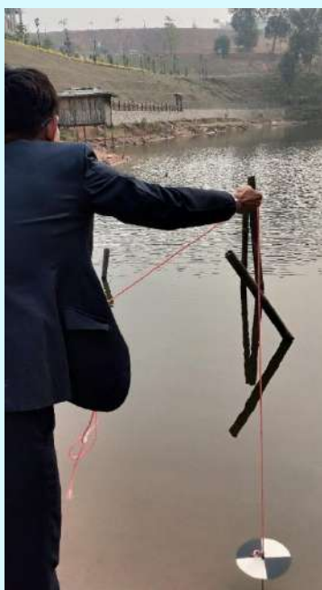
Table 3. Turbidity of water samples

Turbidity is a measure of clarity of a liquid. It is an optical characteristic of water and is an expression of the amount of light that is scattered. Turbidity makes water cloudy or opaque. Turbidity of water in ponds of USTM campus was estimated using a Secchi Disc in Nephelometric Turbidity Unit.