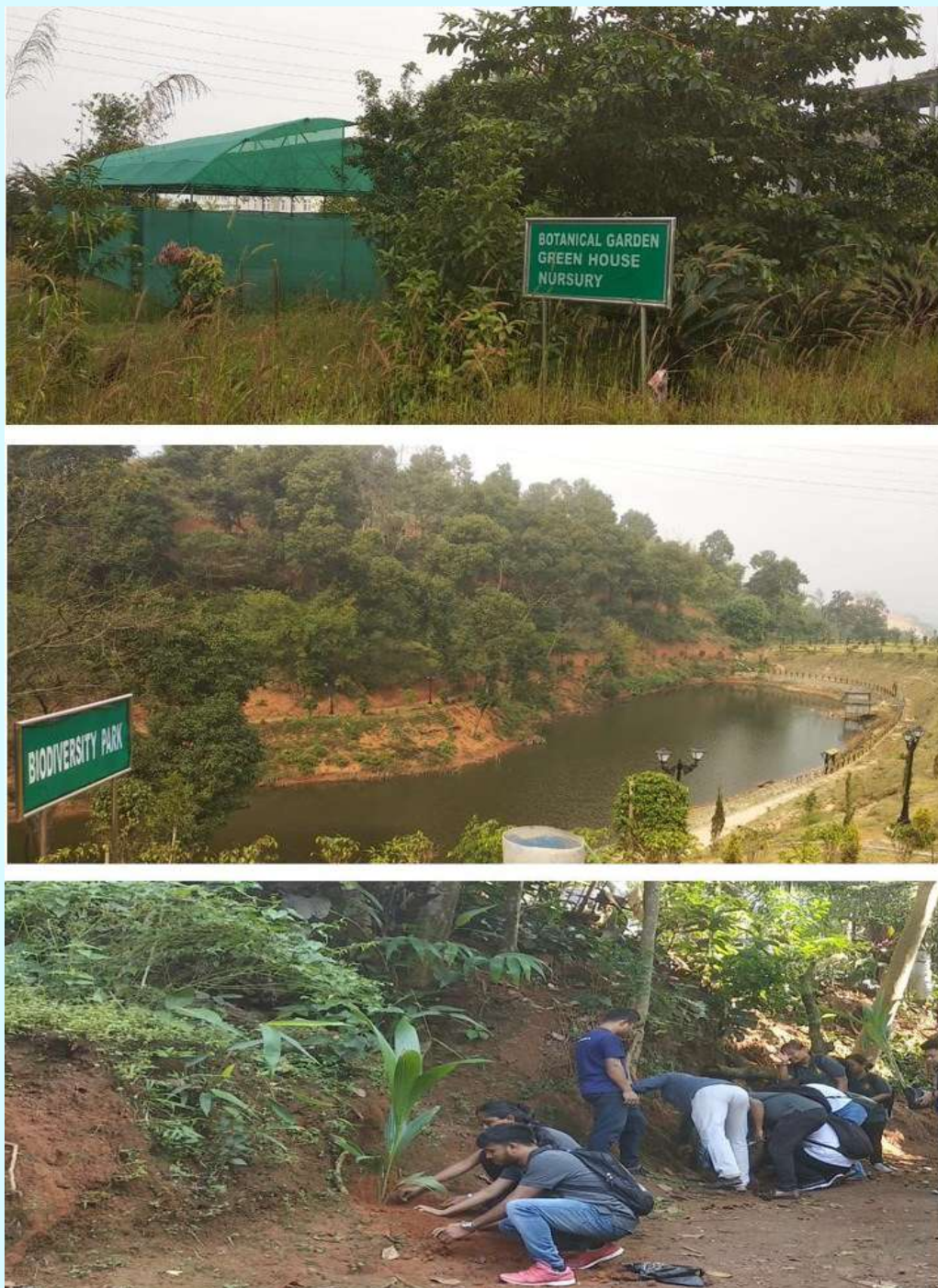
Figure 1: A) Establishment of Botanical Garden, Green house, Nursery; B) Biodiversity Park and C). Plantation drives within the University Campus