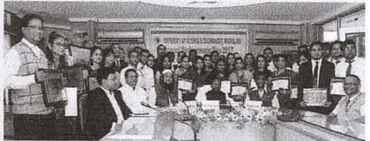
Performer faculties with the Governor of Meghalaya

Meghalaya Governor Sri Ganga Prasad handed over 40 Excellence Awards to selected faculties and Departments of USTM at the 'Annual Performance Day 2017' on 17 November 2017. The awards were instituted by USTM to encourage the teachers and recognize the contribution for educational development. The awards included package of Certificates, Rs 10,000 cash, to and fro airfare to Singapore or Dubai, interest free car loan and 10 days paid leave. Delivering the awards, Sri Prasad said that teachers have many responsibilities and they must play the role of a motivator for the students.