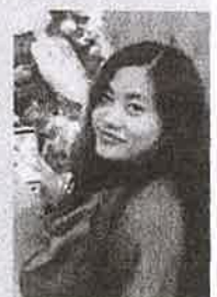
Dzuzehonu Kulnu Geography, UGC-NET