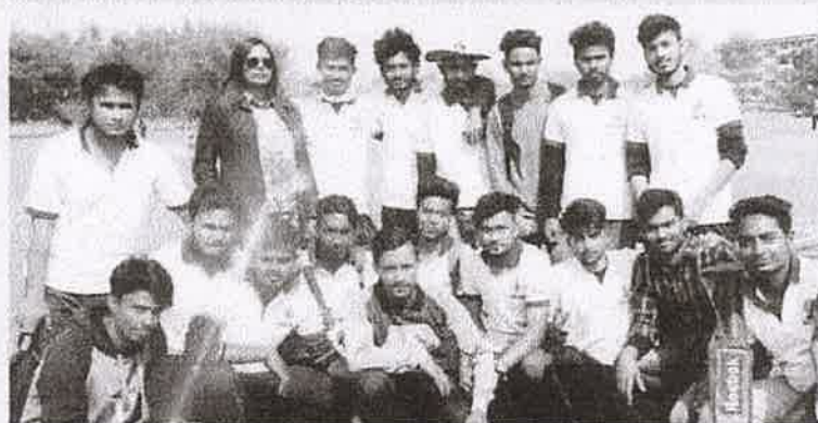
USTM cricket team after winning a match in NGPL Inter Institutions Cricket League in Mirza