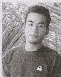
Imsenperong Sociology, UGC-NET