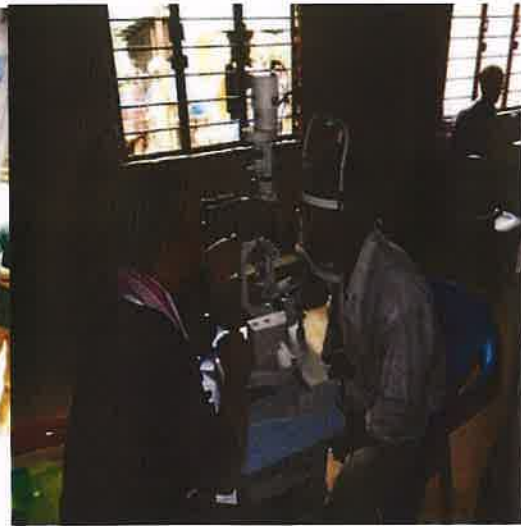
Glimpses of free eye check-up camp at the Mawsami Village, Meghalaya in collaboration with Dispur Poly Clinic, a specialized centre for health and eye care.