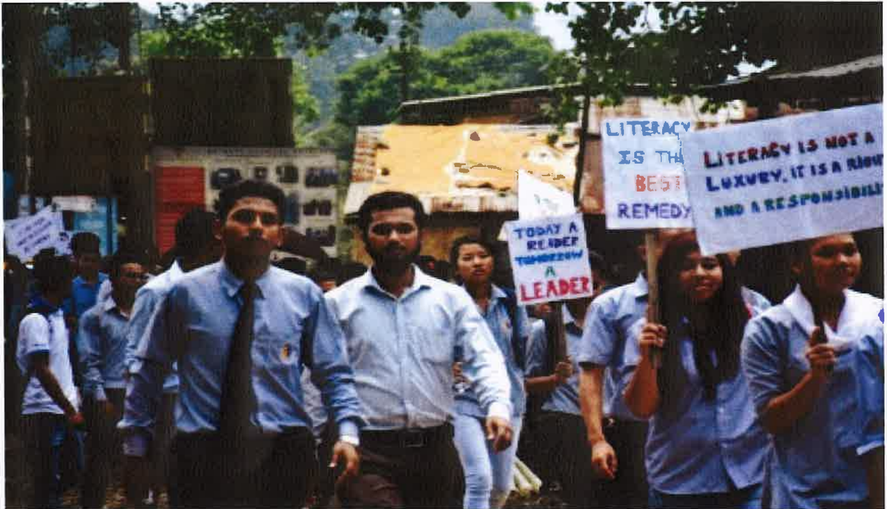
Students participating in Walk for Literacy Rally on the occasion of International Literacy Day 2018 with the slogans and placards displaying the importance of being literate.

On the occasion of International Literacy Day on September 8 the Department of Sociology, University of Science and Technology Meghalaya in association with NSS Cell have organized Rally to raise awareness for education at the Byrnihat village, Ri Bhoi, Meghalaya. The event was organized with an aim to sensitize the local people about the importance of education and it is through education the students can get an ideal scope in life to excel. The rally started from Byrnihat village market and concluded at the Kling Road, NH 37 highway, Meghalaya .