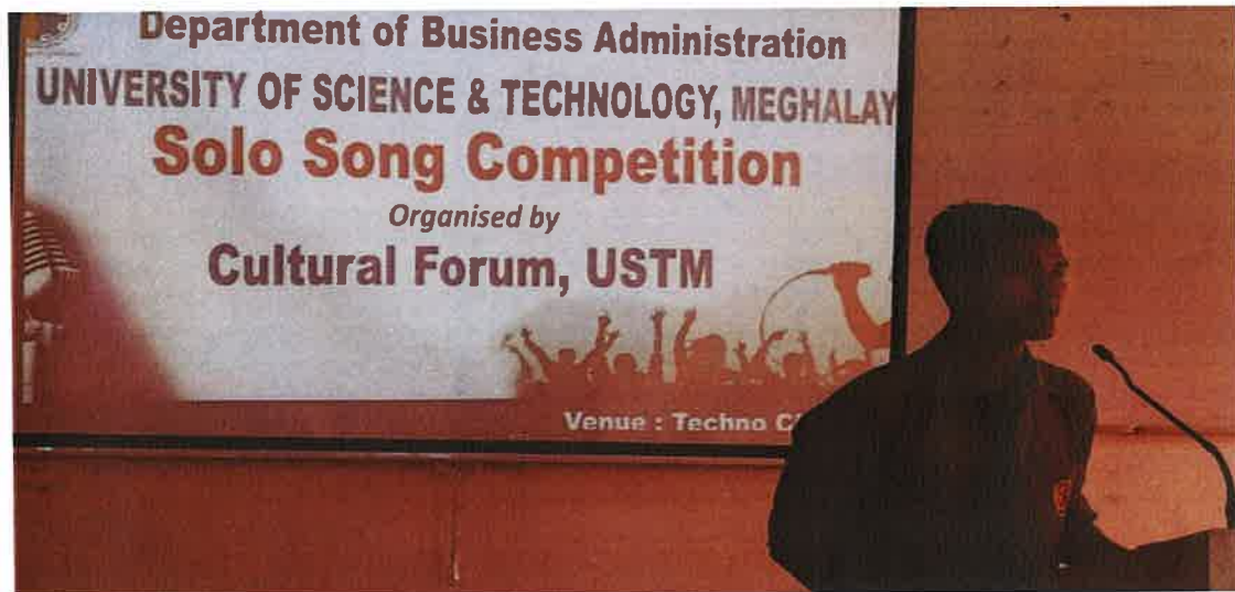
Moment Captured during the singing competition on 148 th Birth Anniversary of Mahatma Gandhi