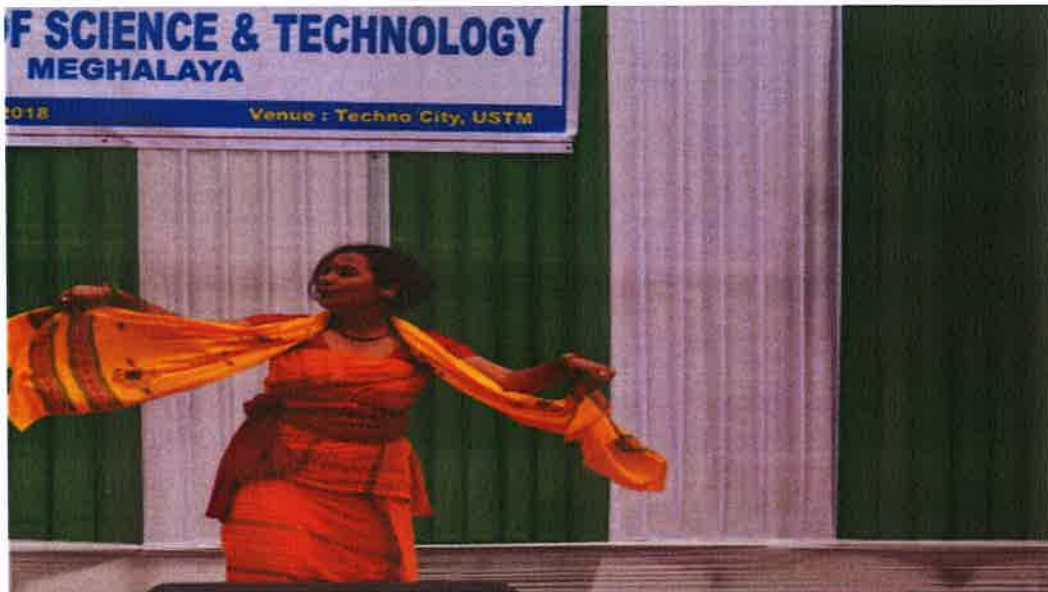
Glimpse of the ongoing dance competition on World Earth Day