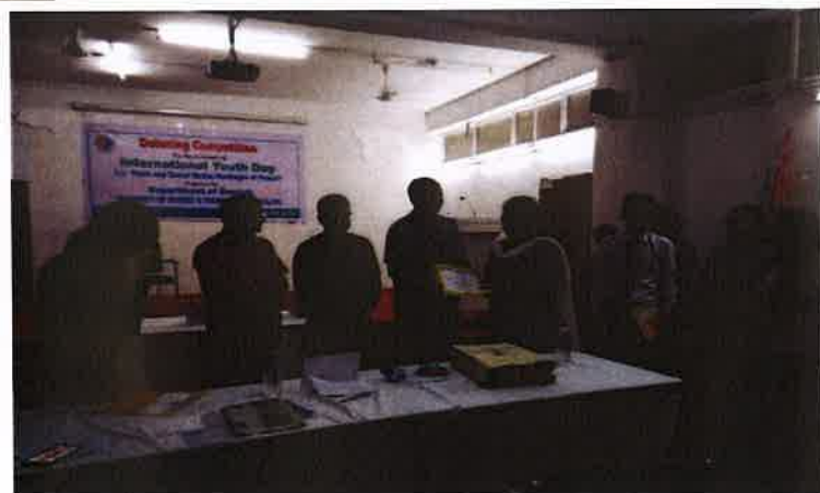
Moments captured during prize distribution ceremony