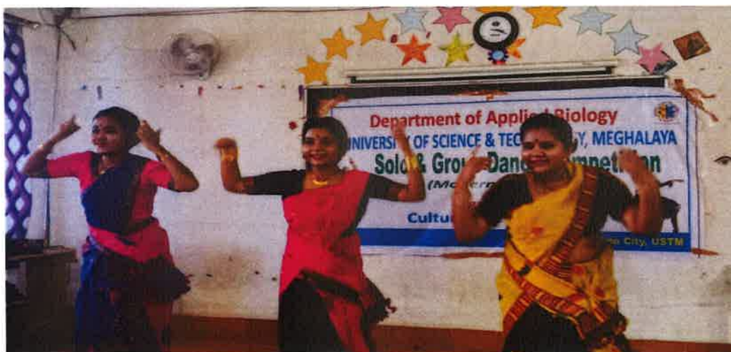
Moments captured during ongoing Solo & Group Dance competition