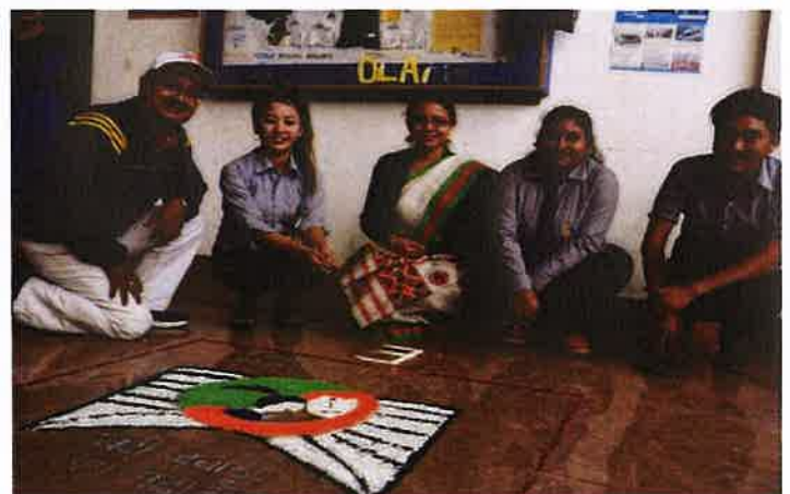
Glimpse of 69 th Republic Day celebration