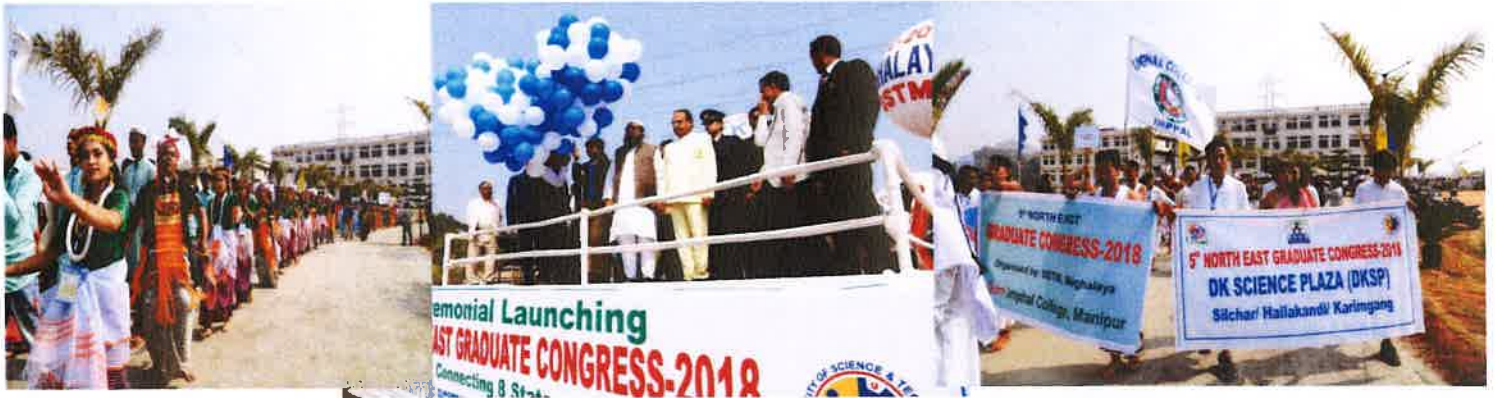
Moment Captured during the Inaugural Ceremony of 5 th North East Graduate Congress – 2018, Cultural Procession