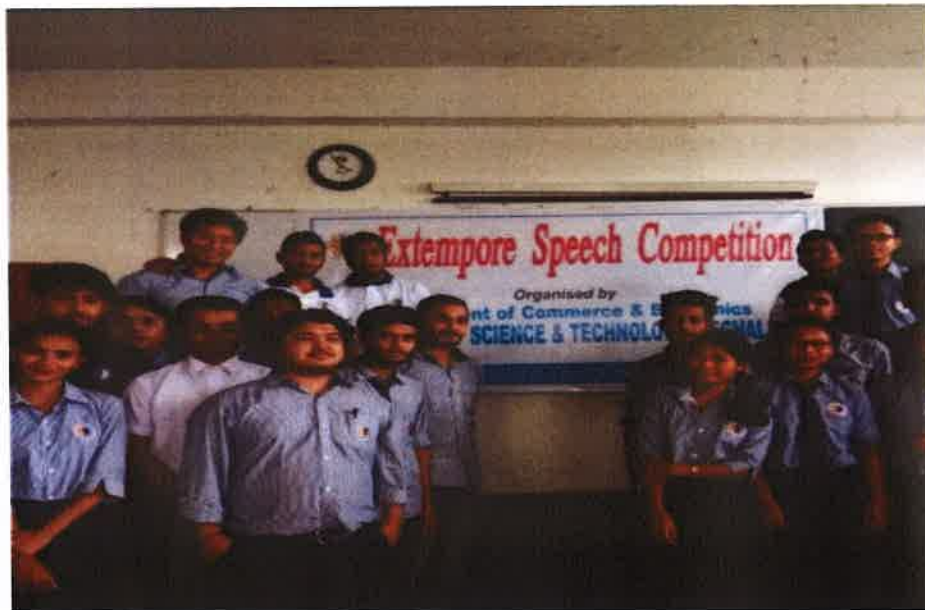
Moment Captured during the Extemporaneous Speech Competition among the students

Many faculty members and students of many departments attended the event.