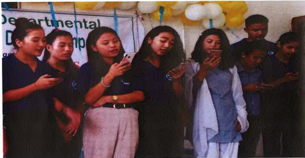
Glimpse of the Group Song competition on Lal Bahadur Shastri Day