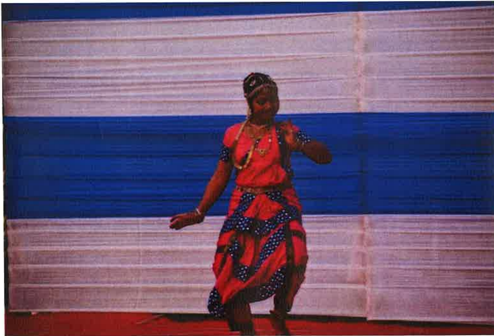
Moment Captured during the Solo Dance competition on Silpi Diwas

Remembering Rupkonwer Jyoti Prasad Agarwala, the Great Cultural Icon of Assam on the occasion of Silpi Divas a brief Cultural program and solo dance competition was organised in front of the Amenity Centre, USTM on 17 th January 2017. Many students participated and performed many different genres of dance forms and best among them were awarded. The faculty members and students of USTM were present on the occasion and they also participated in the program.