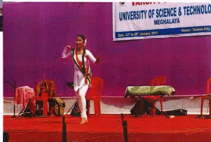
Glimpse of the Solo Dance competition