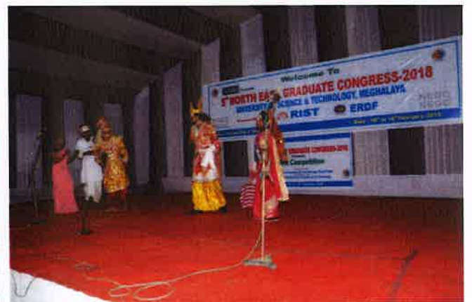
Glimpse of different cultural competition and cultural program