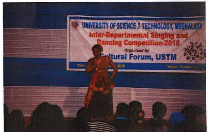
Moment Captured during the Dancing competition