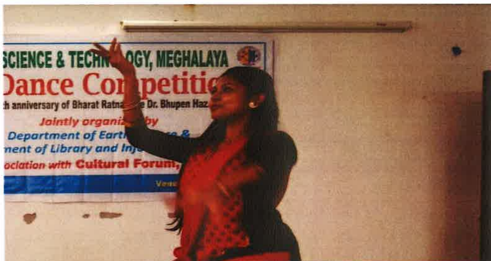
Glimpse of the Solo Dance performance by the student on ongoing dance competition