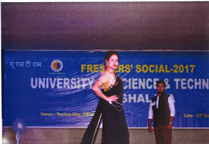
Moment Captured during the ongoing Mr. & Miss Fresher's Competition 2017