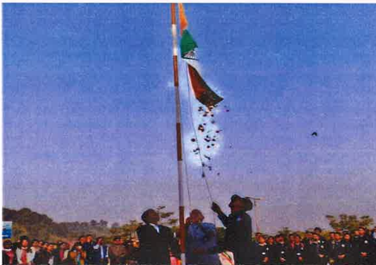
Moment Captured during flag hoisting ceremony on 70 th Republic Day

On 26 th January 2018 USTM celebrates 70 th Republic Day. The Tri Color was unfurled in presence of Mahbubul Hoque, Chancellor to USTM, PK Goswami, VC USTM & all the Dignitaries, faculty members, staff and students. Soon after hoisting of the National Flag, various programmes began in the university campus. On the very auspicious occasion various cultural competitions were organized. Students of USTM performed in various cultural competition like singing, dancing etc. Winners were complimented for their best performances and awarded.