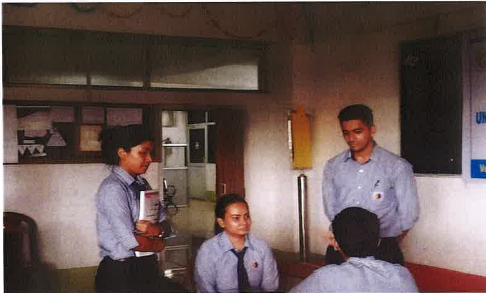
Glimpse of the ongoing drama competition