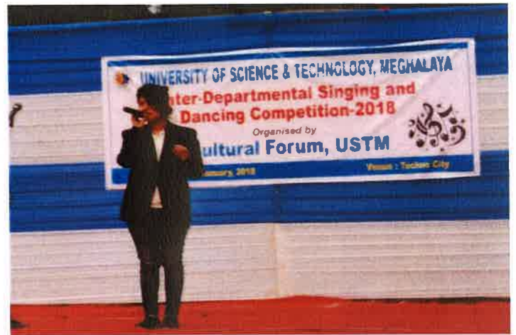
Moment Captured during the Singing competition