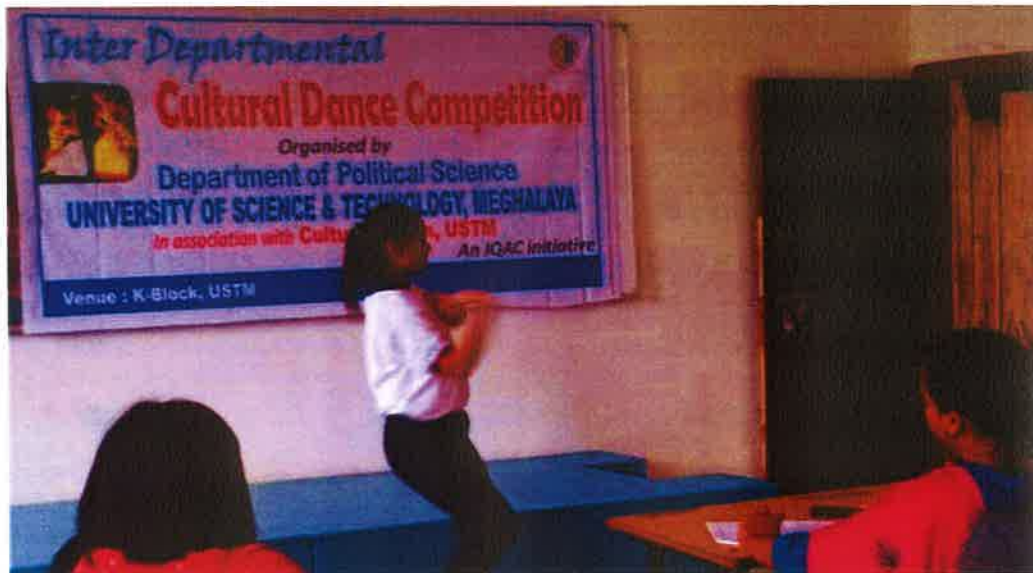
Moment Captured during the ongoing interdepartmental dance competition