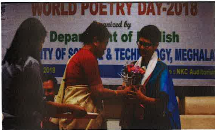
Moment Captured during the Felicitation ceremony of the dignitaries on the dice.

Students belonging to different dept. participated in Recitation & Writing competition. Winners were complimented and awarded.