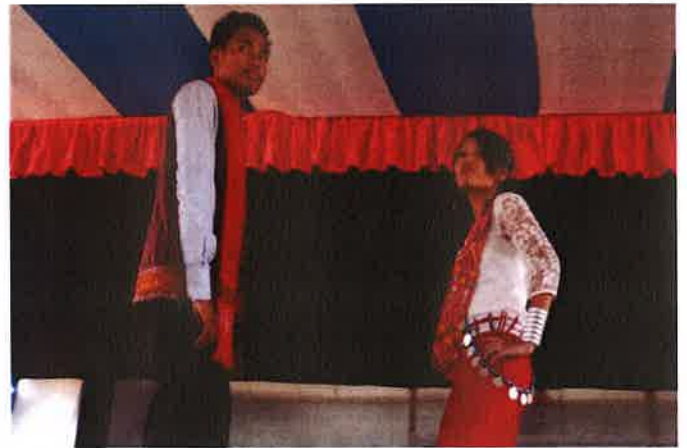
Moment Captured during the ongoing Ethnic Wear competition