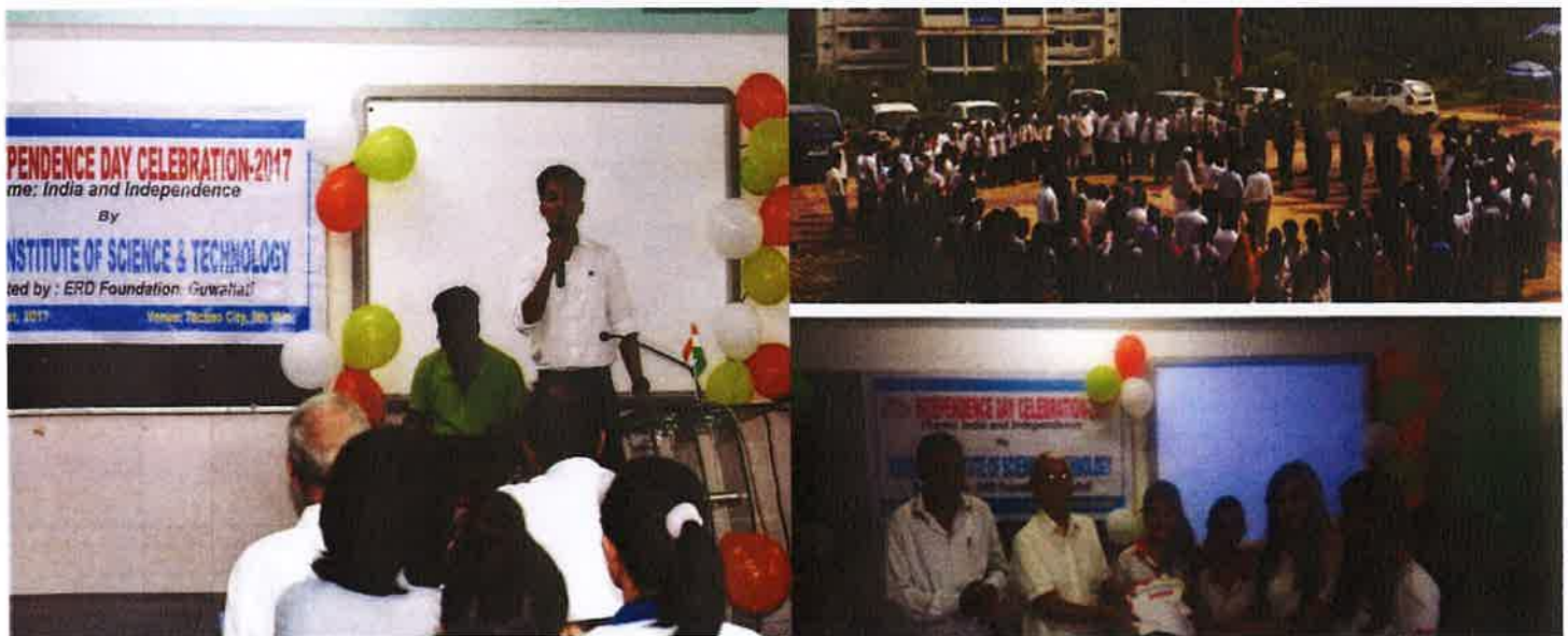
Moments captured during celebration of 71th Independence Day