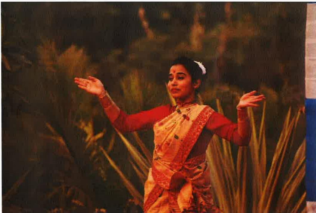
Moment Captured during the ongoing dance competition