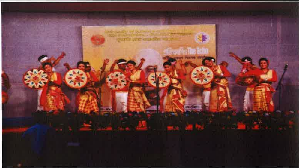
Glimpse of beautiful Folk Dance bihu on National Unity Day

15 ethnic dances of India with special emphasis on those representing the North East were presented by students of USTM. The chancellor announced cash awards of Rs. 10000 each to two best performances. The remaining 13 troops were given Rs. 5000 each.