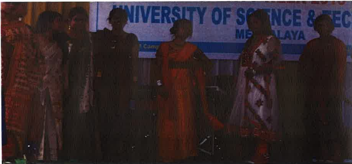
Moment Captured during the ongoing ethnic wear competition