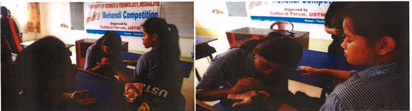
Glimpse of the Mehendi Competition on the Occasion of Assamese New Year Celebration