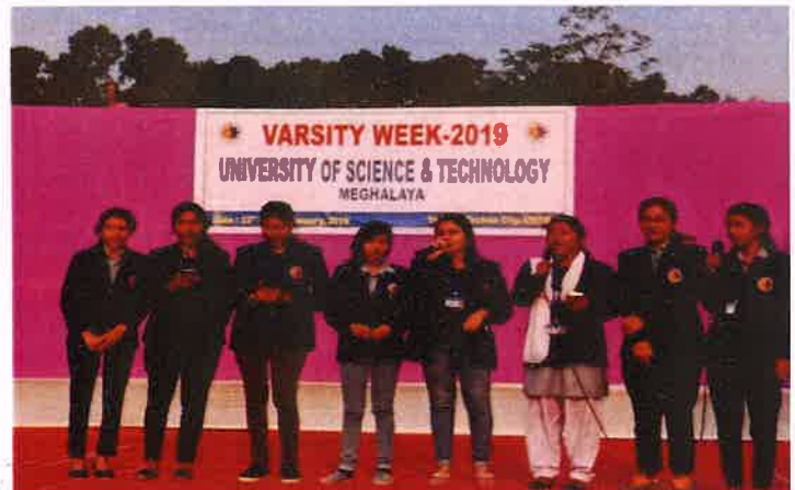
Moment Captured during the Flag Hoisting ceremony, Varsity Week 2019