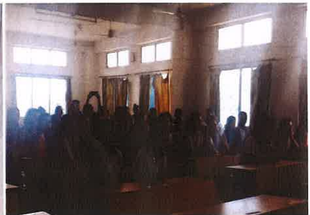
Moment Captured during the ongoing Solo Singing competition