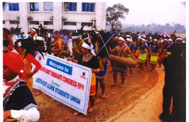
Moments captured during ongoing Cultural procession NEGC – 2019