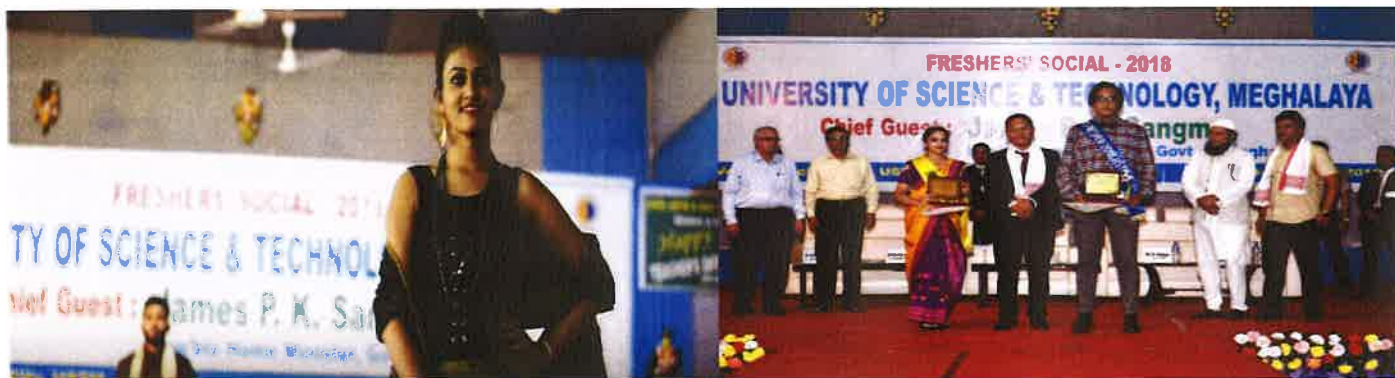
Glimpse of the Mr. & Miss Fresher's Competition and Prize Distribution Ceremony

The prizes for 100 % attendance of students, Crowning of Mr. and Miss – 2018 along with different Freshers related competition prizes were also distributed. The program was concluded with a colorful Cultural program performed by our students.