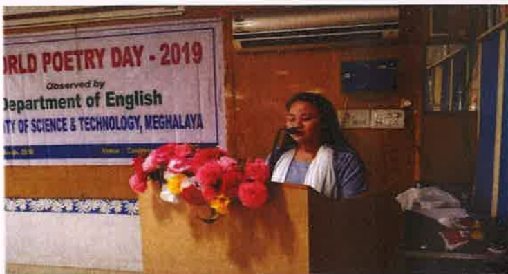
Glimpse of Poem Recitation competition on World Poetry Day

The event ended with a note of creating harmony among the variegated culture of North East India