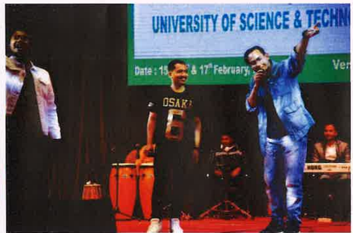
Moments captured during Cultural Program NEGC,2019