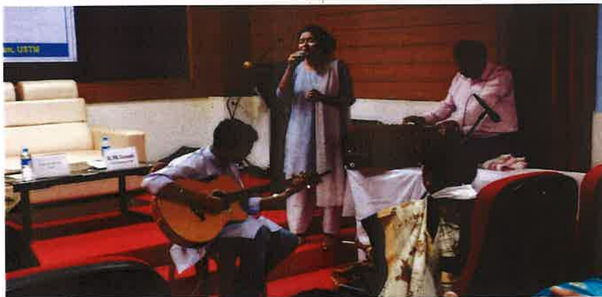
Glimpse of the Solo Song performance by the student