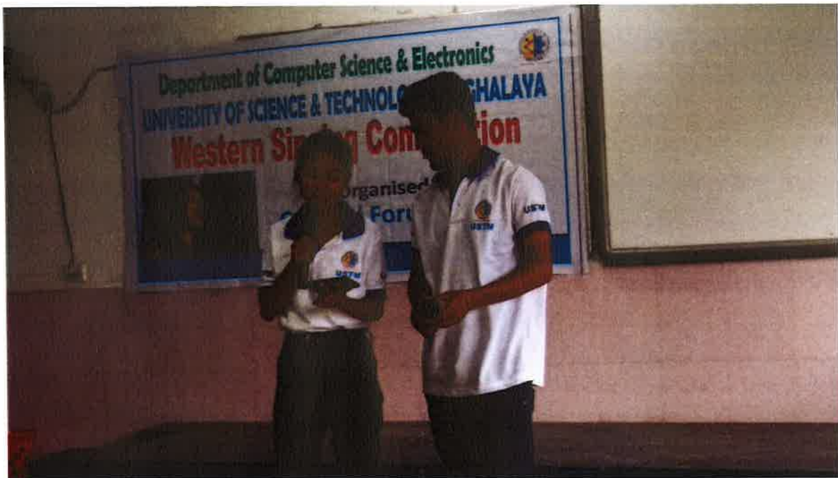
Glimpse of the singing performance by the student

The performances were enthralling and enjoyed by all.