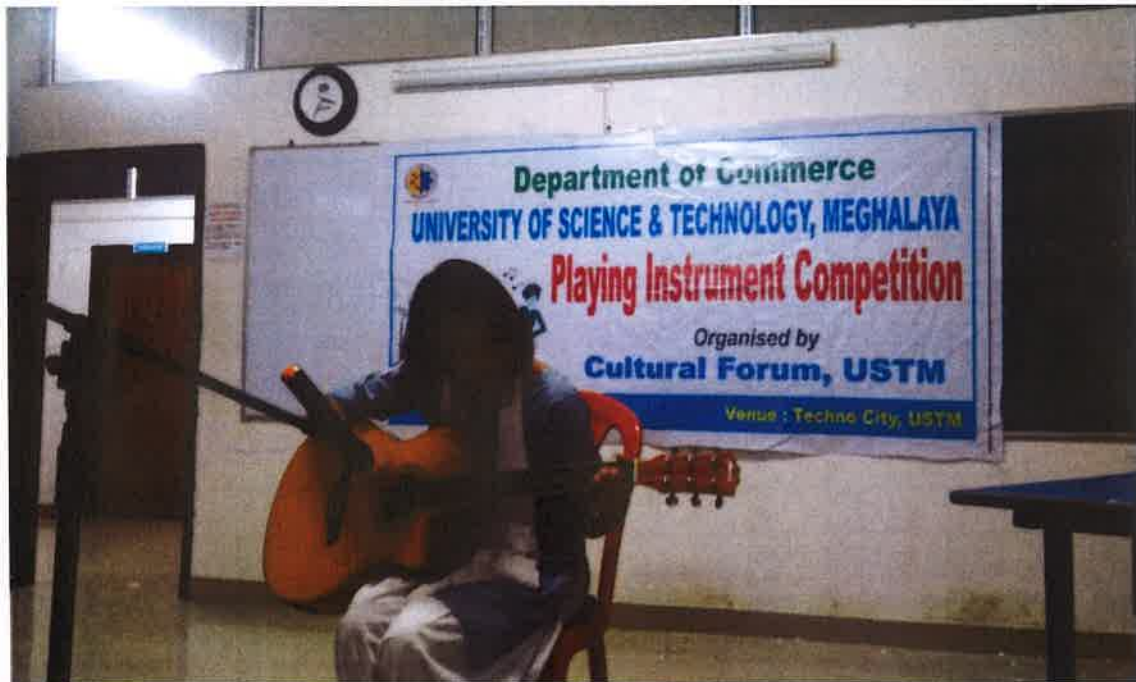
Glimpse of the Instrument playing performance by the student on Children's Day celebration