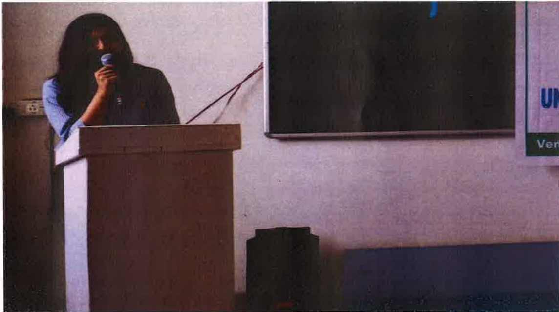
Moment Captured during the ongoing poem recitation competition

On 23 rd January 2019 department of political science along with cultural forum celebrates Birth Anniversary of Netaji. The students and faculties all pay tribute to the great soul of our nation Netaji Subhash Chandra Bose. On that auspicious occasion cultural forum organized a poem recitation competition and all the participants recited beautiful poems and best of them were honored with hampers. Most of the students and the faculty members attended the event.