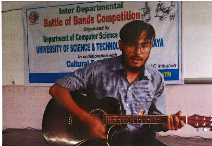
Glimpse of the ongoing competition of battle of bands