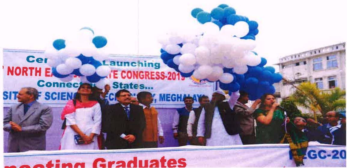
Glimpse of Inauguration Ceremony of Cultural Procession of 6 th North East Graduate -2019