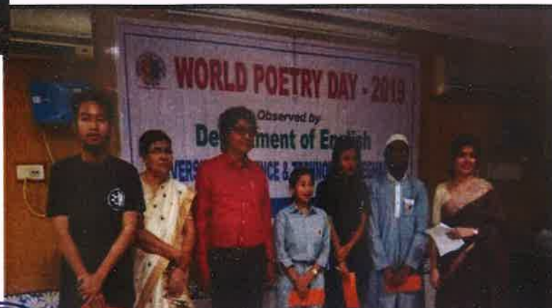
Moment captured during prize Distribution Ceremony