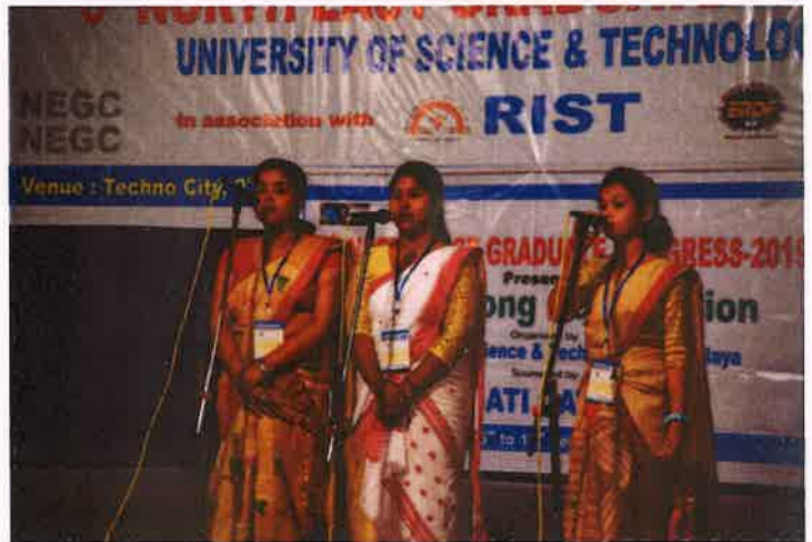
Moments captured during ongoing Cultural competitions NEGC – 2019