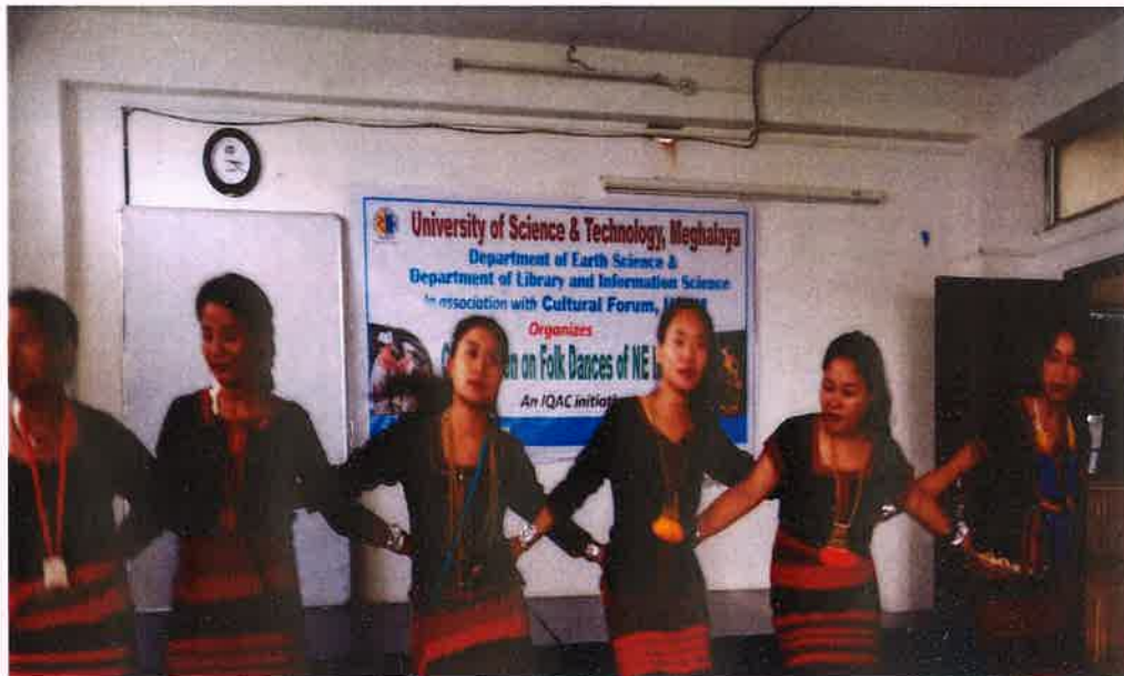
Moment Captured during the ongoing Folk Dance Competition on National Tourism Day 2019