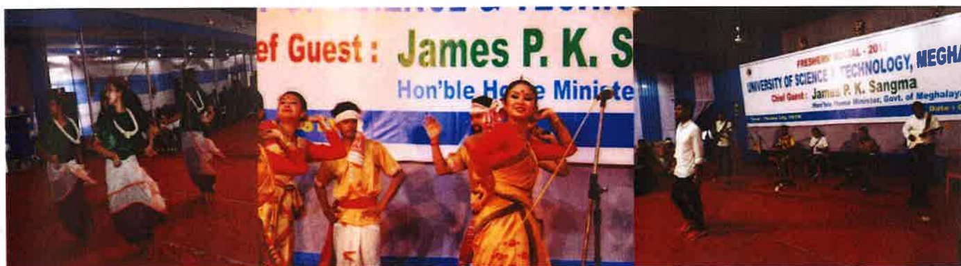
Glimpse of different amazing cultural performances on Fresher's Social 2018