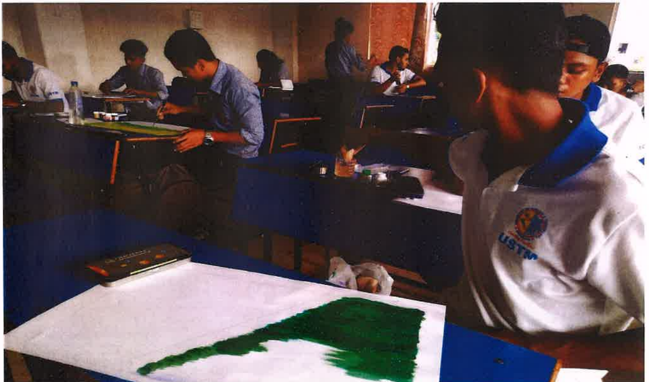
Glimpse of Inter departmental Painting Competition at USTM campus on World Earth Day