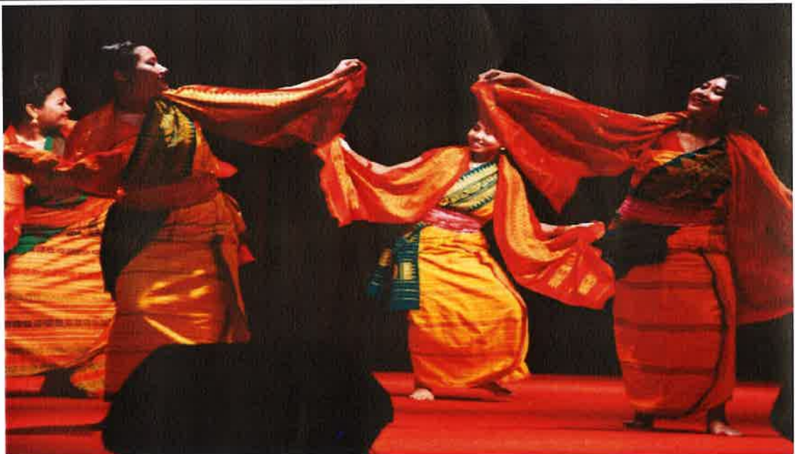
Glimpse of the Bodo Dance performance by the student on the occasion of Silpi Divas