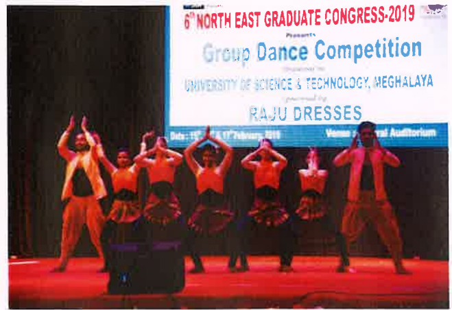
Moments captured during ongoing Cultural competitions NEGC – 2019