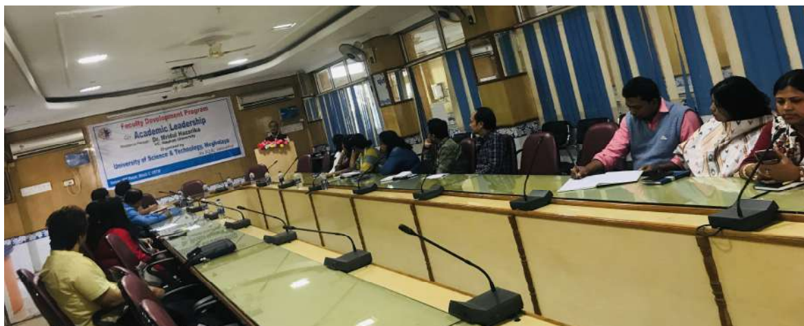
Participants attending the session