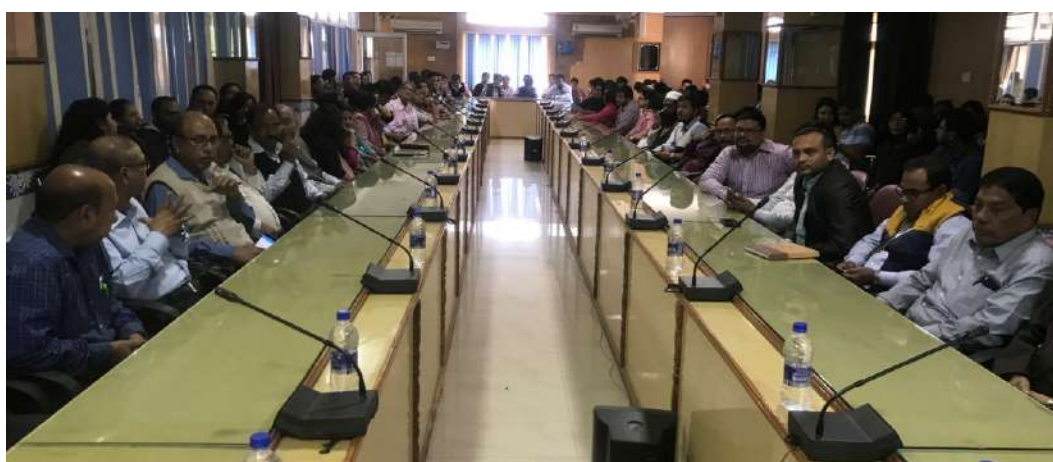
Participants attending the FDP on Academic Administration