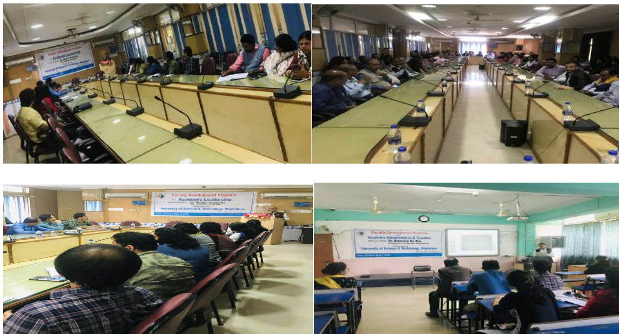
Few representative photographs of the FDP