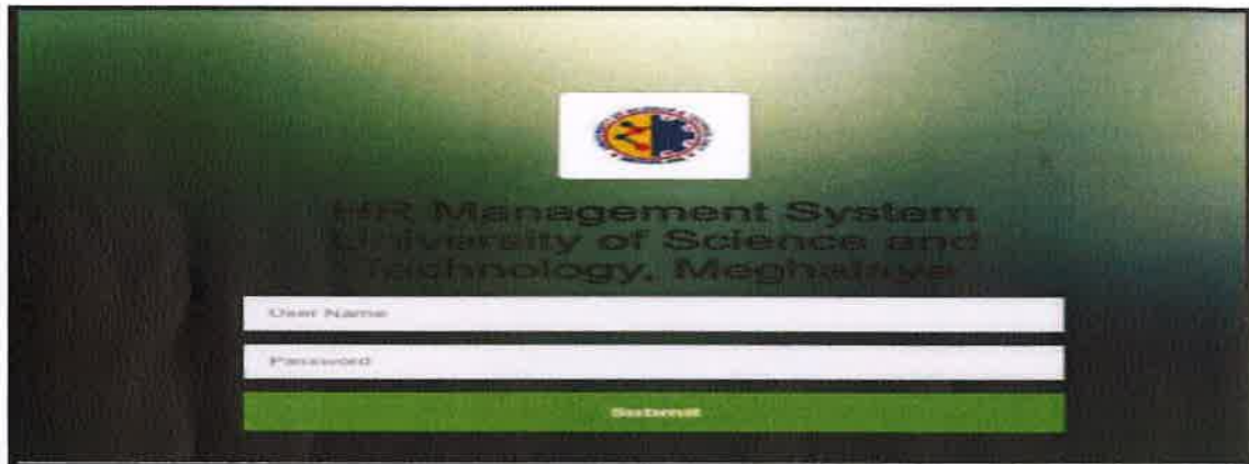
HR & ADMINISTRATION LOG IN PAGE

An HRM system allows employers to store and track all human resources documents, training and evaluations.