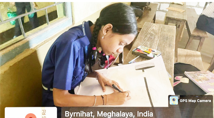
Poster making competition at Rangsakona Secondary School, Byrnihaat.