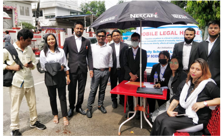
Providing legal assistance in front of C.J.M Court by students of USLR