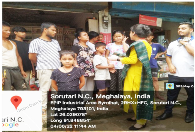
Some photos while discussing with the people.