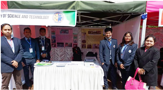
National Science Day Celebration at IGP Point, Shillong.-2022