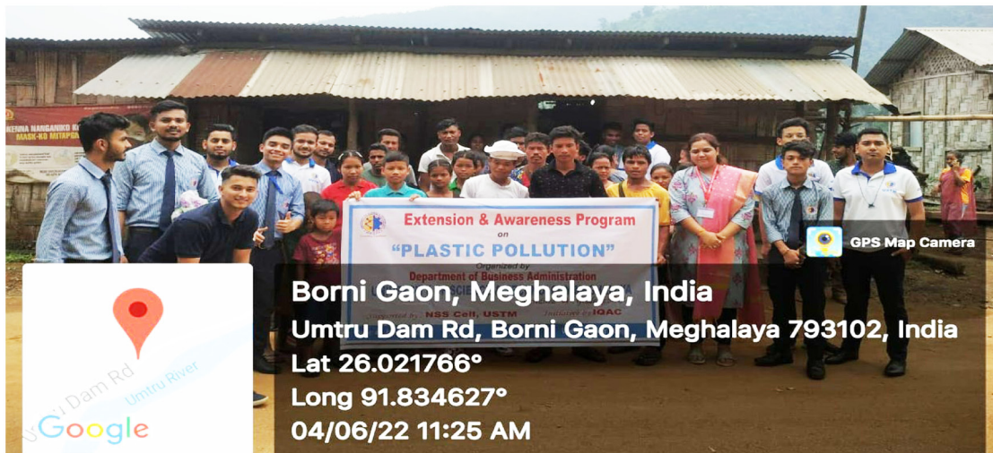
Students and village people in the extension program