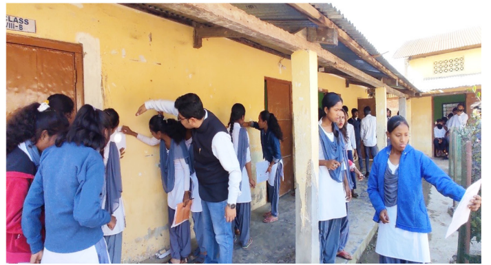
Photographs captured during workshop on Day time Astronomy.