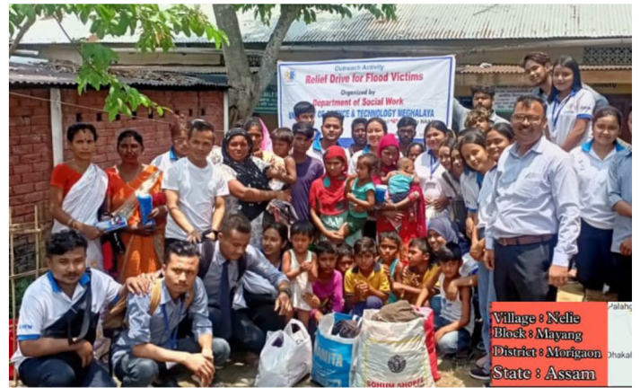
Relief Drive for Flood Victim.

USTM Students offered relief to 50k+ families during lockdown @ COVID 19