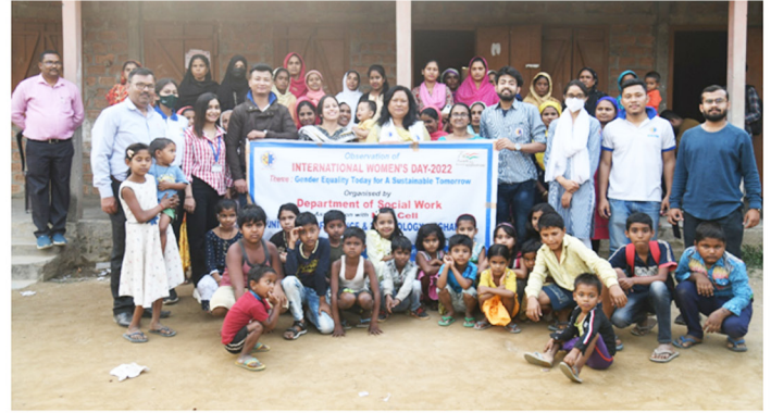
International Women's Day Celebration-2022