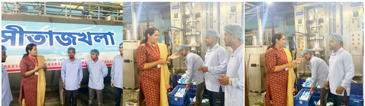
Students and Faculty with workers of Sitajakhala (organized workers)