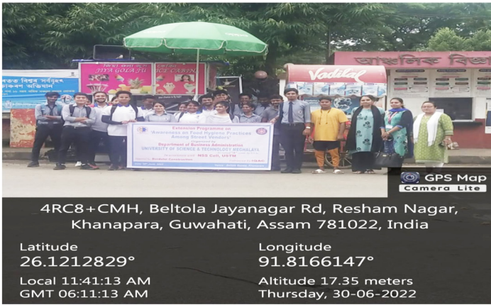
During Extension Program an Interaction took place among the Street Vendors