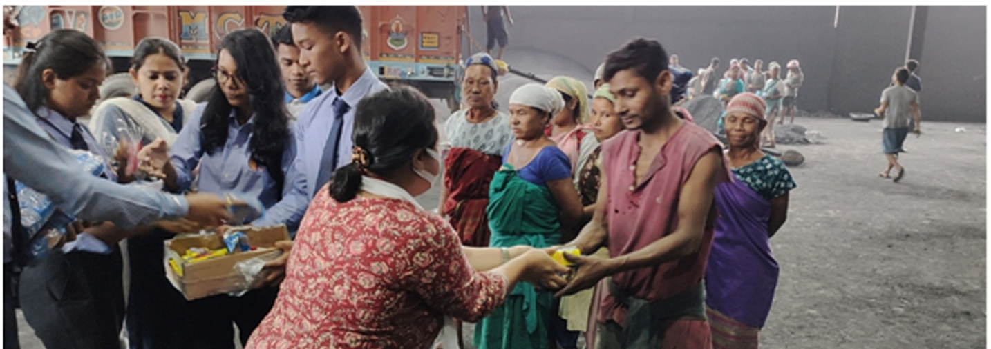
At the time of Spreading Awareness on Social Security amongst the unorganized workers and the distribution of tokens and refreshments.