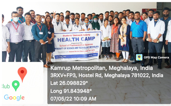
Health Camp at Baridua-2022