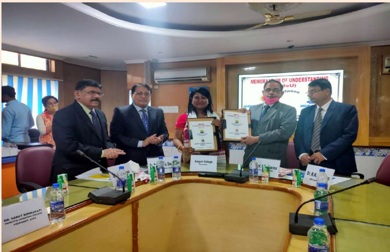
MoU Signing Ceremony between USTM and Amguri College Amguri, Sivasagar dated 11/11/2021