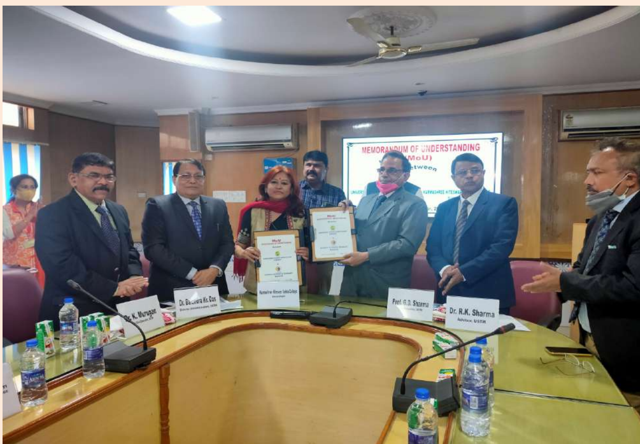
MoU Signing Ceremony between USTM and Karmashee Hiteswar Saikia College, Guwahati dated 24/11/2021