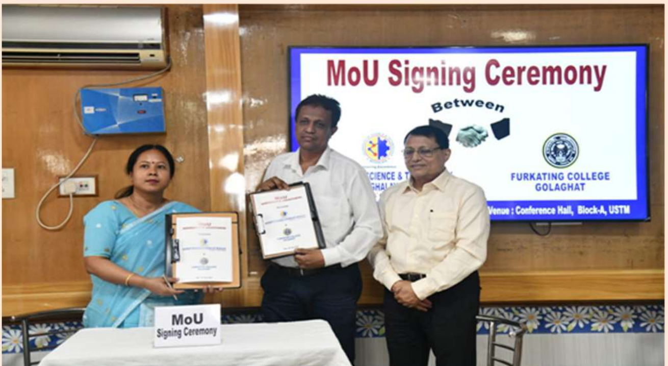
MoU Signing Ceremony between USTM and Furkating College, Golaghat dated 28/04/2022 DELEGATES FROM ACROSS INDIA BRAINSTORM AT USTM ON POLITICS & INTERNATIONAL RELATIONS