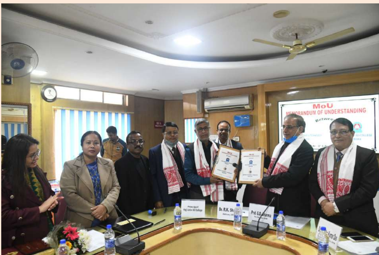
MoU Signing Ceremony between USTM and Haji Anfar Ali College, Doboka, Nagaon dated 08/02/2022