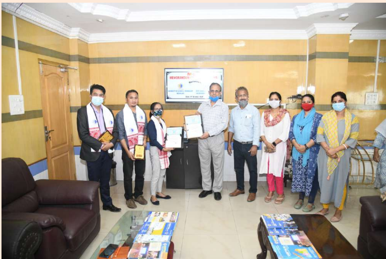
MoU Signing Ceremony between USTM and Patent Information Centre, State Council of Science, Technology & Environment (SCSTE), Meghalaya dated 18/08/2021