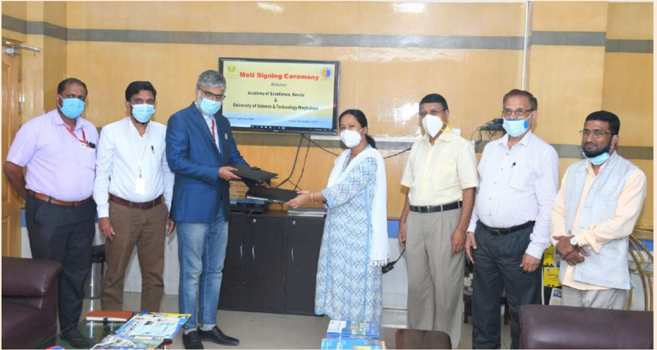
MoU Signing Ceremony between USTM and Academy of Excellence, Calicut Kerala dated 1/9/2021