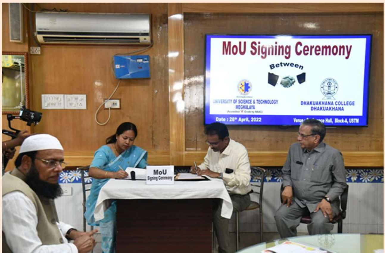
MoU Signing Ceremony between USTM and Dhakuakhana College dated 28/04/2022