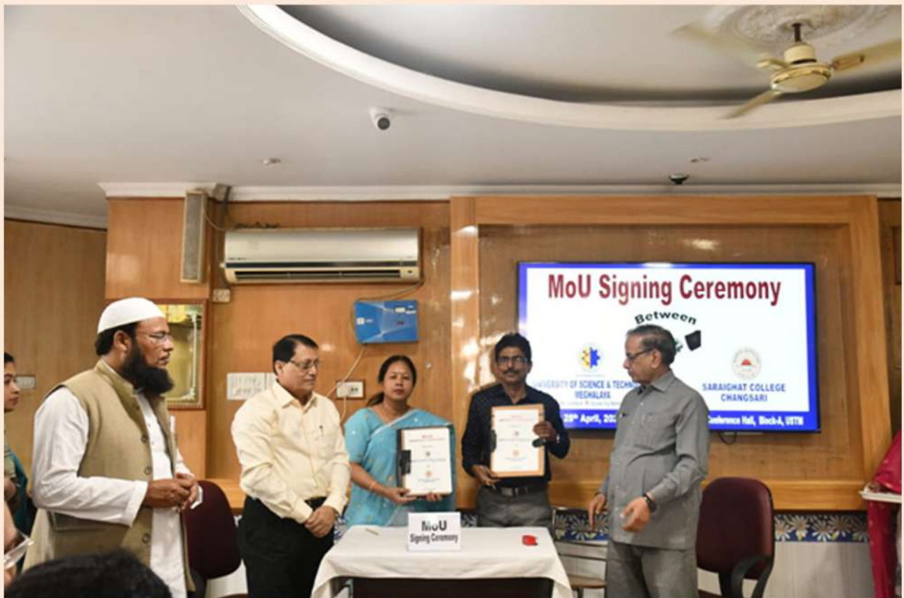
MoU Signing Ceremony between USTM and Saraighat College, Changsari dated 28/04/2022