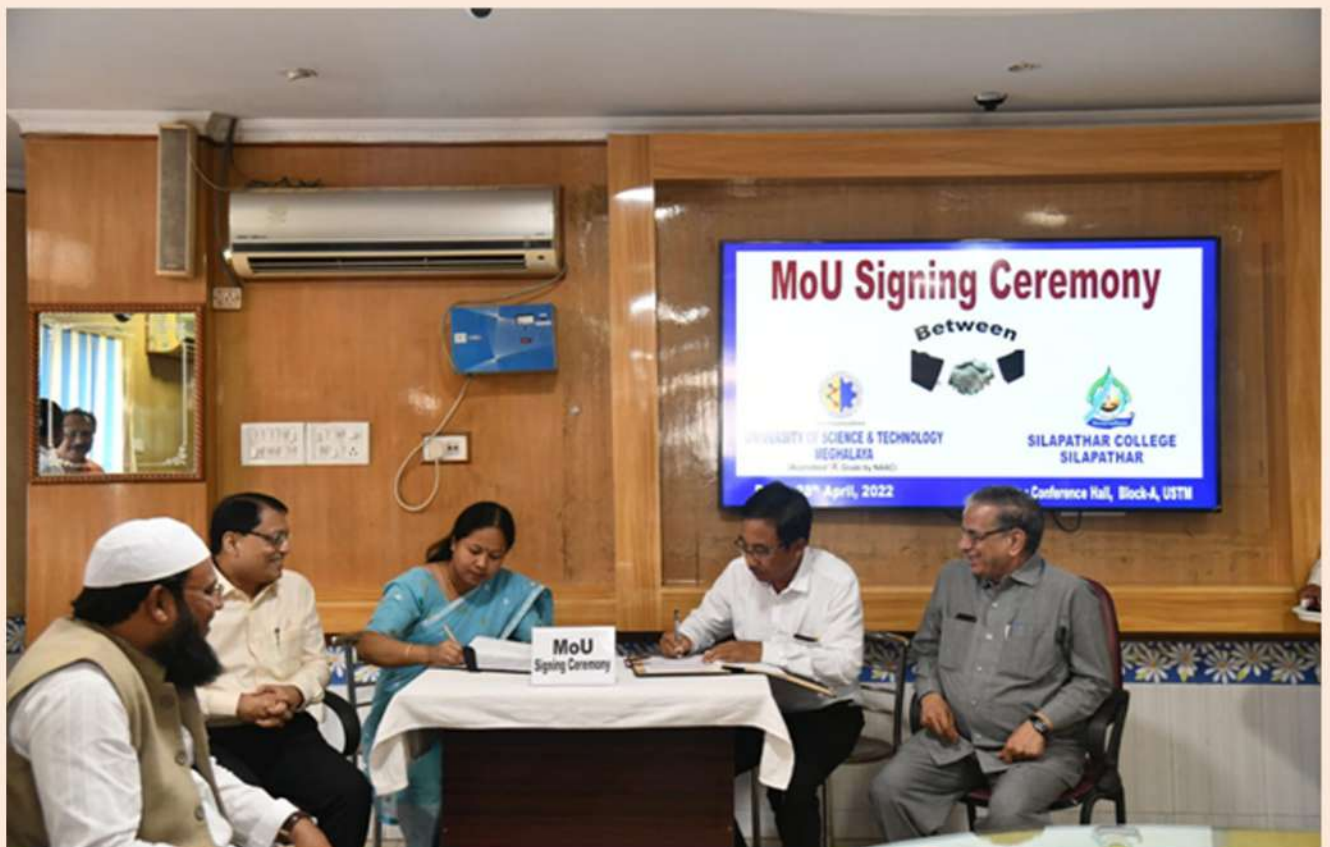
MoU Signing Ceremony between USTM and Silapathar College, Dhemaji dated 28/04/2022