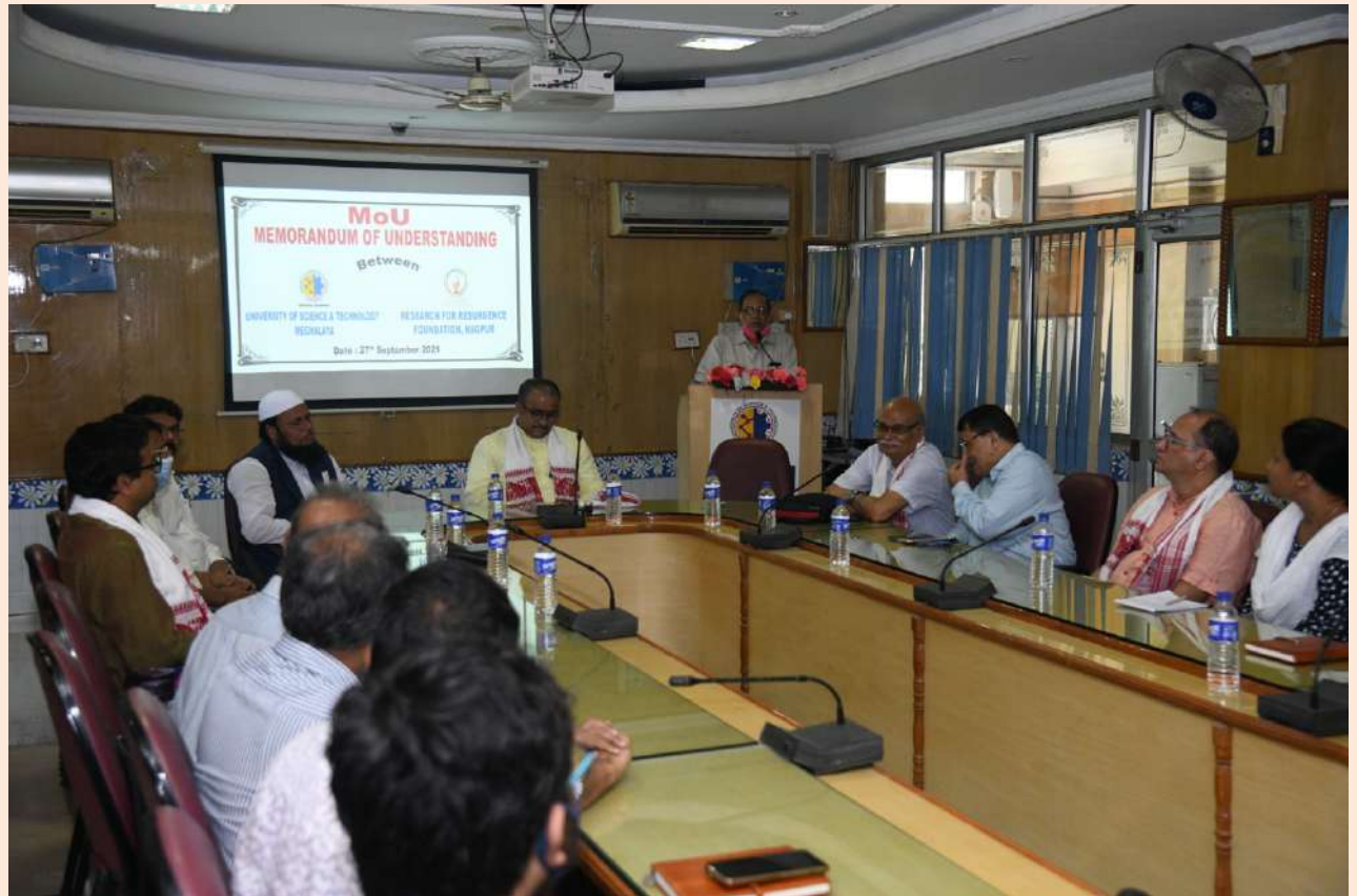
MoU Signing Ceremony between USTM and Research for Resurgence Foundation, Nagpur dated 27/9/2021