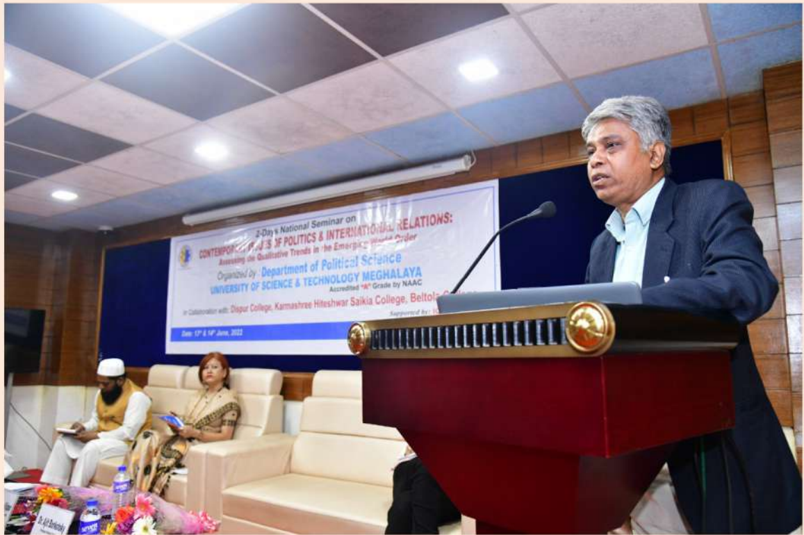
National Seminar on “Contemporary Issues of Politics & International Relations: Assessing the Qualitative Trends in the Emerging World Order” Organized by Department of Political Science, University of Science & Technology Meghalaya, in collaboration with Dispur College Guwahati, Karmashree Hiteshwar Saikia College Guwahati & Beltola College Guwahati on 13th & 14th June, 2022.