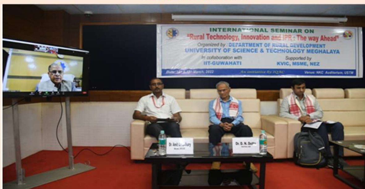
Speakers in the inaugural session of the International Seminar on Rural Technology, Innovation & IPR at USTM on March 14, 2022