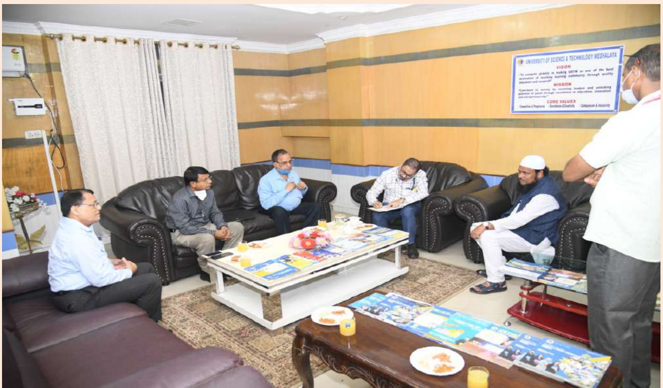
MoU Signing Ceremony between USTM and North East Center for Technology Application and Reach (NECTAR), Shillong dated 29/9/2021