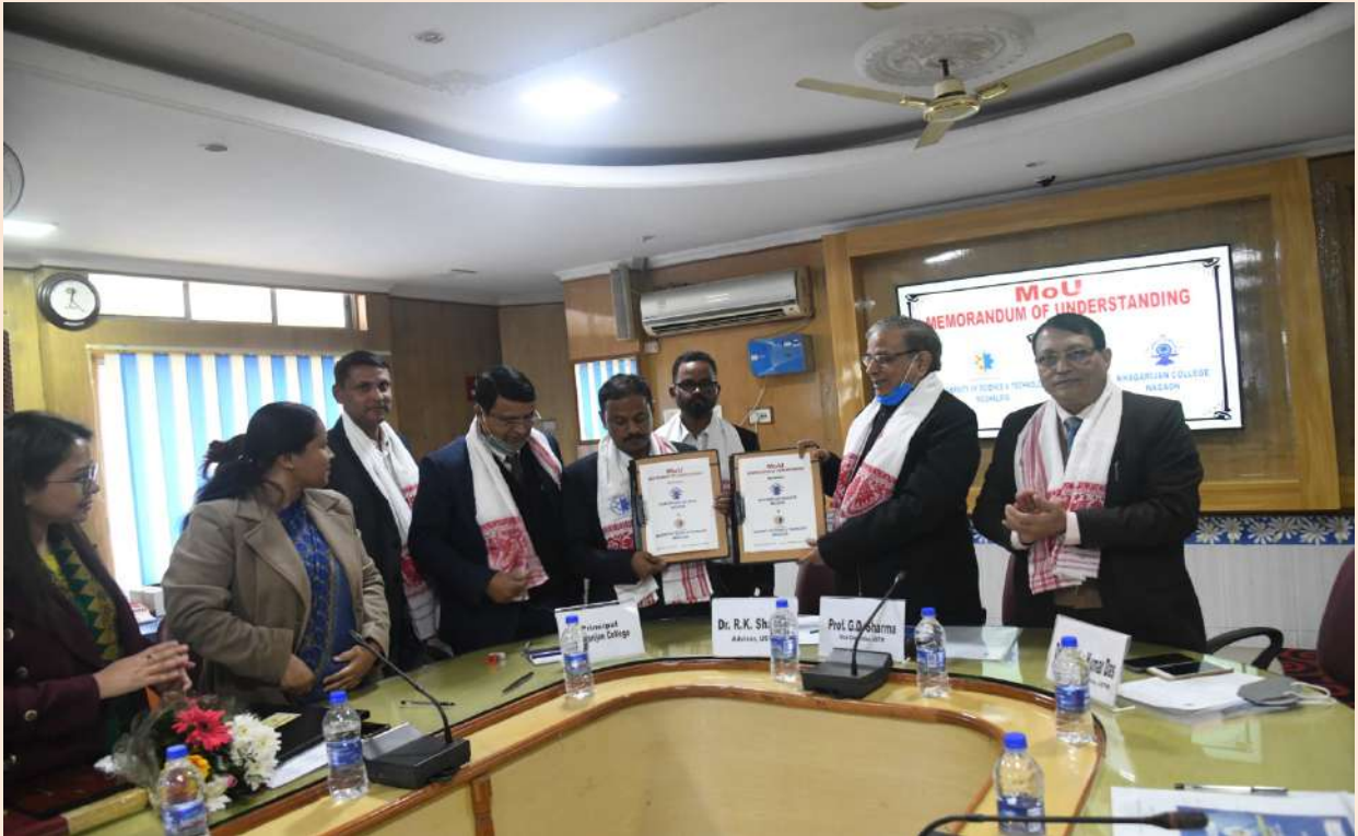
MoU Signing Ceremony between USTM and Khagarijan College dated 08/02/2022