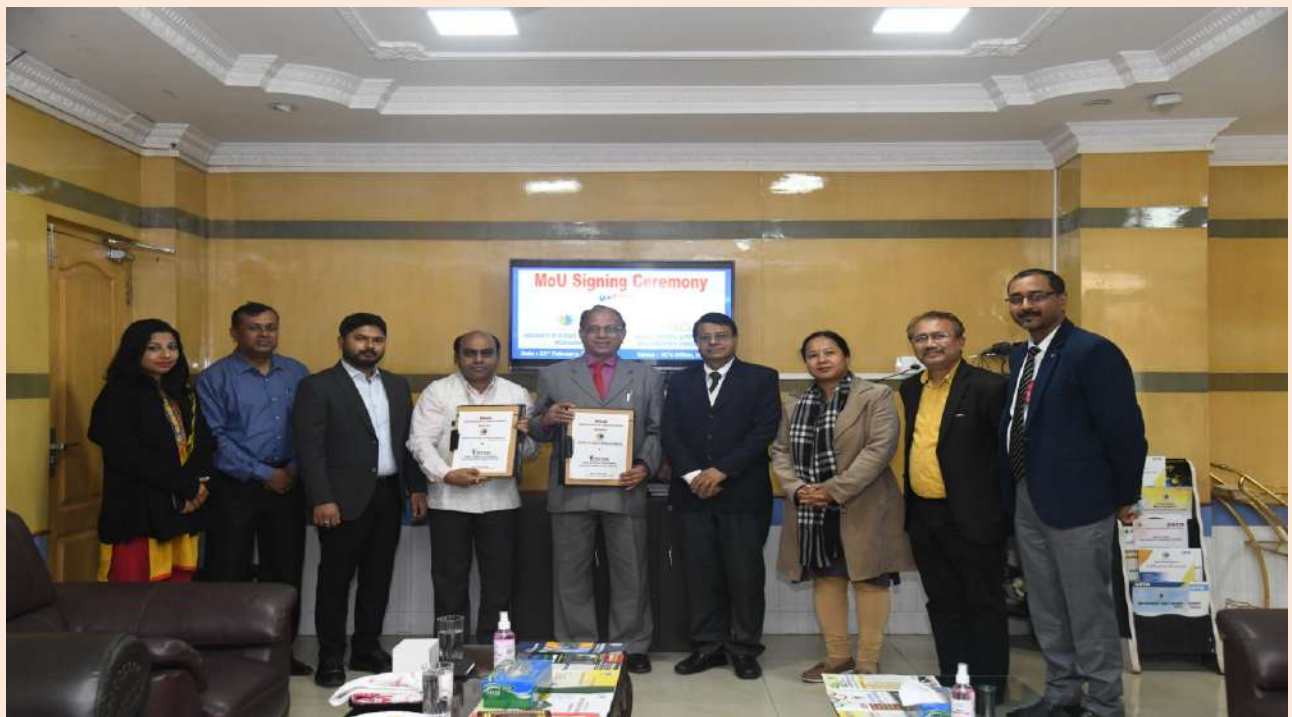
MoU Signing Ceremony between USTM and Rubber Chemical & Petrochemical Skill Development Council (RCPSDC), New Delhi dated 23/02/2022