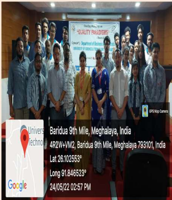
A group Photograph after the Session