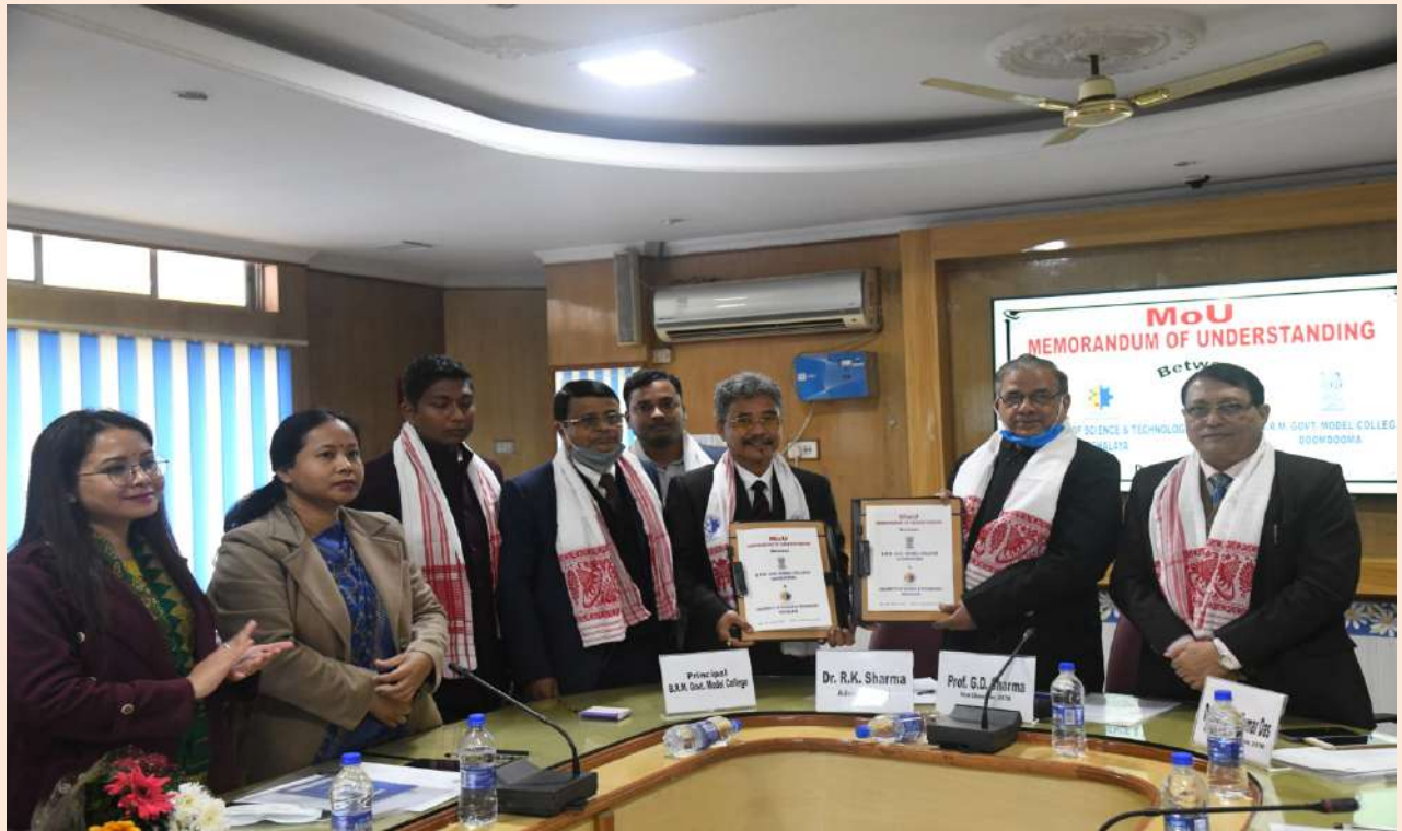
MoU Signing Ceremony between USTM and Bir Raghab Moran Government Model College, Doomdooma dated 08/02/2022