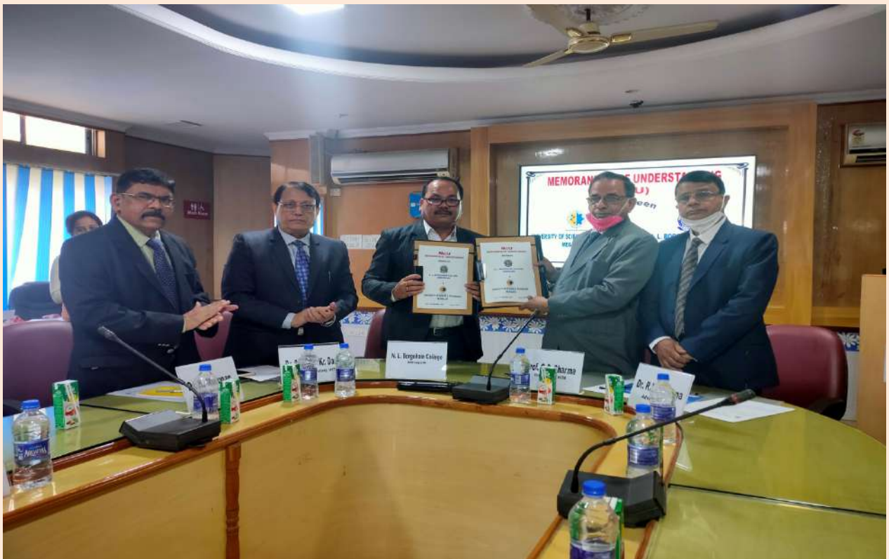
MoU Signing Ceremony between USTM and Nandalal Borgohain City College, Dibrugarh dated 24/11/2021