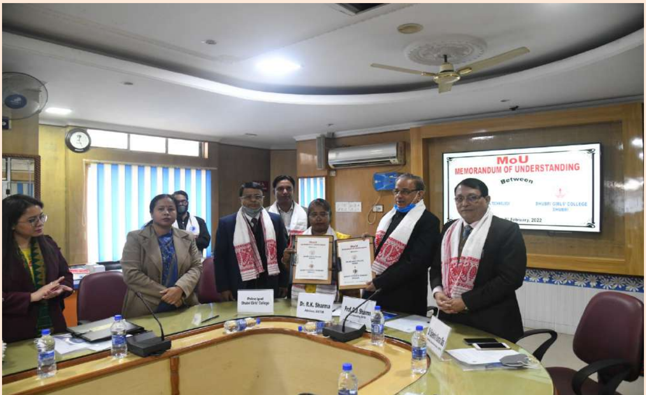
MoU Signing Ceremony between USTM and Dhubri Girls College dated 08/02/2022