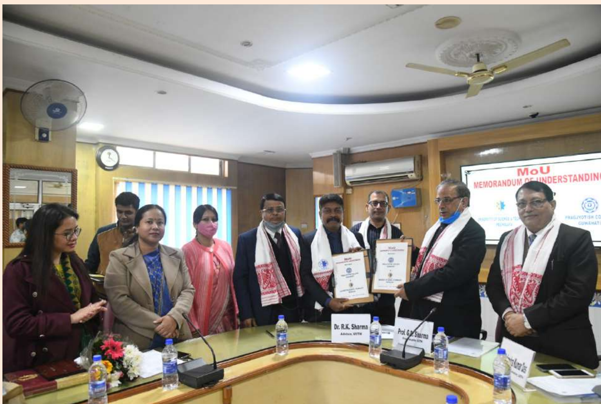
MoU Signing Ceremony between USTM and Pragiyotish College, Guwahati dated 08/02/2022