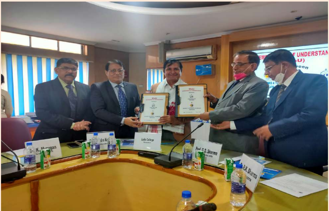
MoU Signing Ceremony between USTM and Ledo College, Tinsukia dated 24/11/2021