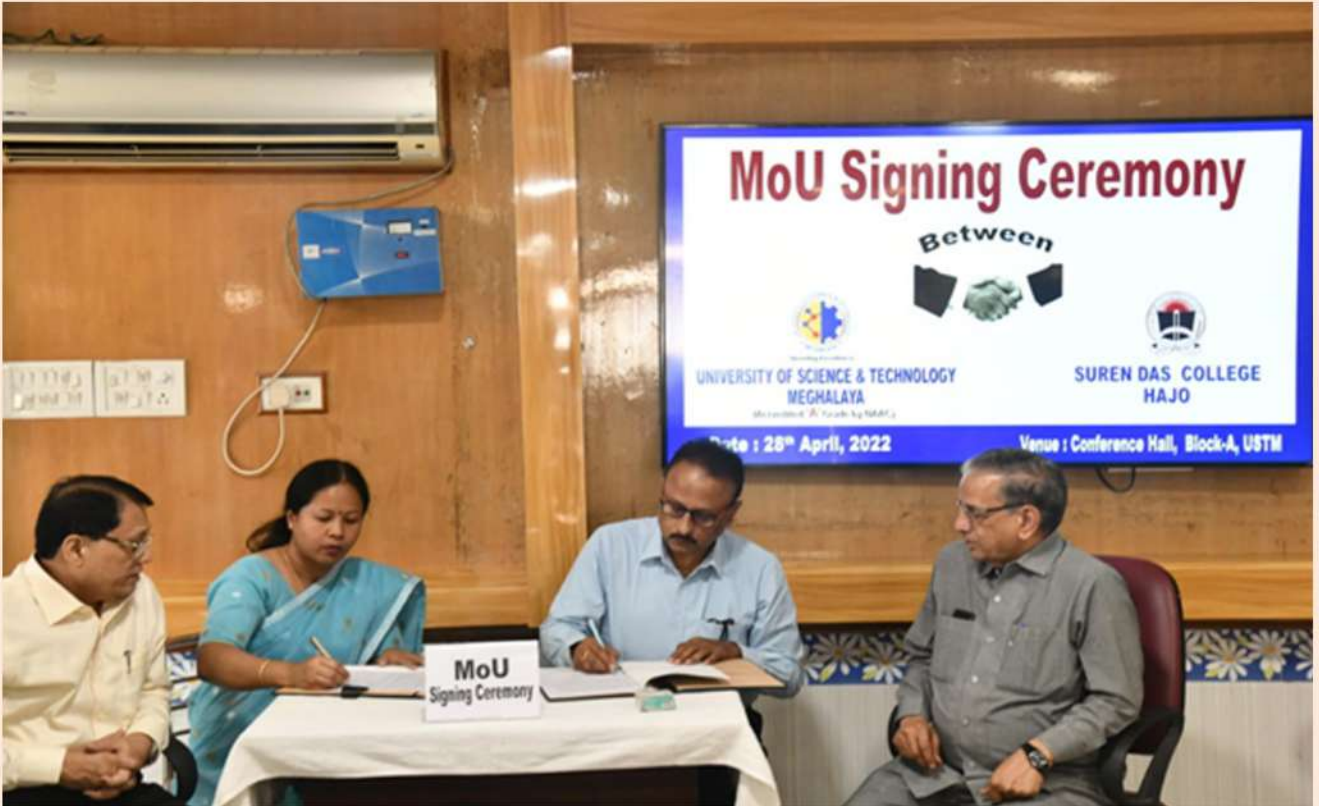
MoU Signing Ceremony between USTM and Suren Das College, Hajo dated 28/04/2022