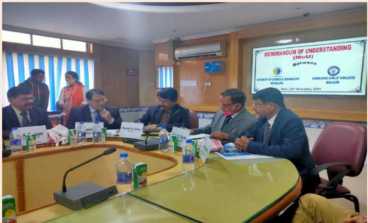
MoU Signing Ceremony between USTM and Nowgong Girls' College, Nagaon dated 24/11/2021