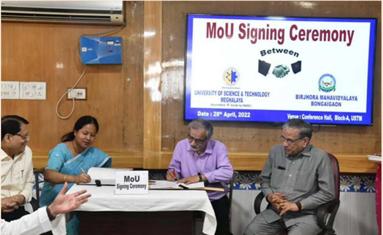
MoU Signing Ceremony between USTM and Birjhora Mahavidyalaya, Bongaigaon dated 28/04/2022