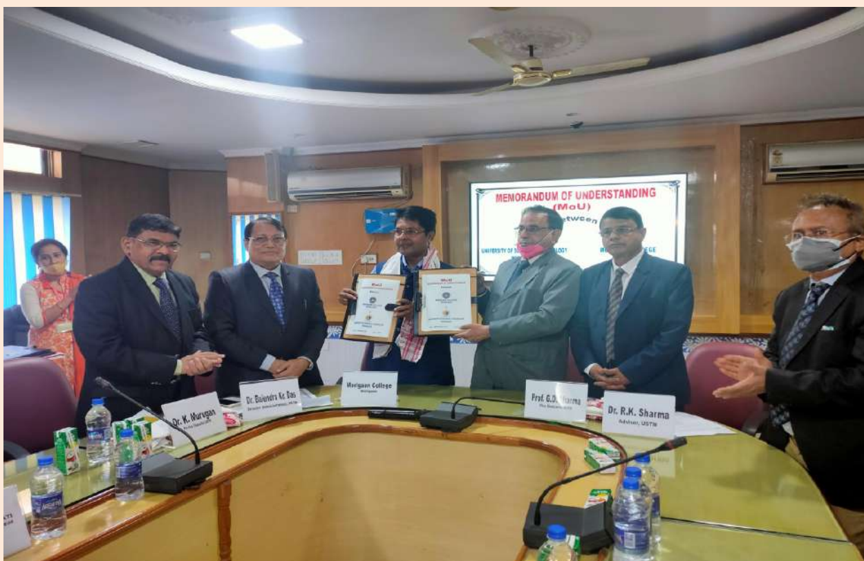
MoU Signing Ceremony between USTM and Morigaon College dated 24/11/2021