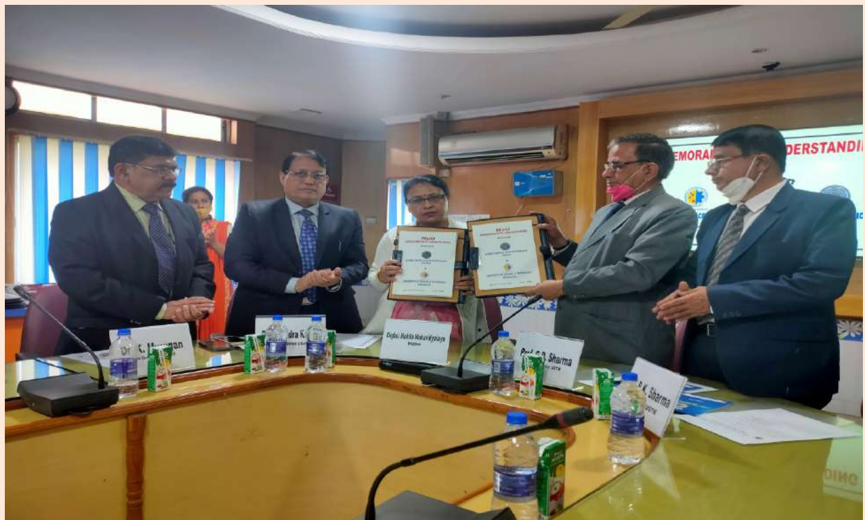
MoU Signing Ceremony between USTM and Digboi Mahila Mahavidyalaya, Digboi dated 24/11/2021