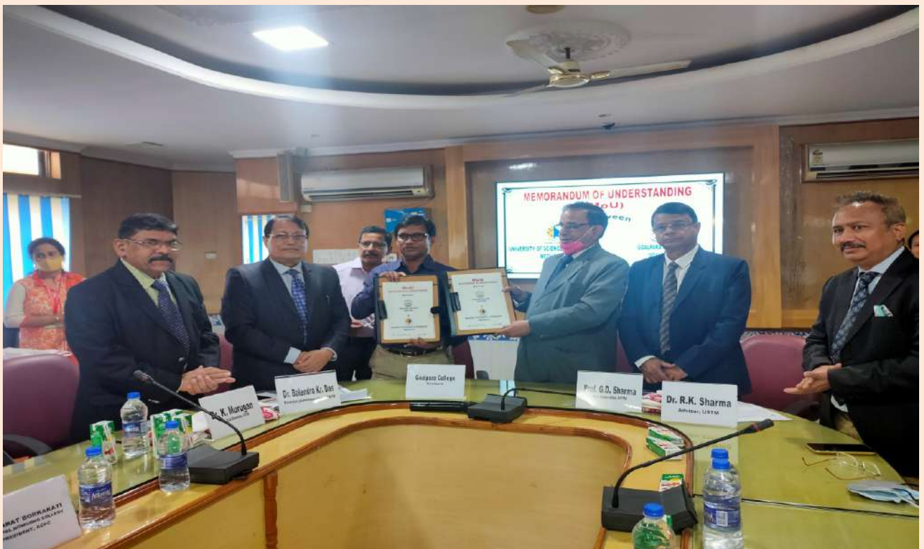
MoU Signing Ceremony between USTM and Goalpara College, Goalpara dated 24/11/2021