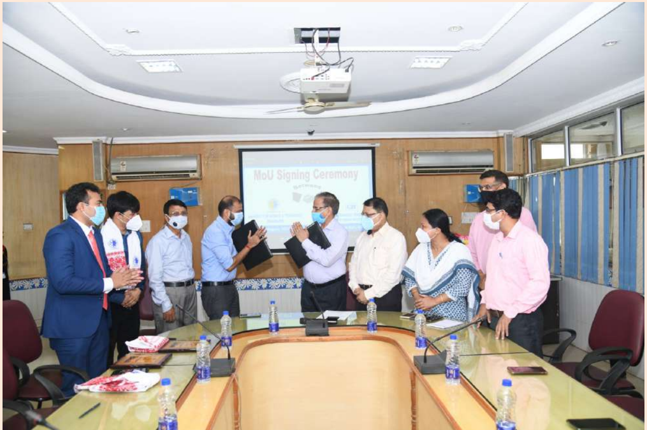
MoU Signing Ceremony between USTM and Confederation of Indian Industry (CII) dated 6/8/2021