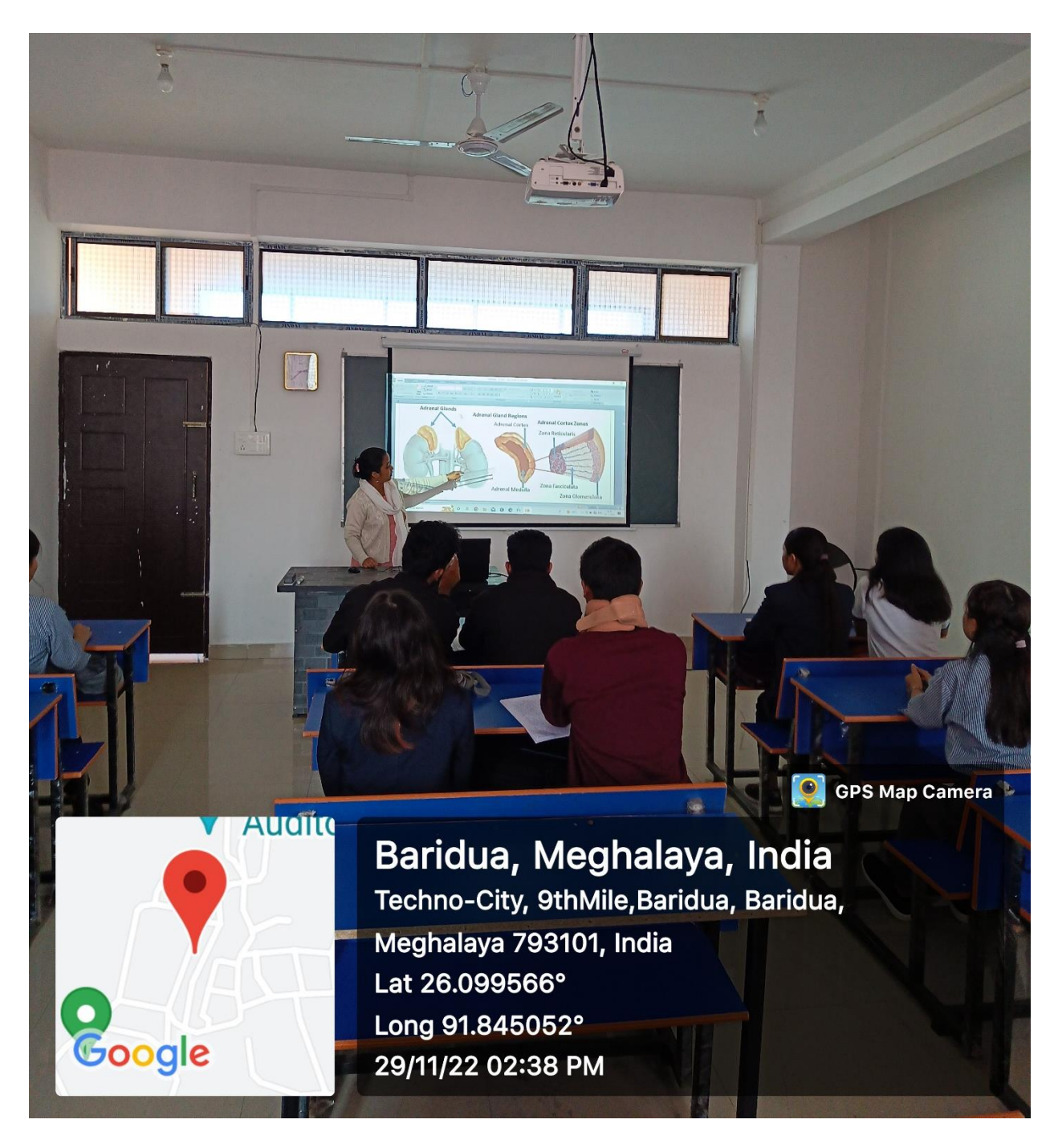
ICT enabled Class room