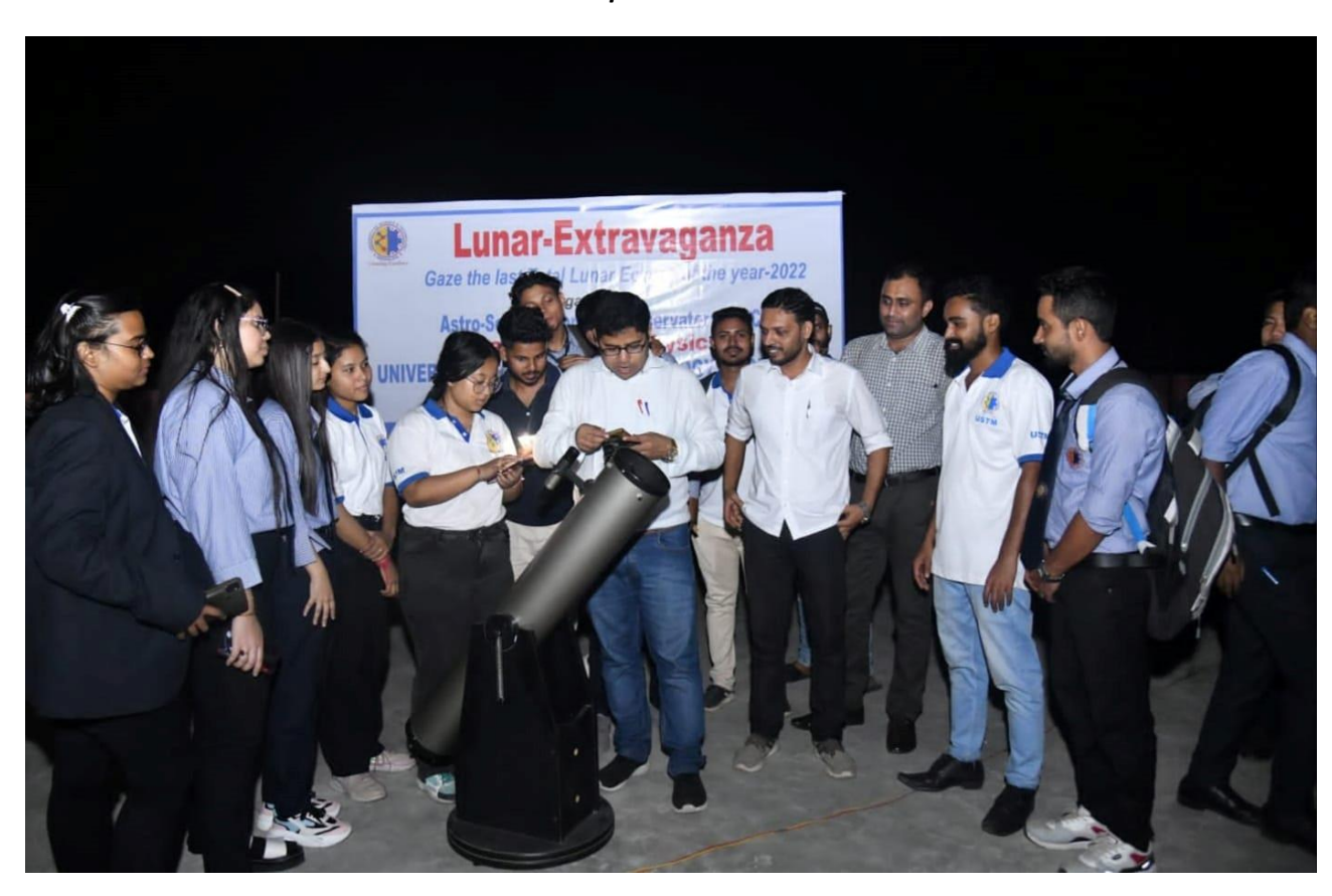
Skygazing @ USTM