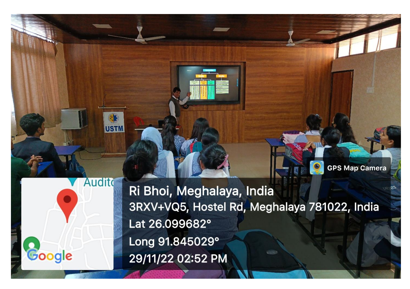
ICT enabled Class room