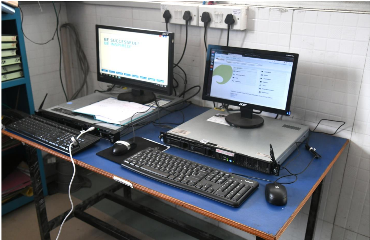
Servers-for Koha & Middleware software