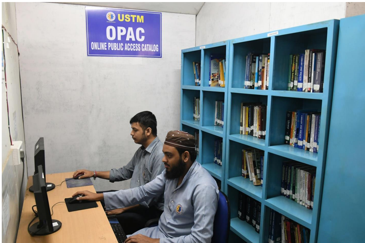
Online Public Access Catalog