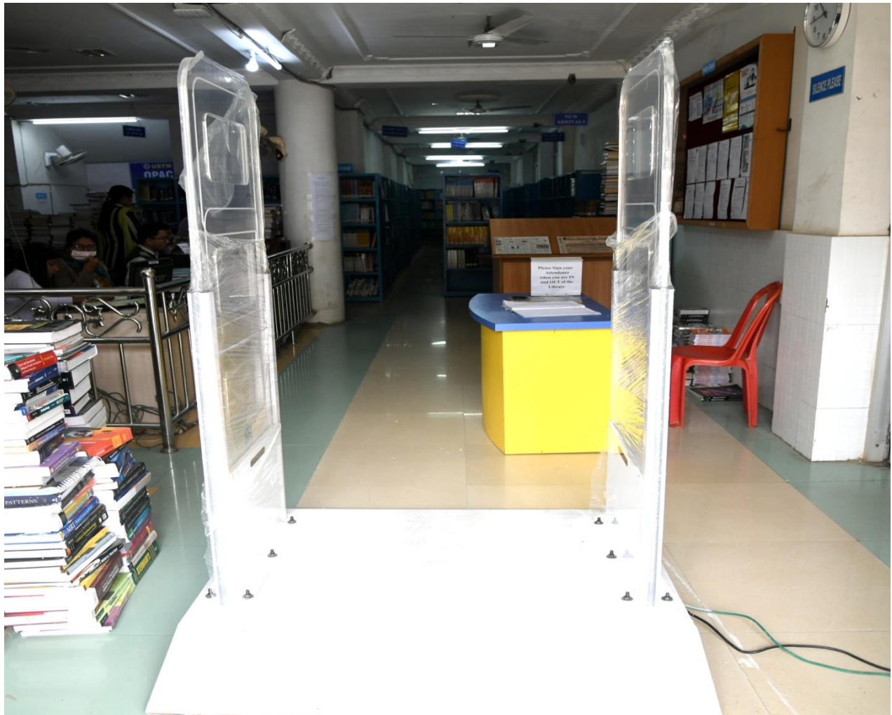
RFID -Gate Antenna system