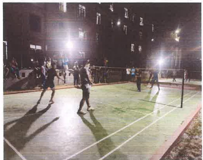
Glimpses of Badminton Competitions (Men, Doubles) To Celebrate New Year, 2022