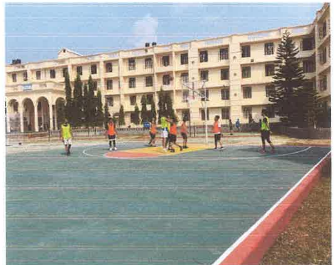
Glimpses of Inter Hostel Basketball Competition