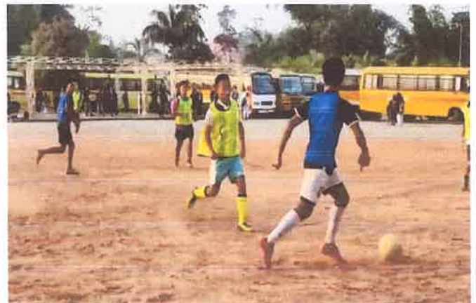
Glimpses of Inter Hostel Futsal Competition