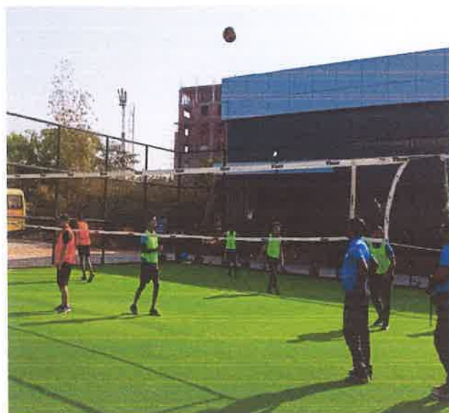
Glimpses of Inter Dept. Volleyball Competition to Celebrate National Unity Day