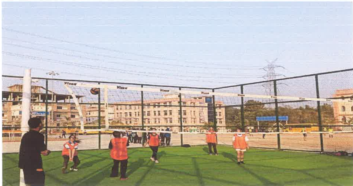
Glimpses of the ongoing Volleyball Trial Camp