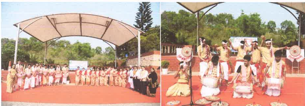
Glimpses of the Cultural Program on Pre Rongali Bihu Celebration 2022

Registrar University of Science & Technology, Meghalaya