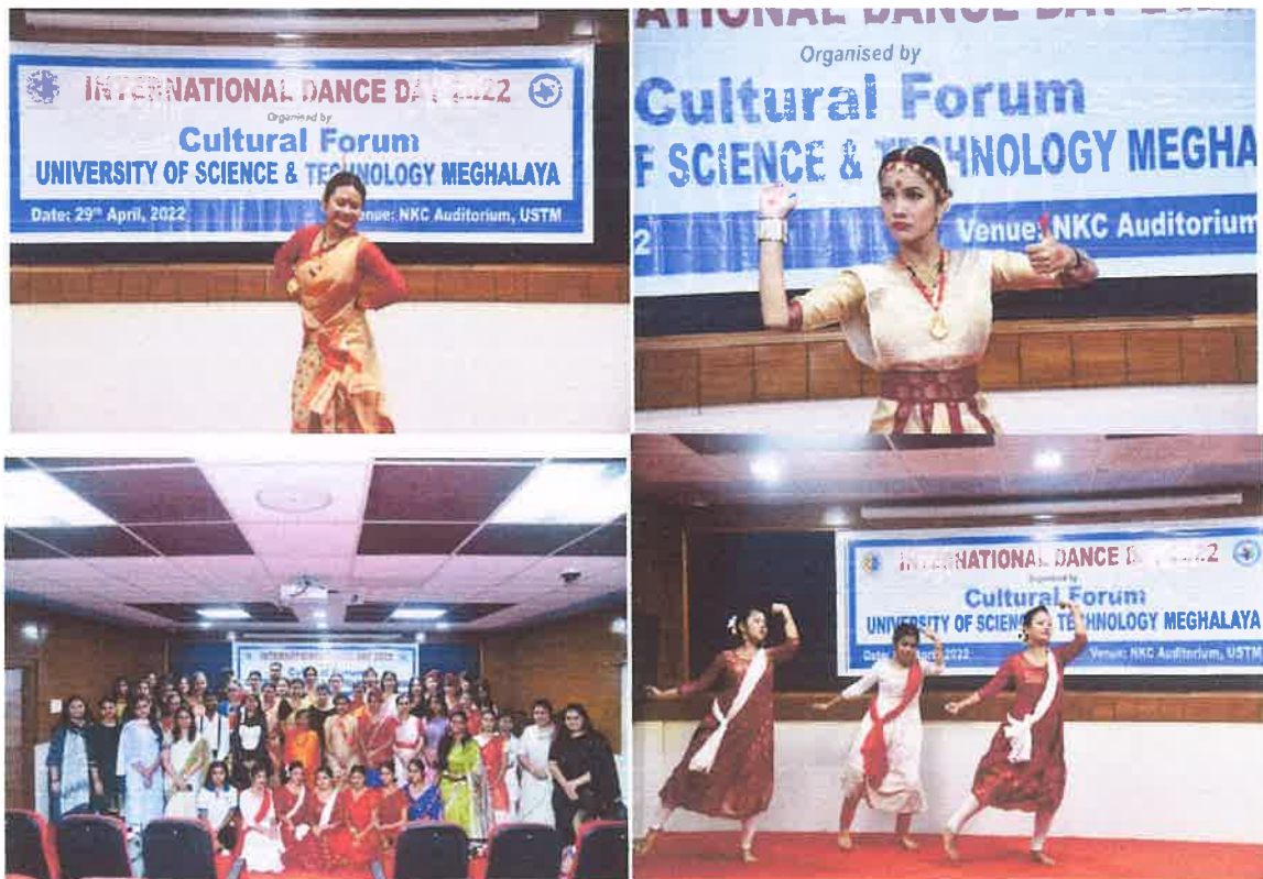
Glimpses of the Solo and Group dance Competition on International Dance Day'22

29 th April is celebrated as International Dance Day every year to celebrate different forms of dance and also to encourage different cultures. Cultural Forum, USTM has organized a solo and group dance competition to celebrate this day with all the enthusiastic students of students where 67 students covering almost all the departments have come up for participation in the competition. The Competition included all types of dance forms classical, modern, folk, fusion, Bollywood, etc.