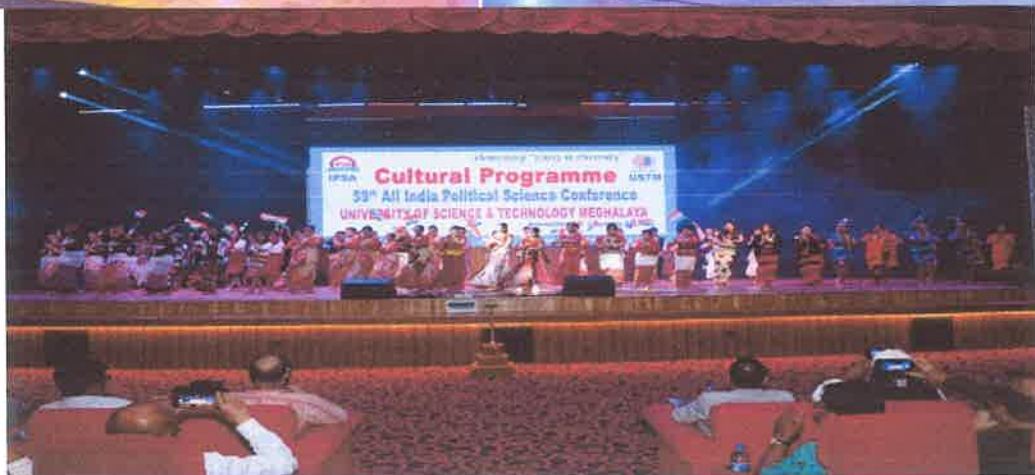
Glimpses of the Cultural Program on 59 th All India Political Science Conference

Registrar University of Science & Technology, Meghalaya