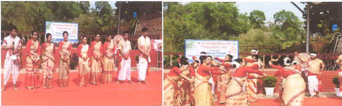
Participants of Solo Bihu Dance Competition

A Cultural Program was organized by the Cultural Forum, USTM on the occasion of Pre Rongali Bihu Celebration which was held on 12 th April, 2022. The program started with a Solo Bihu Dance Competition where students have participated from various departments followed by a Bihu Husori, Traditional Bodo Dance, Assamese Poetry, Solo song and Duet song in the Cultural Program. On that day, a Rongali Mela was also organized by Department of Business Administration and Food Science and Technology supported by the Cultural Forum, USTM.