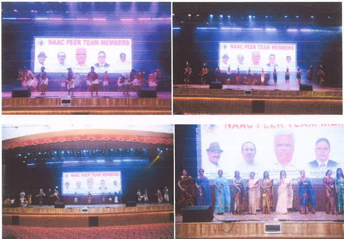
Glimpses of the Event on the NAAC Peer Team visit Cultural program.

On the first day of NAAC Peer team visit a Cultural Programme was organized to showcase the cultural activity of the students of USTM where about 250 students from different departments have performed