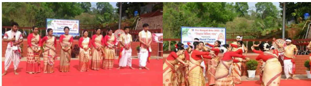
Participants of Solo Bihu Dance Competition

A Cultural Program was organized by the Cultural Forum, USTM on the occasion of Pre Rongali Bihu Celebration which was held on 12 th April, 2022. The program started with a Solo Bihu Dance Competition where students have participated from various departments followed by a Bihu Husori, Traditional Bodo Dance, Assamese Poetry, Solo song and Duet song in the Cultural Program. On that day, a Rongali Mela was also organized by Department of Business Administration and Food Science and Technology supported by the Cultural Forum, USTM.