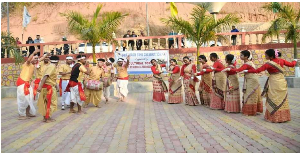
Pre Magh Bihu Celebration