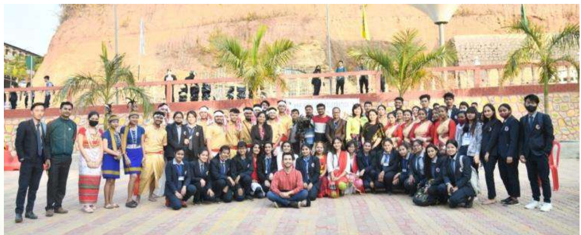
Glimpses of the Cultural Program Jointly organized by DDK Ghy and Cultural Forum, USTM