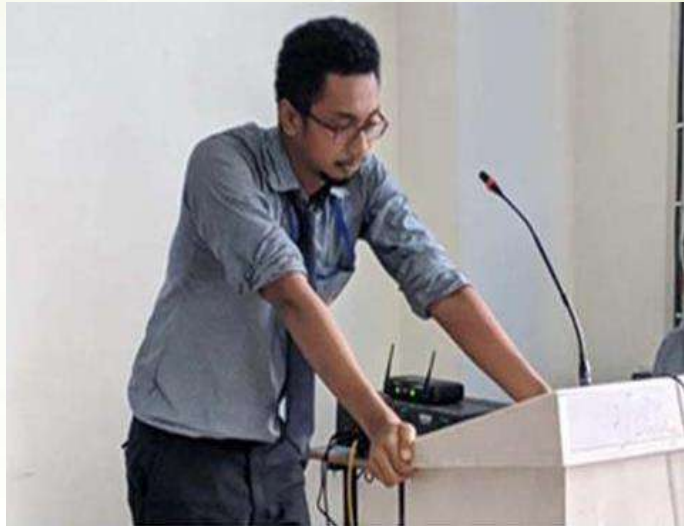
Glimpses of the Death Anniversary of Dr. Bhupen Hazarika 2021