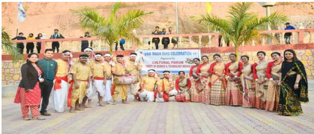
Glimpses of the Celebration Pre Magh Celebration 2022