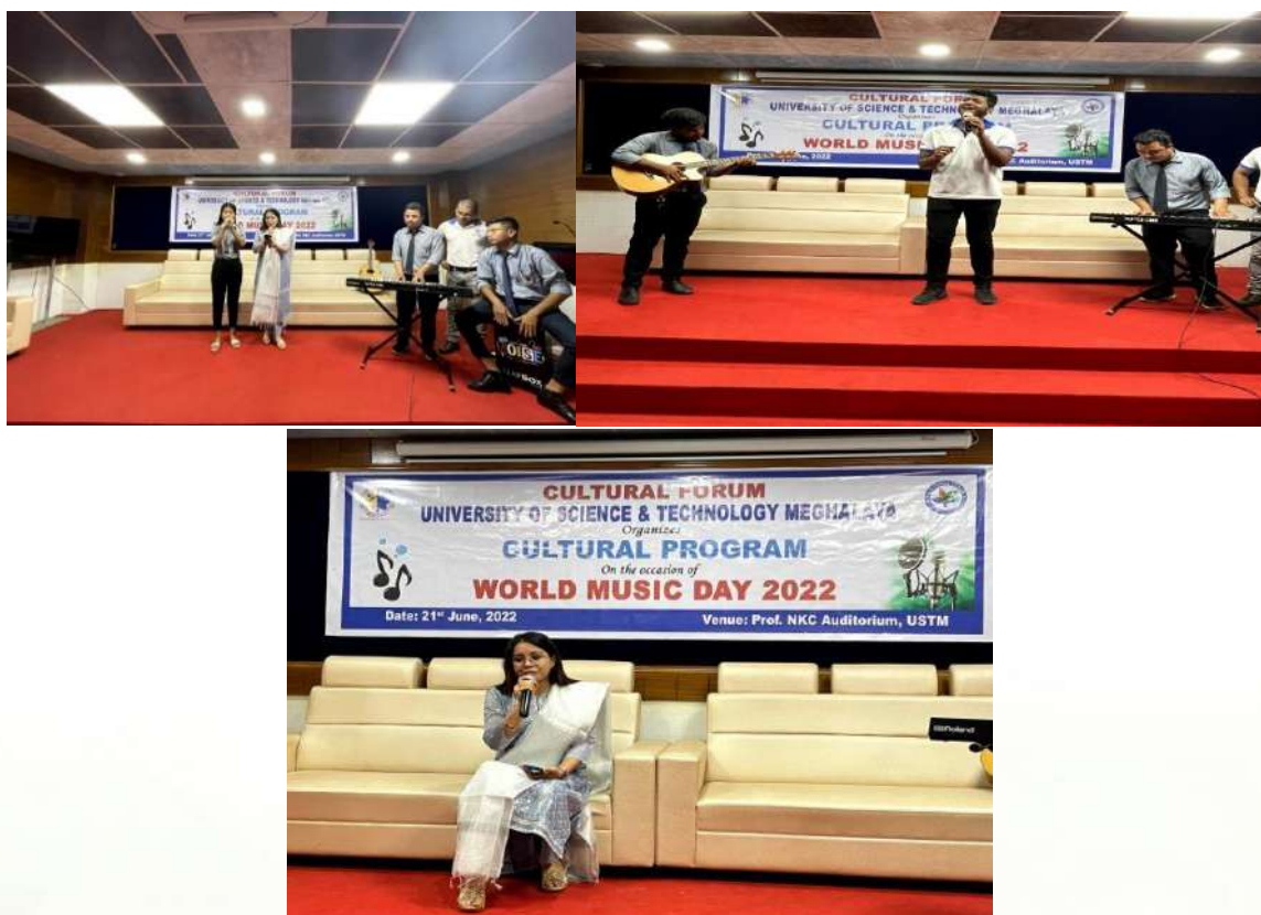
Glimpses of the Celebration of the World Music Day 2022 at USTM

A Cultural program has been organized to observe World Music day 2022. The program was held at the NKC Auditorium on 21 st June where students of Cultural Forum have participated actively and performed various songs including classical, folk, ghazal, bollywood, etc. They have also offered a tribute to Krishnakumar Kunnath (KK) with performing some of his famous songs.