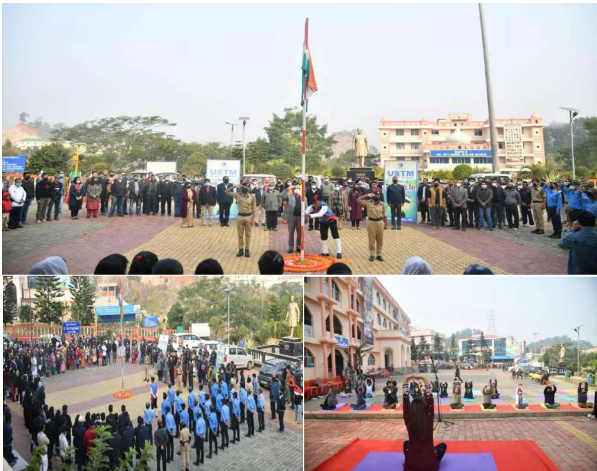
Glimpses of the Celebration of Republic Day