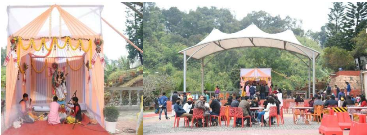
Glimpses of the Celebration Saraswati Puja 2022