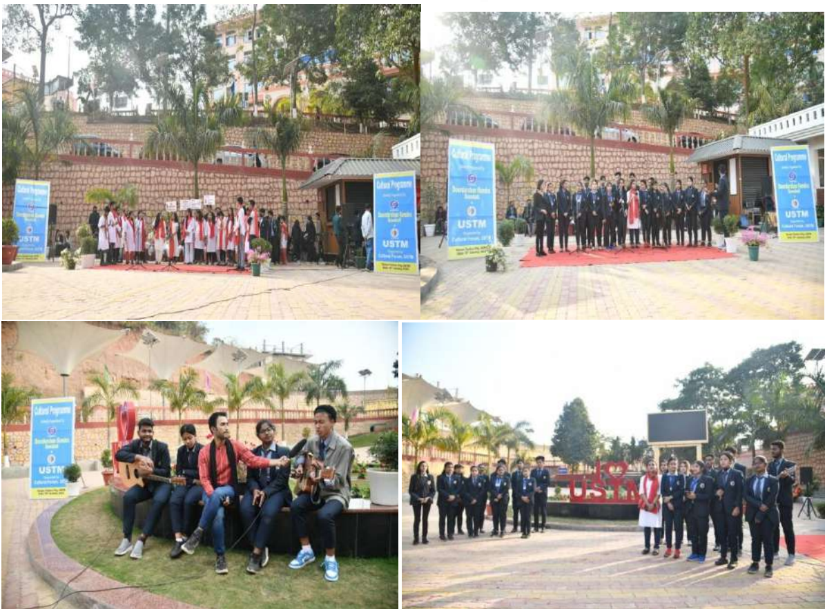
Glimpses of the Program Organized by DDK Ghy namely “Campus Campus”

A cultural program was organized jointly by Doordarshan Kendra Guwahati and Cultural Forum USTM which was held on 10 th January where more than 100 students of USTM have performed various items like dance, song, skit etc and delivered their talents and highlighted the program with their graceful performances.