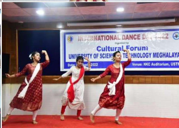
Glimpses of the Solo and Group dance Competition on International Dance Day'22