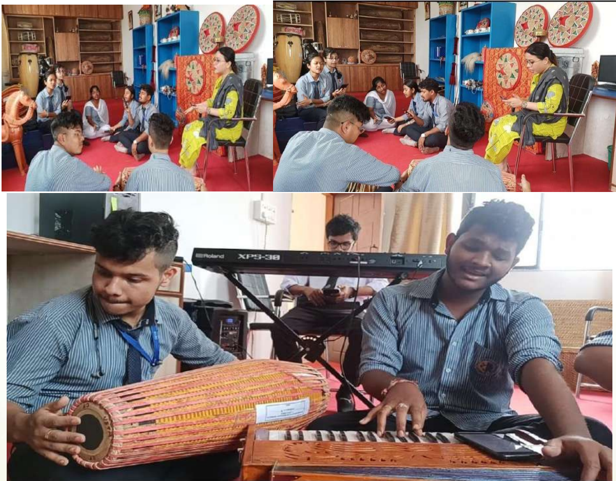
Glimpses of the Celebration of the Birth Anniversary of Jyoti Prasad Agarwalla at USTM

On the occasion of the Birth Anniversary of Jyoti Prasad Agarwalla, Cultural Forum USTM has organized a program in the remembrance of his evergreen songs and his writings. Students have performed songs and also had a discussion about his contribution to the state through his songs.