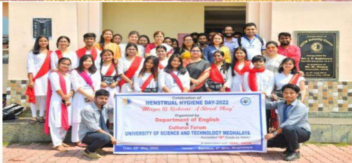
Glimpses of the Street Play on Menstrual Hygiene Day'22