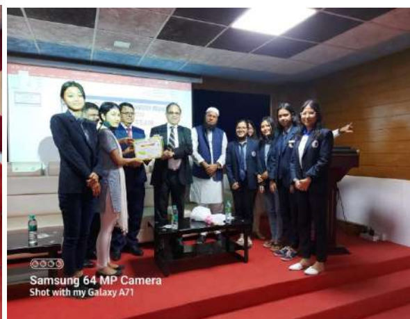
Glimpses of the Founder's Day Celebration