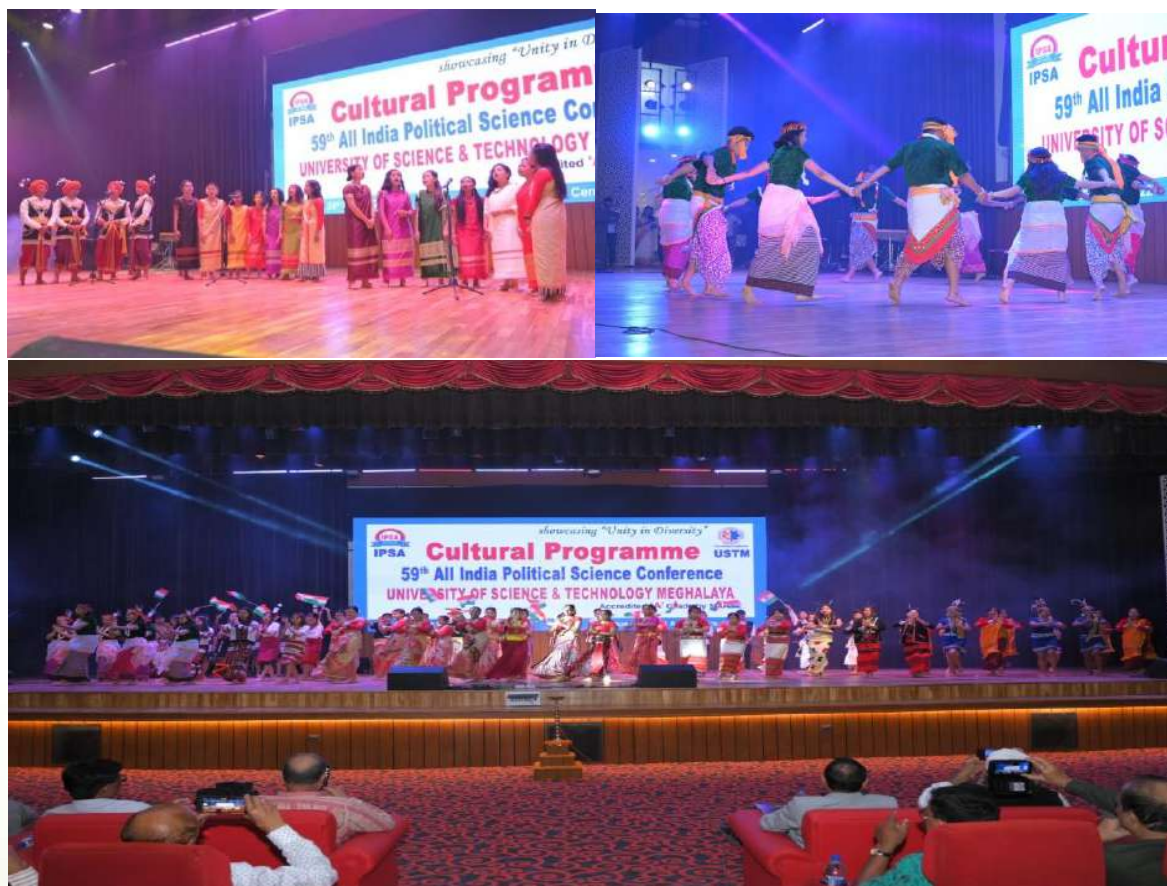
Glimpses of the Cultural Program on 59 th All India Political Science Conference

A Cultural Program was organized by the Cultural Forum, USTM for 59 th All India Political Science Conference by Indian Political Science Association at the University of Science and Technology Meghalaya where near about 200 students of USTM have showcased their talents through their performances- songs, dance, poetry etc.