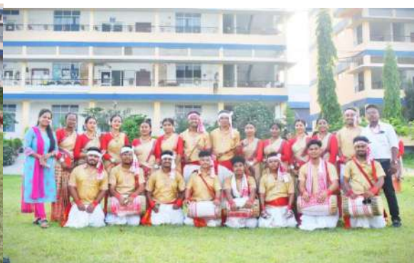
Glimpses of the Mukoli Bihu Competition at Nemcare Group of Institutions