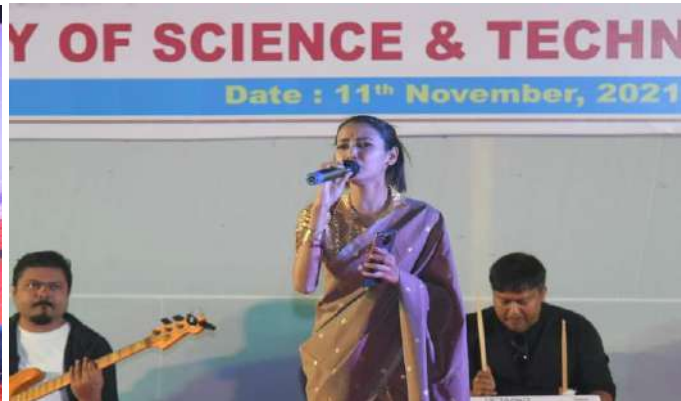
Gala Evening With Fun & Food