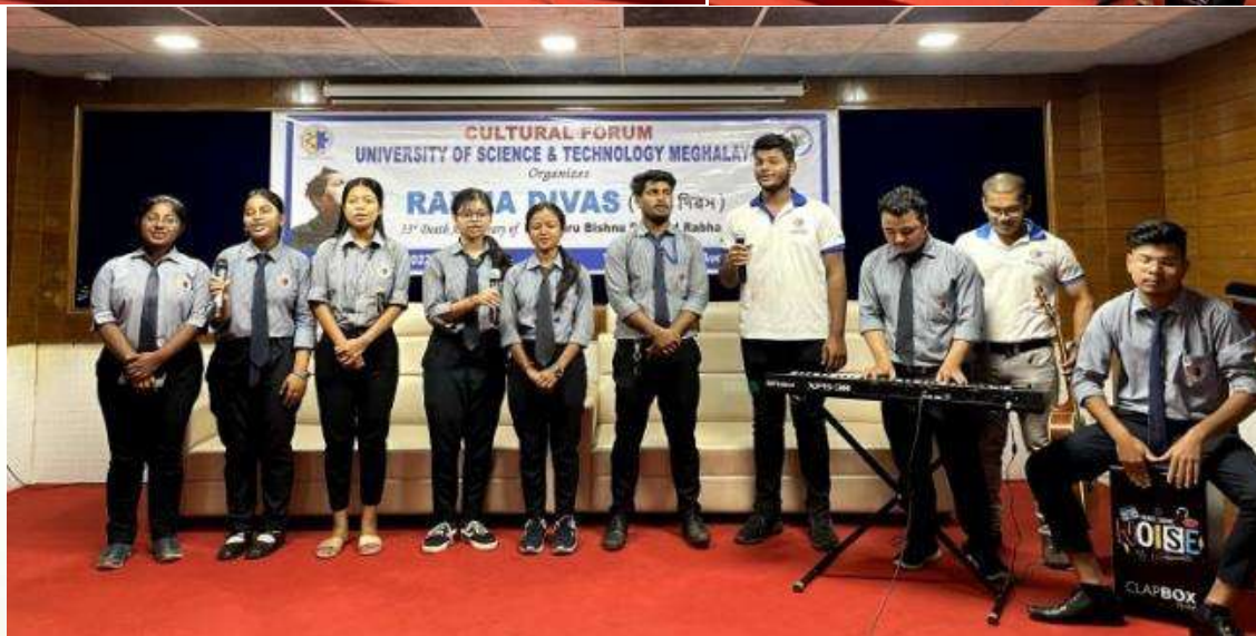
Glimpses of the Observation of the 53 rd Death Anniversary of Kalaguru Bishnu Prasad Rabha at USTM