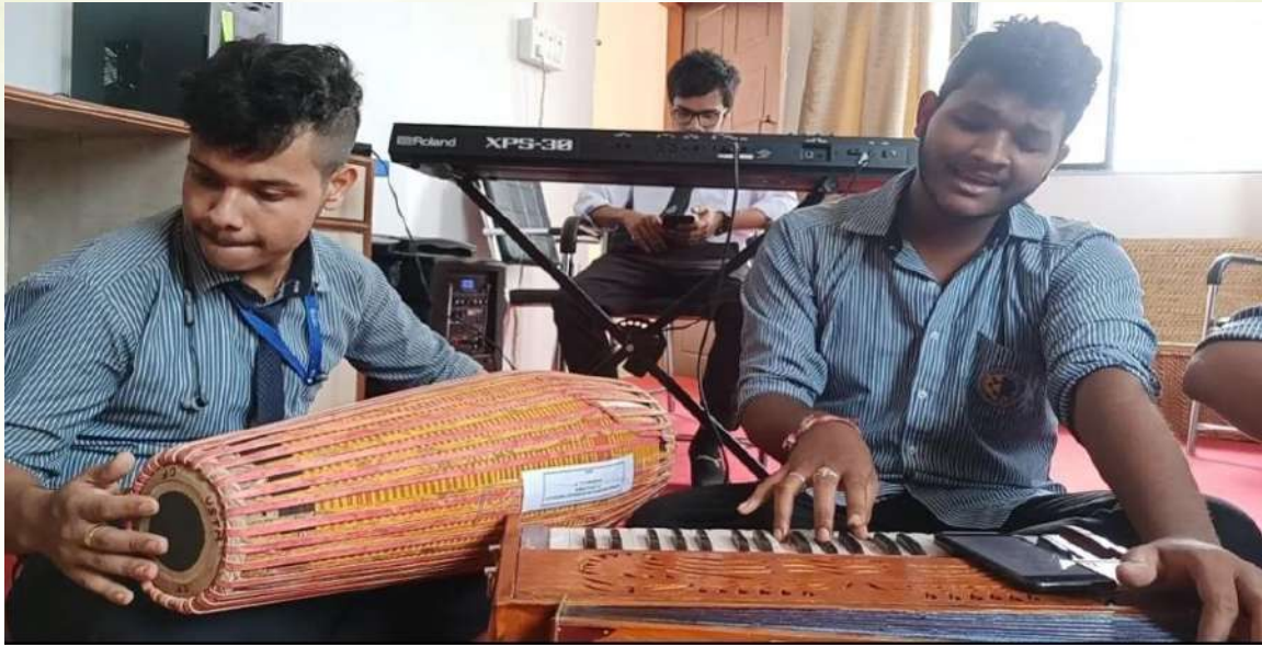
Glimpses of the Celebration of the Birth Anniversary of Jyoti Prasad Agarwalla at USTM