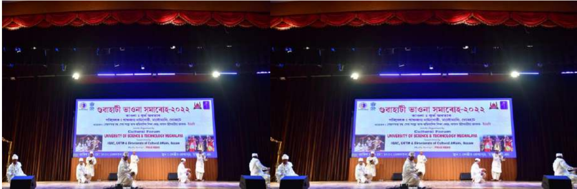
Glimpses of the Guwahati Bhaona Samaroh-2022 at USTM