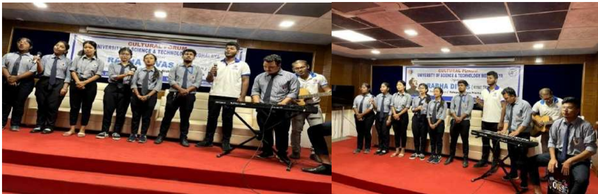
Glimpses of the Observation of the 53 rd Death Anniversary of Kalaguru Bishnu Prasad Rabha at USTM