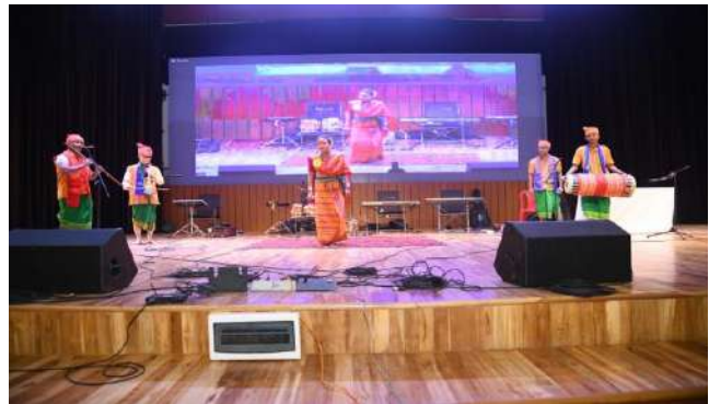
Glimpses of the Event on the grand finale of Global Cultural Fest-2021