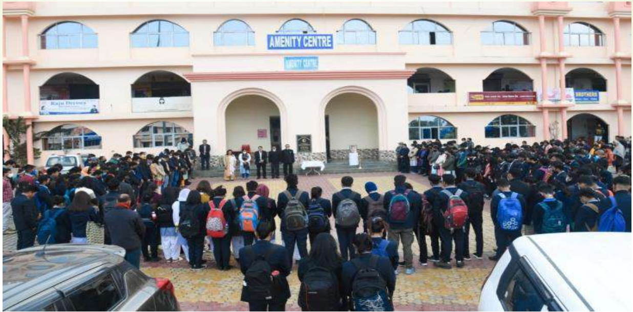
Glimpses of the Condolence to Bharat Ratna Awardee Lata Mangeshkar- The Melody Queen of India”