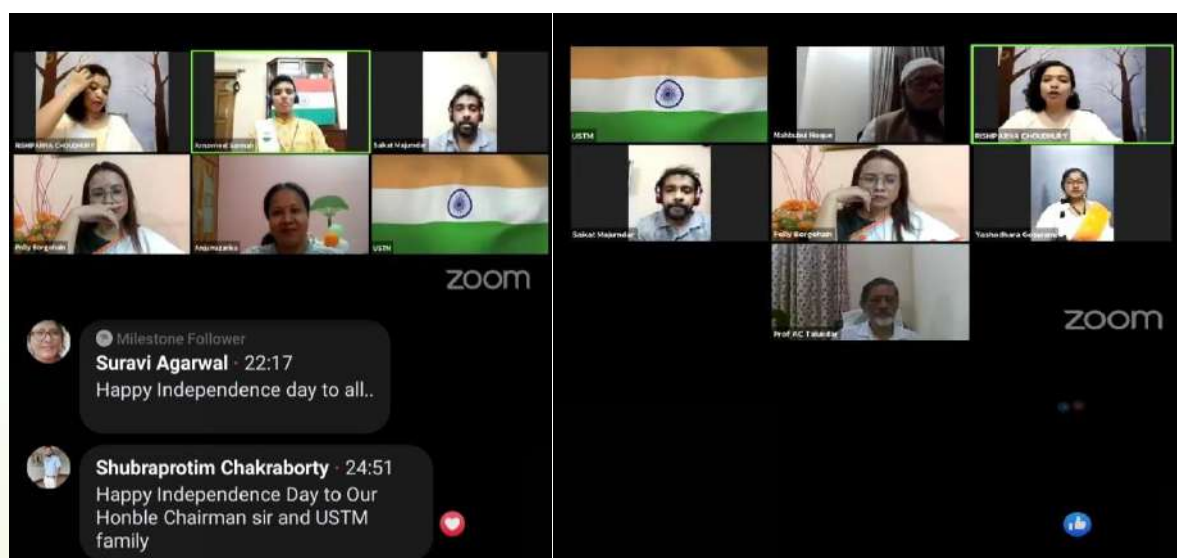
Glimpses of the virtual Event on the occasion of Independence Day