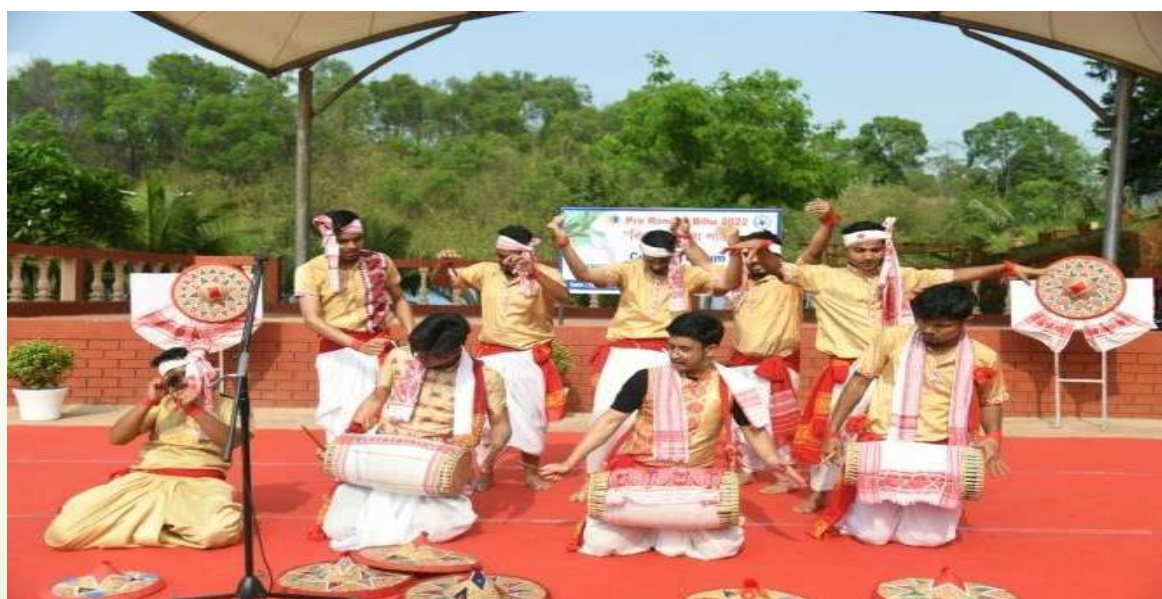
Glimpses of the Cultural Program on Pre Rongali Bihu Celebration 2022