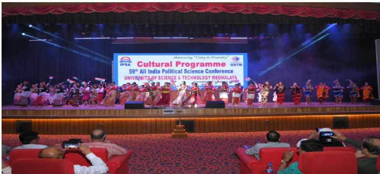
Glimpses of the Cultural Program on 59 th All India Political Science Conference