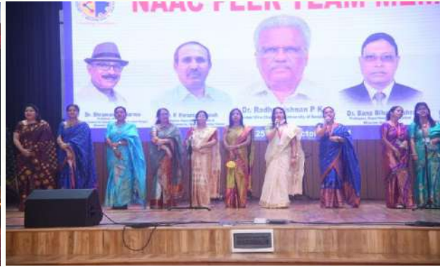
Glimpses of the Event on the NAAC Peer Team visit Cultural program