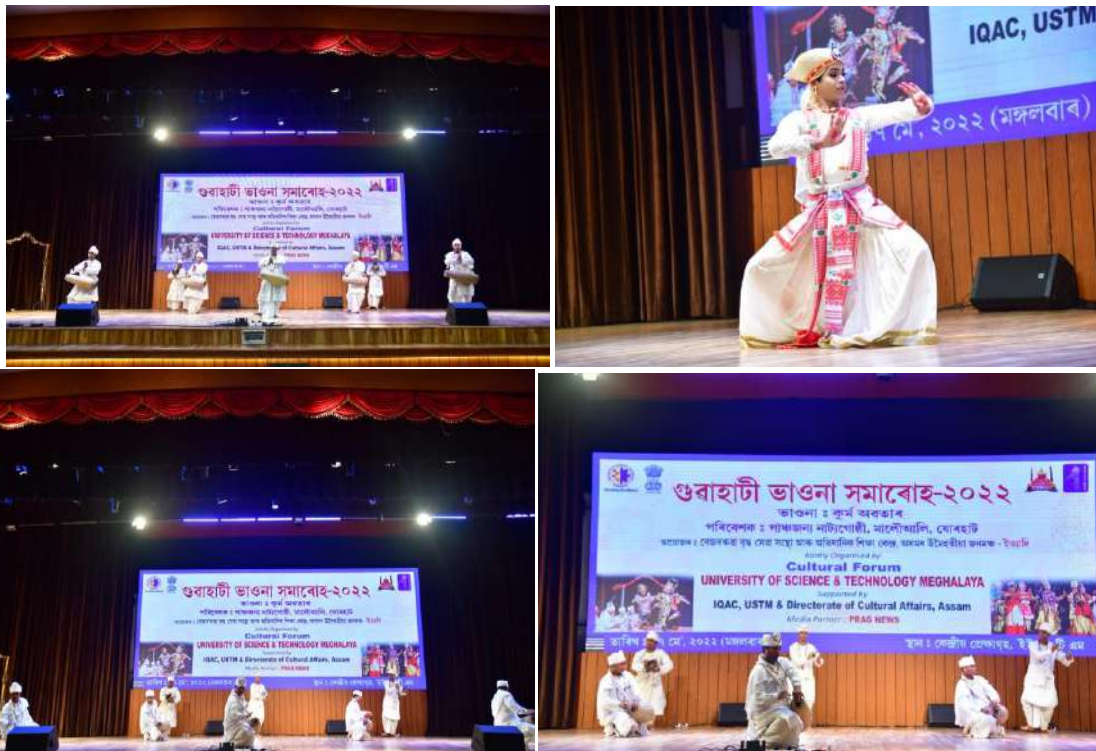
Glimpses of the Guwahati Bhaona Samaroh-2022 at USTM