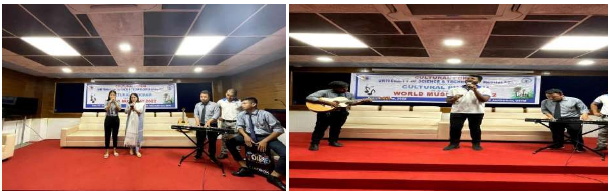
Glimpses of the Celebration of the World Music Day 2022 at USTM