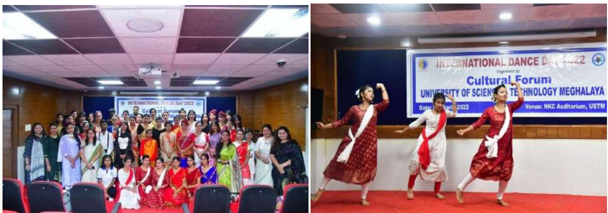
Glimpses of the Solo and Group dance Competition on International Dance Day'22