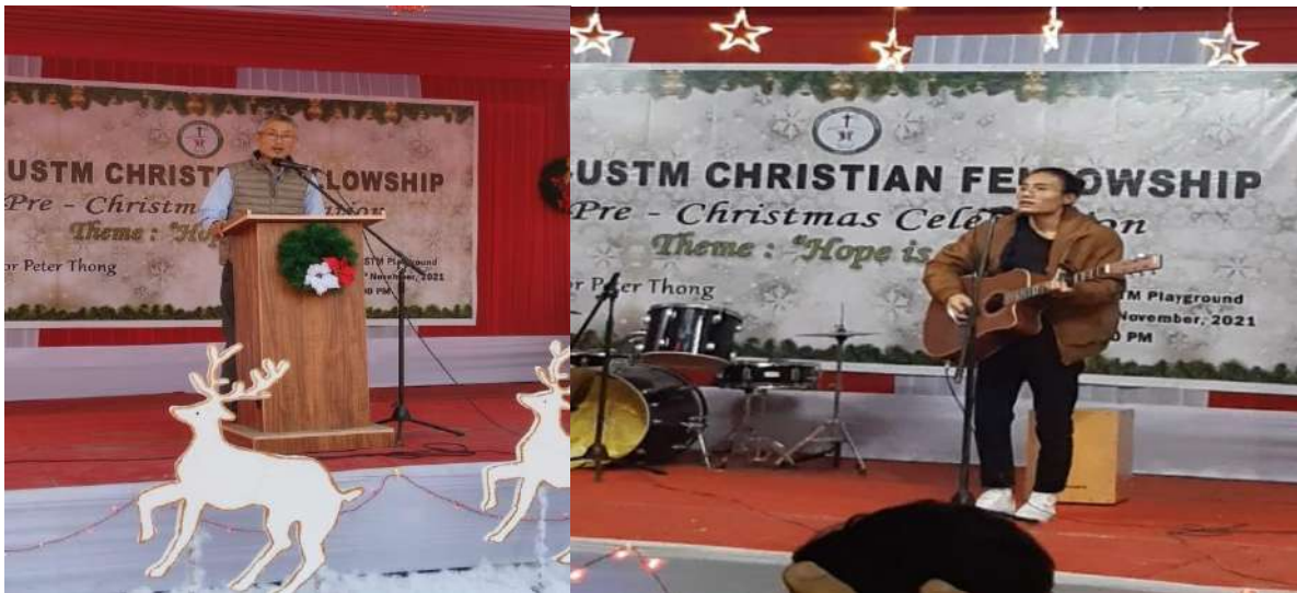
Glimpses of Christmas Day Celebration 2021