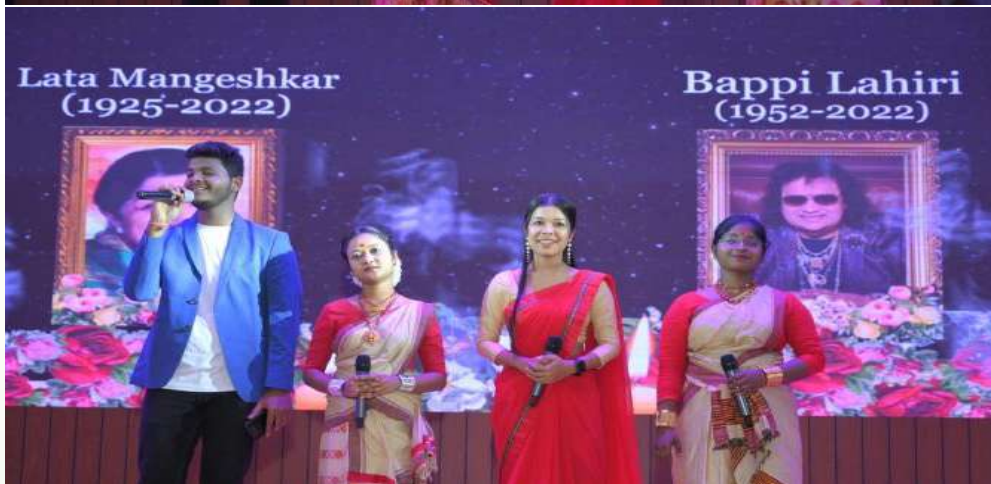
Glimpses of the Cultural Program as a Tribute to Bharat Ratna Awardee Lata Mangeshkar and Bappi Lahiri