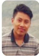
SHIANGCHIU Earth Science