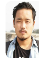
DAMPU DULOM Sociology