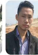
HYUNILO TEP Economics