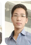
TATSUM KODAK Sociology