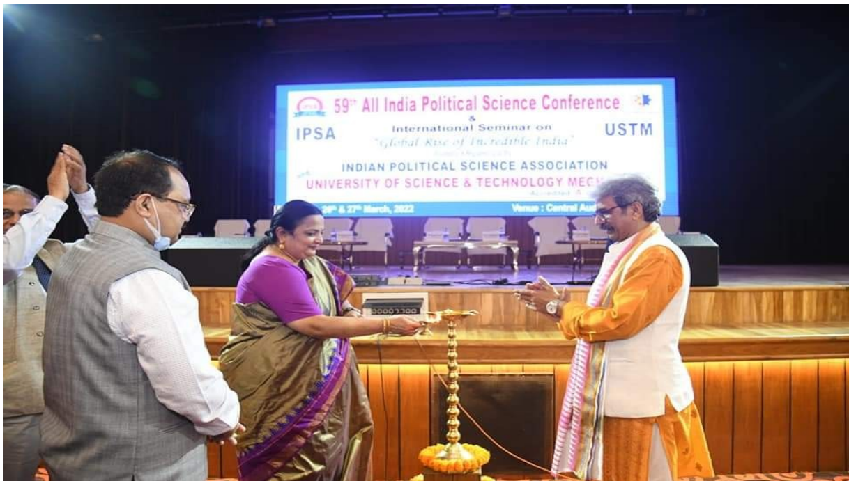
Pic2:Lighting the Lamp by Hon'ble Vice Chancellor, JNU and President, IPSA in IPSA Conference