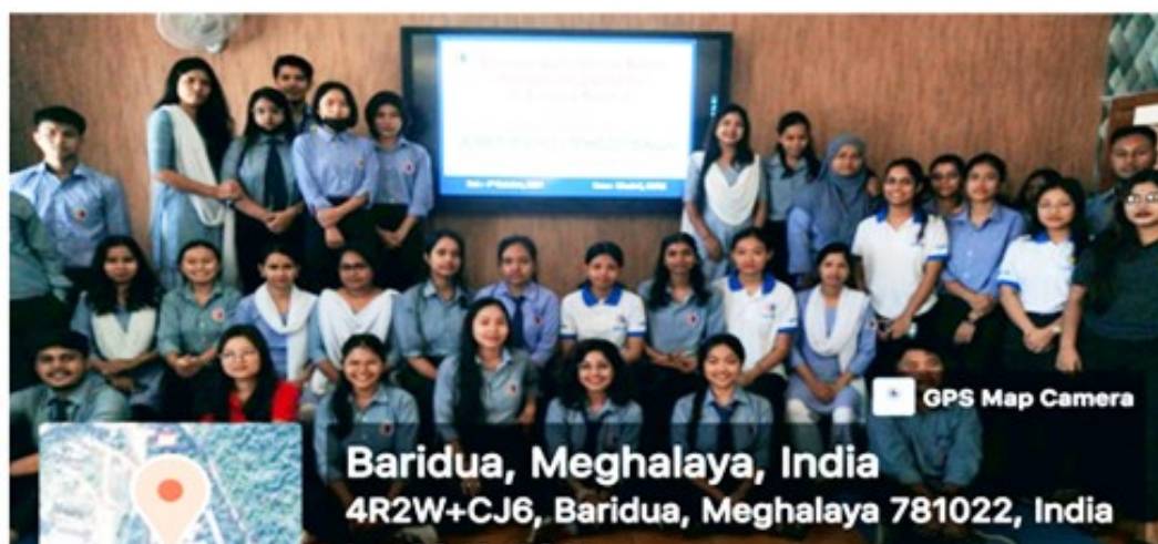
Group Photographs of Students during the Orientation Programme