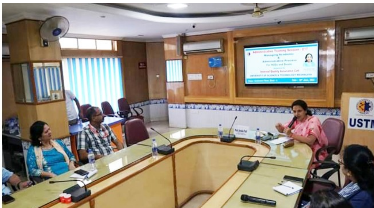
Ongoing the Training session

Administrative procedures are important because they provide an objective set of rules by which an organization is governed. They also help establish the legitimacy of management action by ensuring the application of management rules and decisions is done in an objective, fair, and consistent manner. Finally, they help ensure that managers are held accountable for decision that deviate from the procedures.