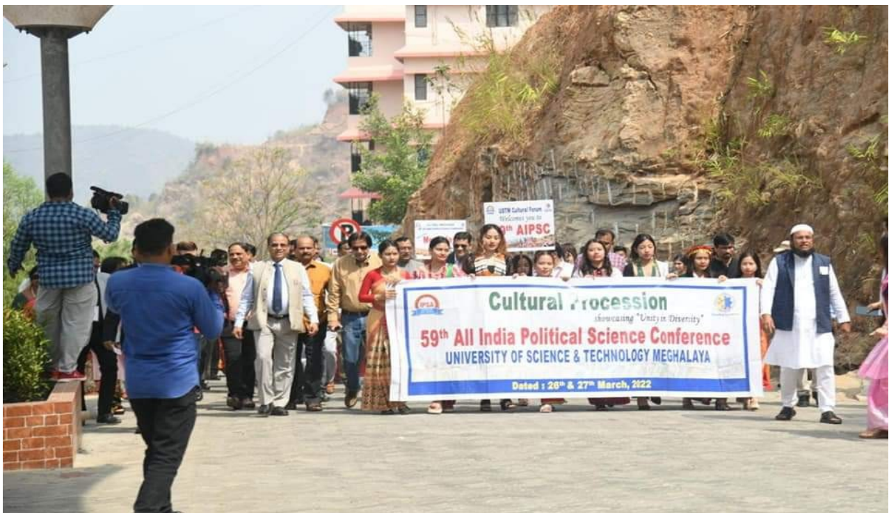
Pic 3: Cultural Rally in IPSA Conference