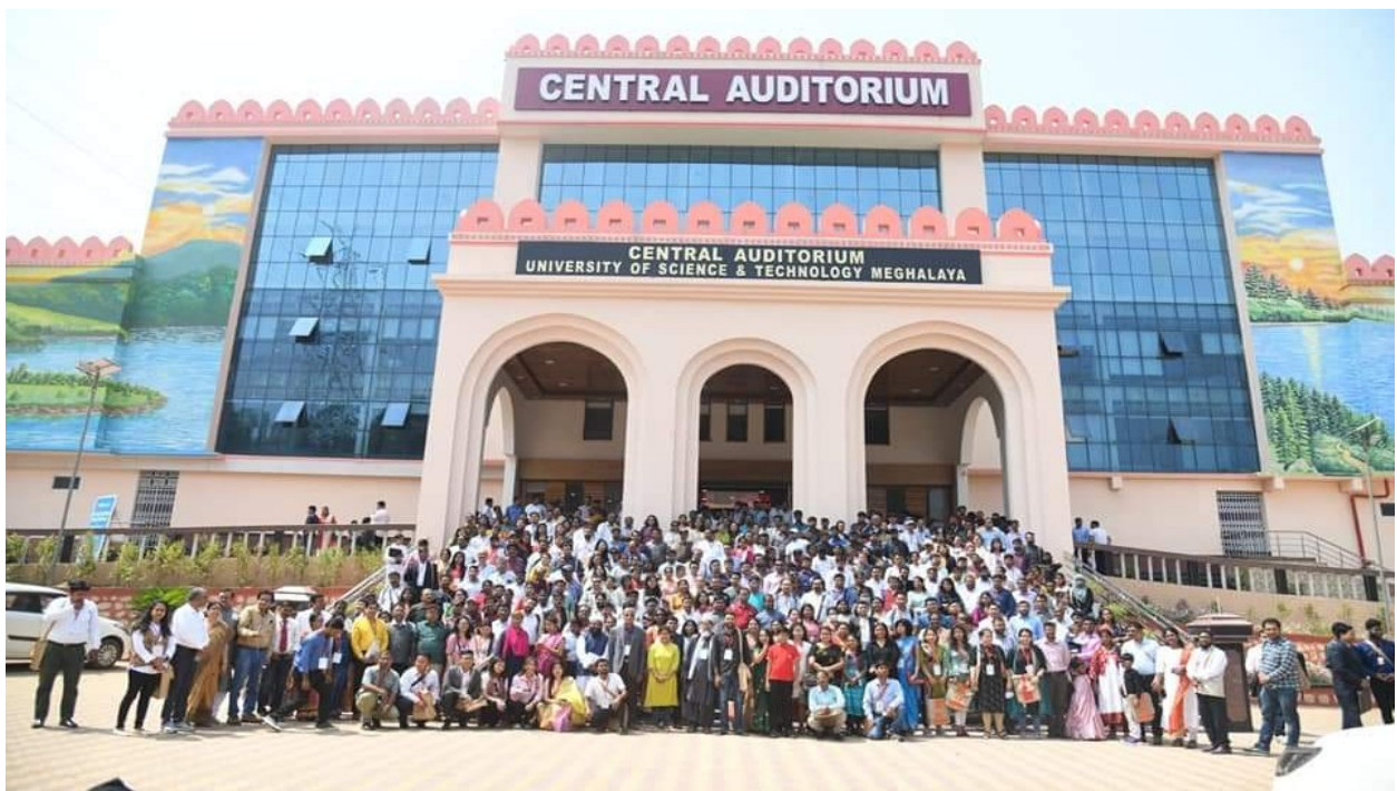
Pic 5: Group Photo of the Participants in IPSA Conference