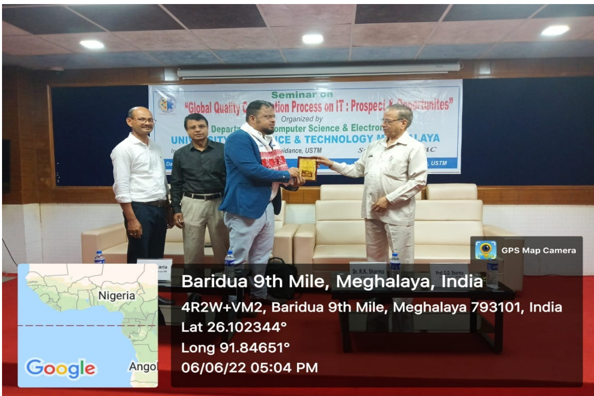
Seminar on " Global Quality Certification process on IT: Prospect and Opportunities"