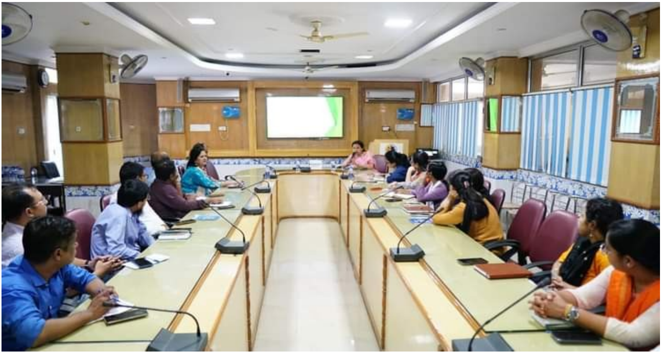
Discussing with All the HoDs & Deans