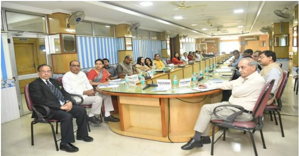
Hon,ble VC ,USTM with all HoDs and Deans