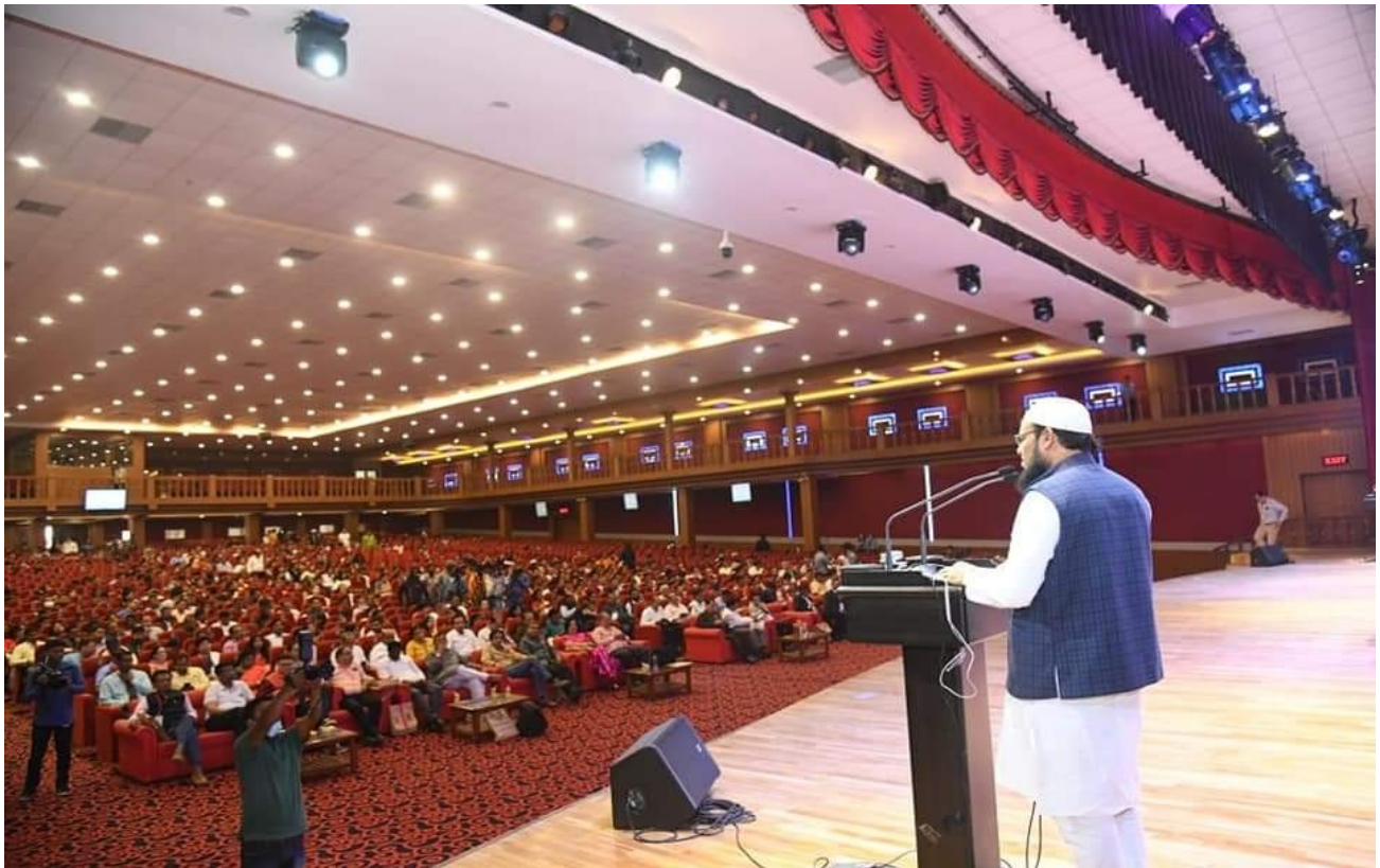
Pic 4: Lecture delivered by Hon'ble Chancellor, USTM in IPSA Conference