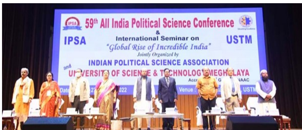
Pic 1: Inaugural Session of IPSA Conference