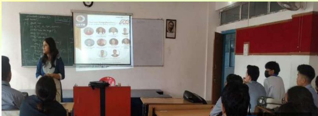
Resource person interacting with the student