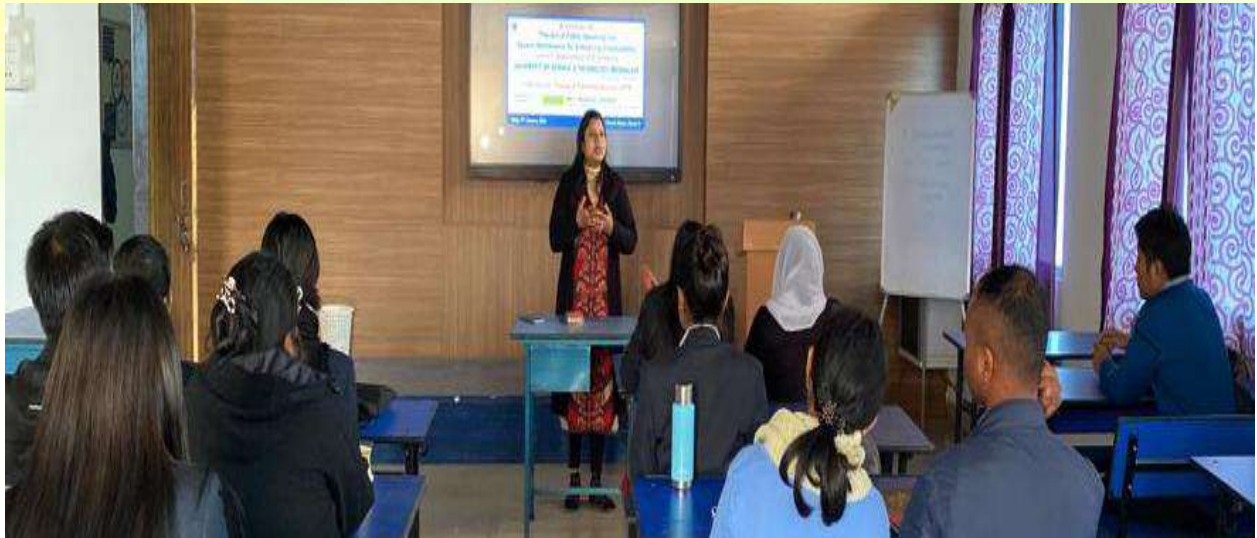
Interaction with the students