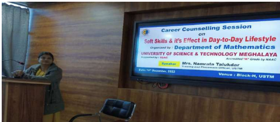
Resource Person starting the session