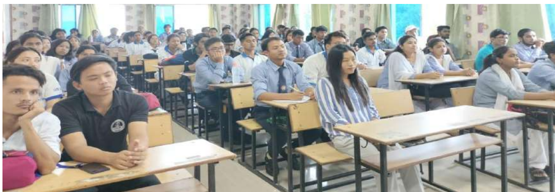
The students of Department of Commerce attending a session on “Preparation for a better tomorrow”