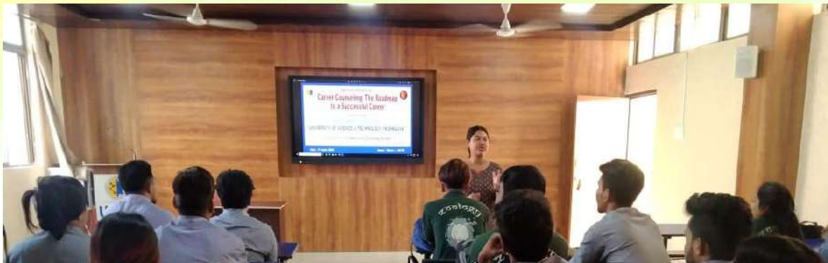
Resource person explaining the importance of career planning