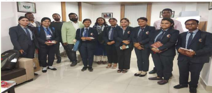
Selected students with the officials of ADP INDIA (Global HR shared Services)