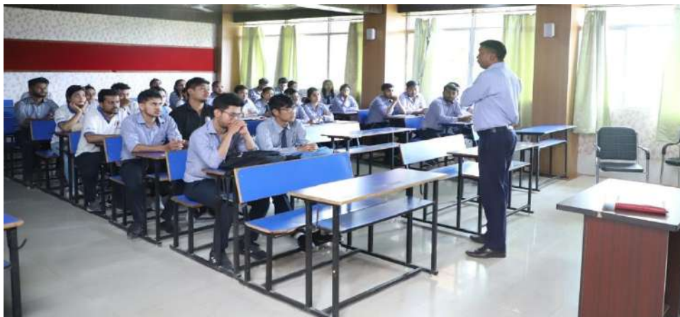
Speaker explaining the importance of Building the Foundation of Career