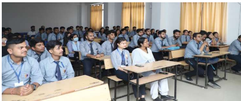
Students attending the session