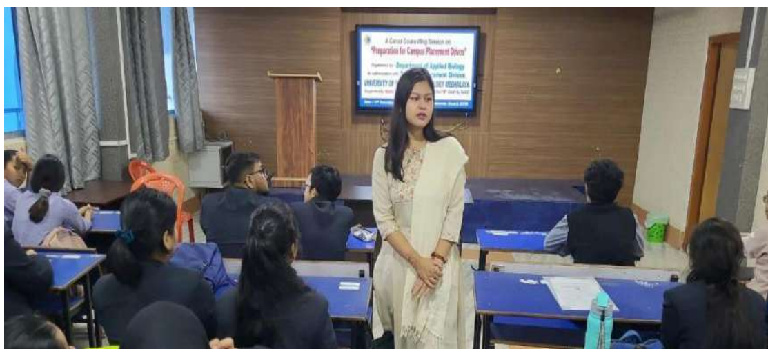
Resource Person briefing the session topic