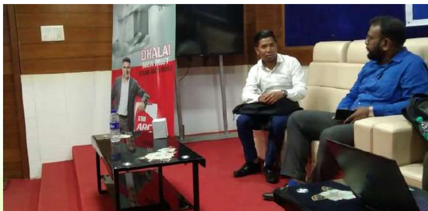
HR of Star Cement during interview