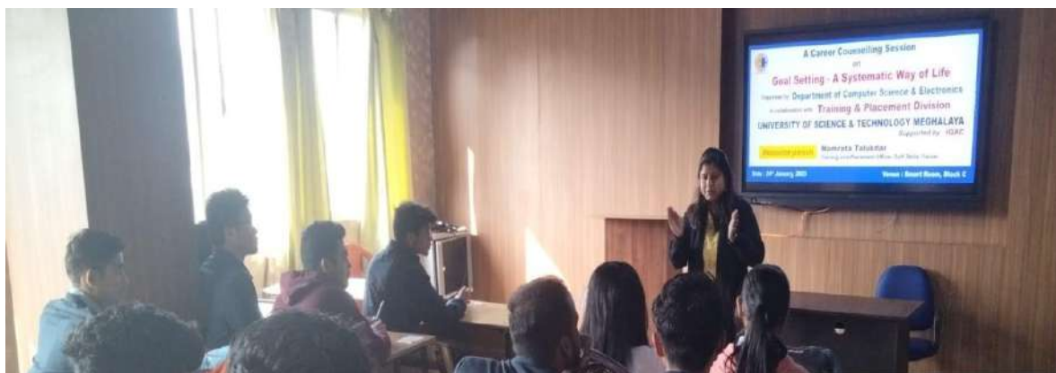
Resource person interacting with the students