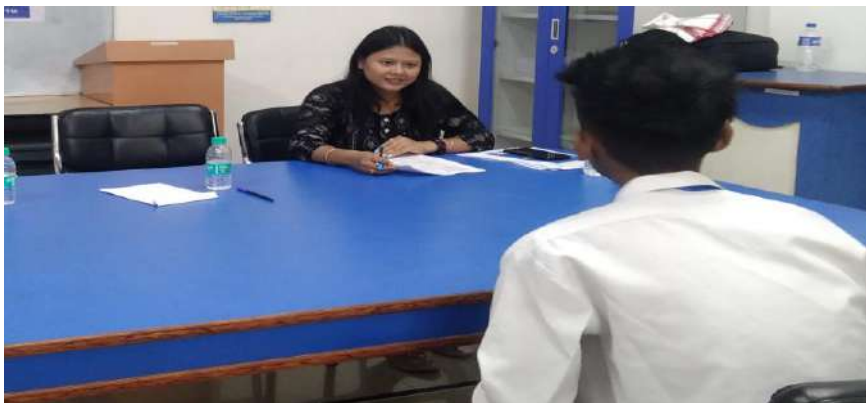
During interview of Bajaj Allianz