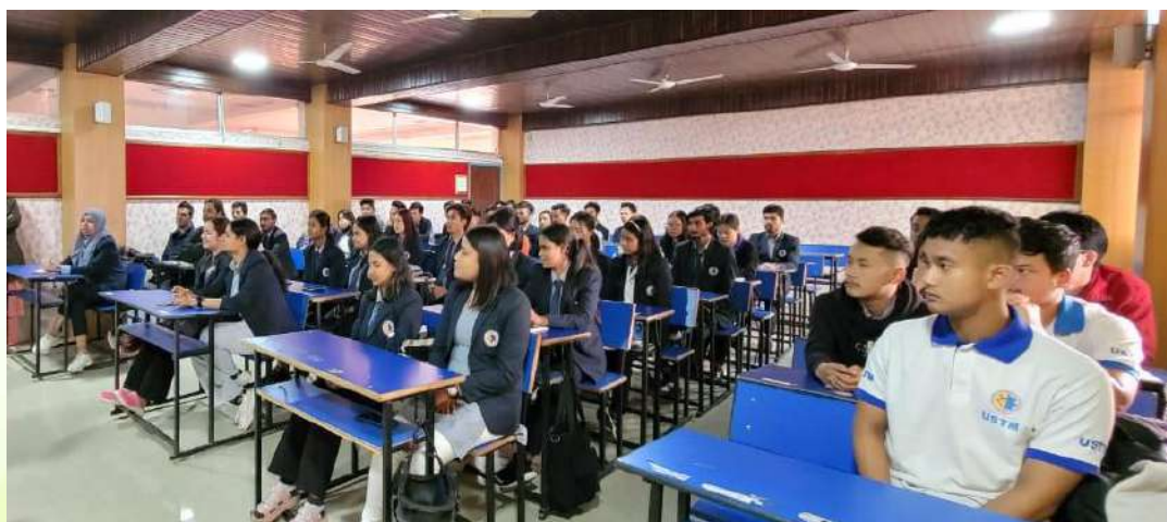
Students of final semester attending the session