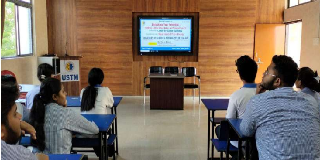
Students of Physiotherapy attending session