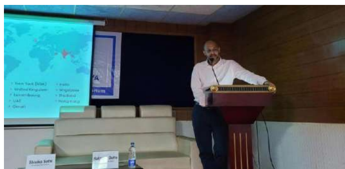
Official of Venture Catalysts delivering Pre placement talk