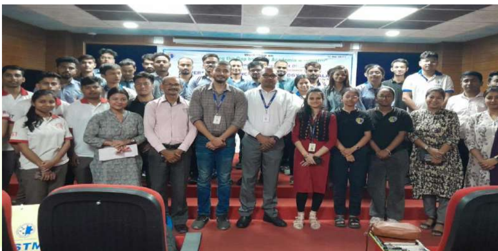
Students with the team of Zaloni