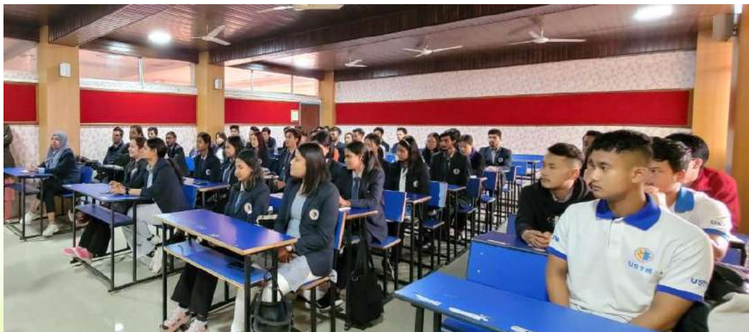
Students of final semester attending the session