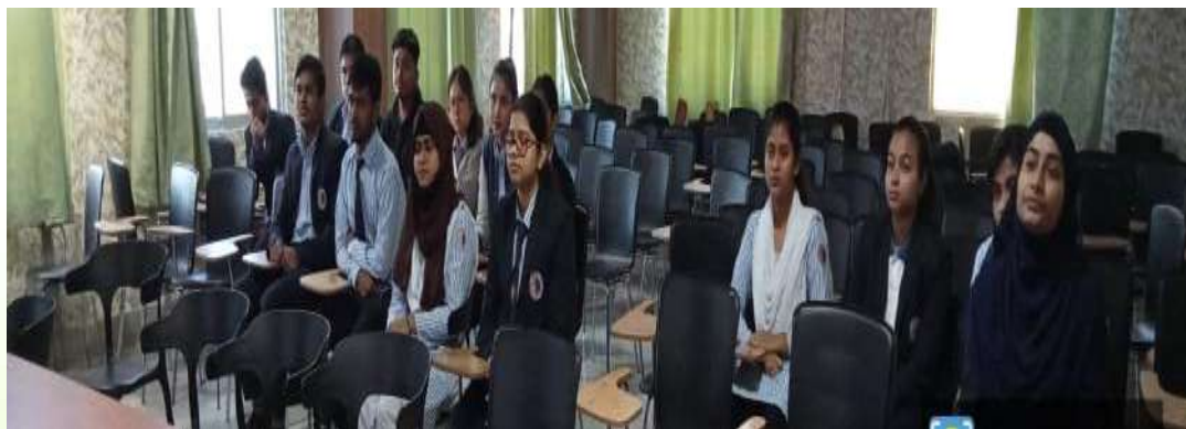
Students attending the lecture