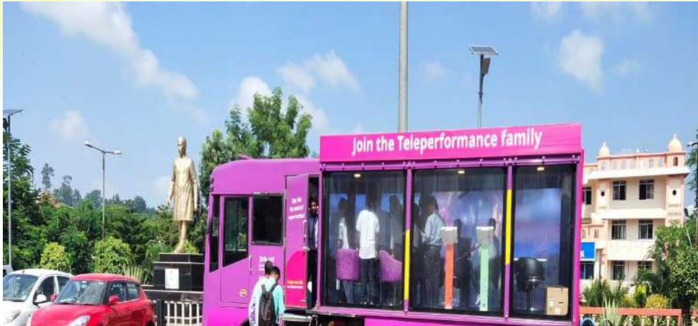
Students attending the interview of Teleperformance Global Services Pvt. Ltd