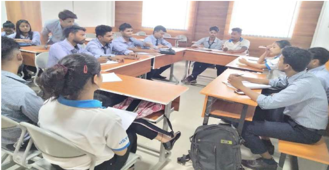
Students during Group Discussion