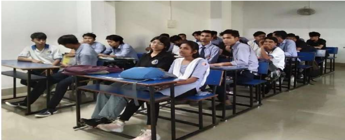
Students attending the session