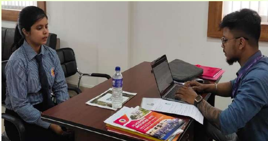
HR official of Vantage Circle during interview