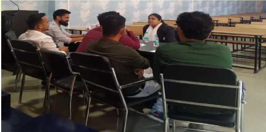
HR officials of VANTAGE CIRCLE during interview