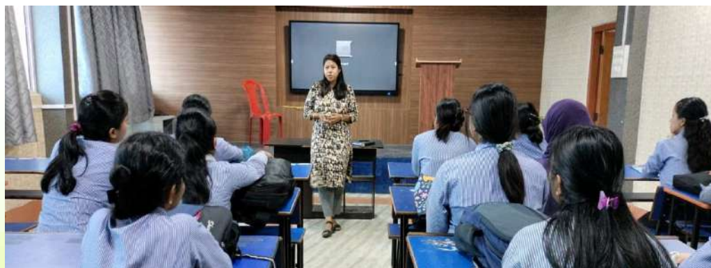
Speaker explaining the importance of a resume structure