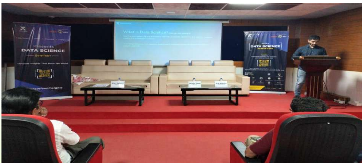
Presentation by the Officials of TechVariable