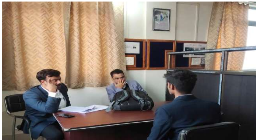
Students attending the interview of ICICI Prudential