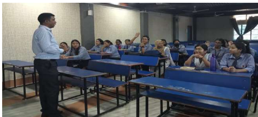
Students of MEC 2 nd & MEC 4 th semester attending a session