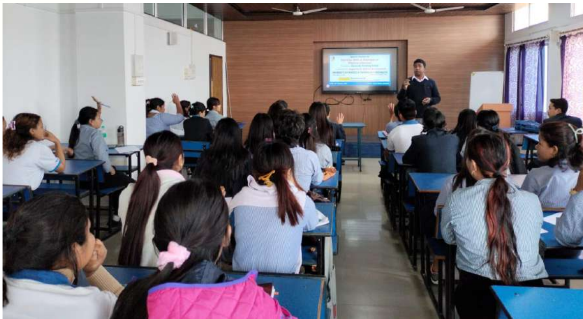
Resource person interacting with the students