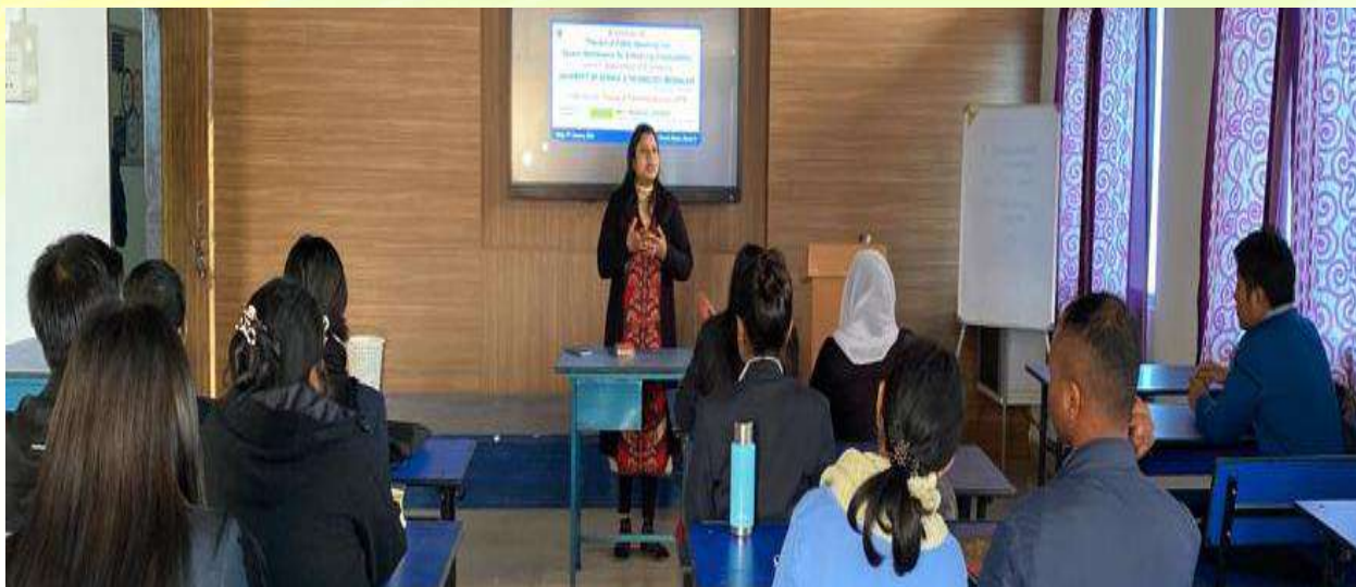
Interaction with the students