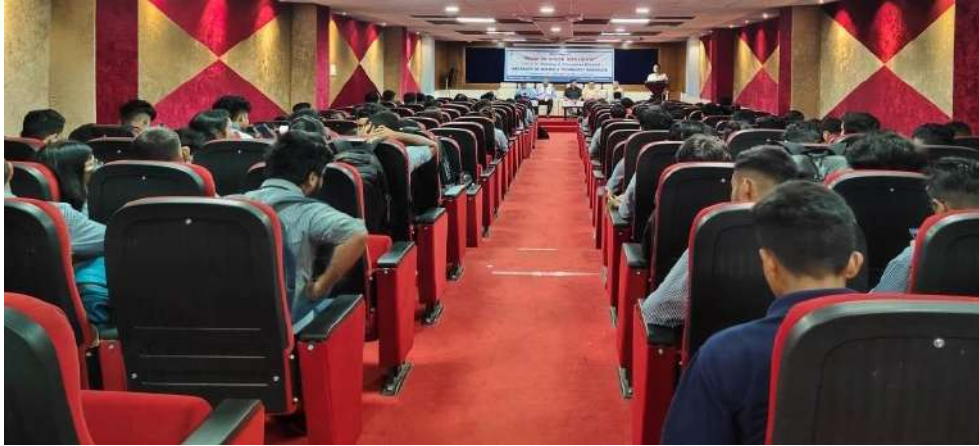
Students attending the workshop on How to crack interview