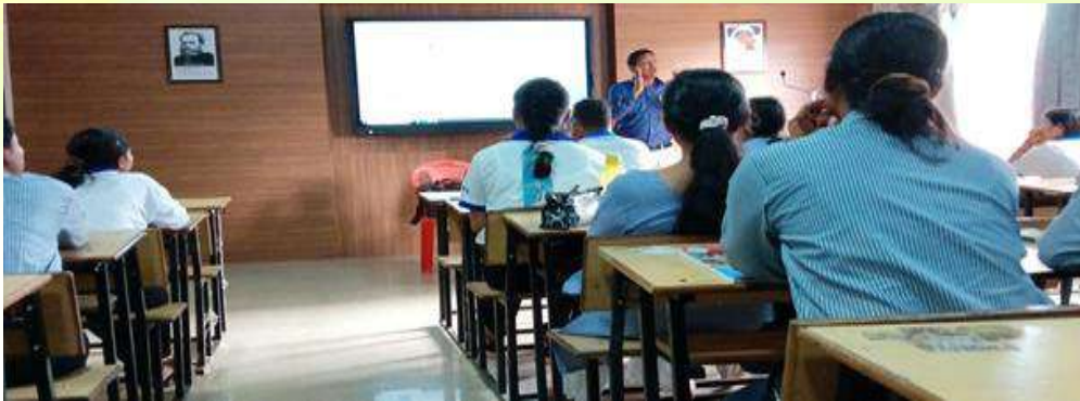
Final year students of USTM attending a session

(17) Title of the Activity: “Resume for cracking an Interview”