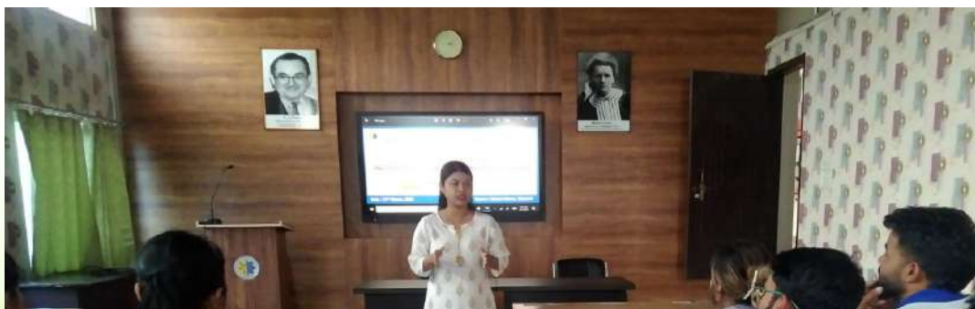
Trainer explaining the strategies to crack interview