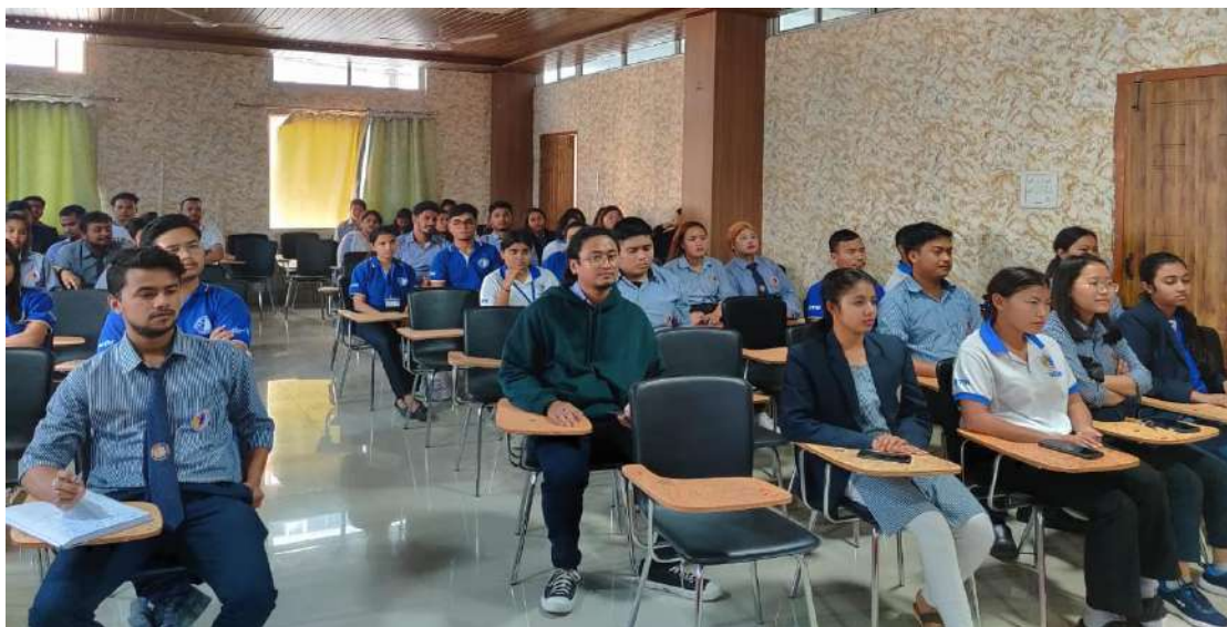
Students of BAAG learning the importance of up skilling