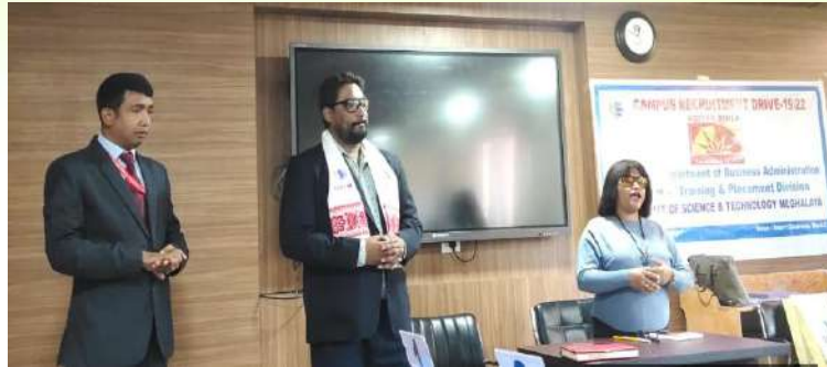
Pre-placement talk by the HR official of Aditya Birla Fashion & Retail