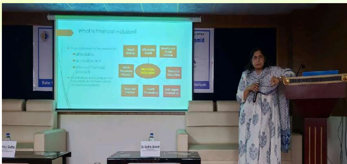
Speaker explaining the importance of financial inclusion