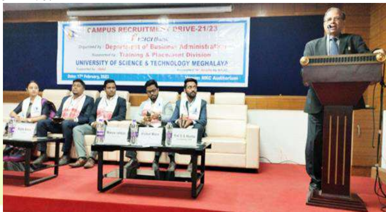
Vice Chancellor of USTM addressing the students during ICICI Bank Placement Drive