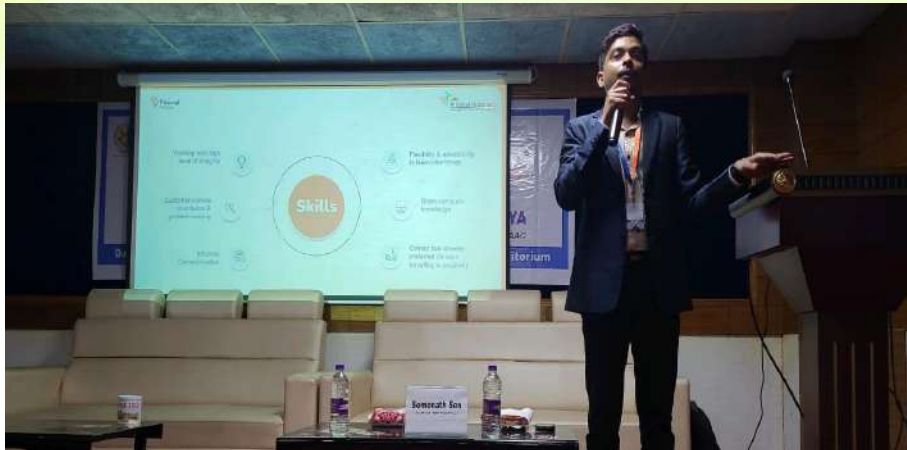
HR during Pre-placement talk of Piramal Finance