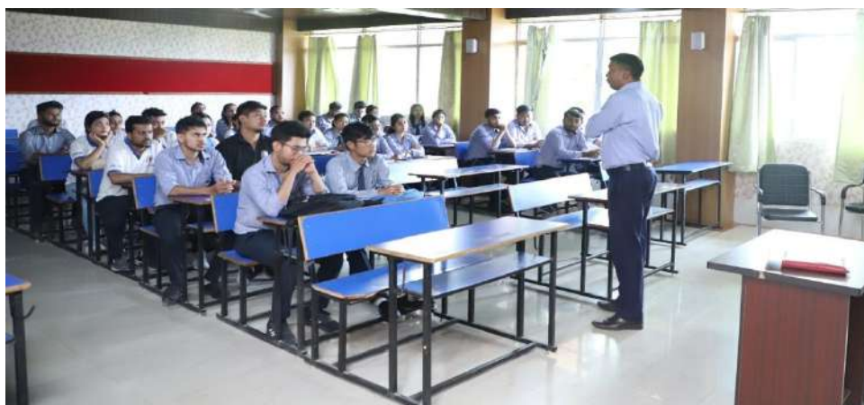
Speaker explaining the importance of Building the Foundation of Career