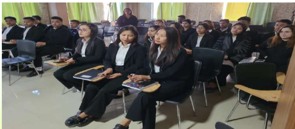
The students attending the session