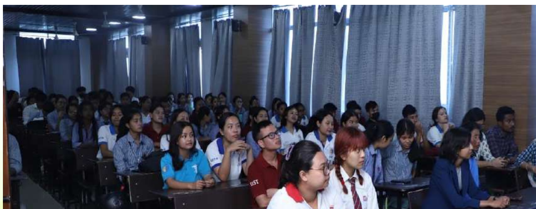
Discussing the importance of a right resume structure