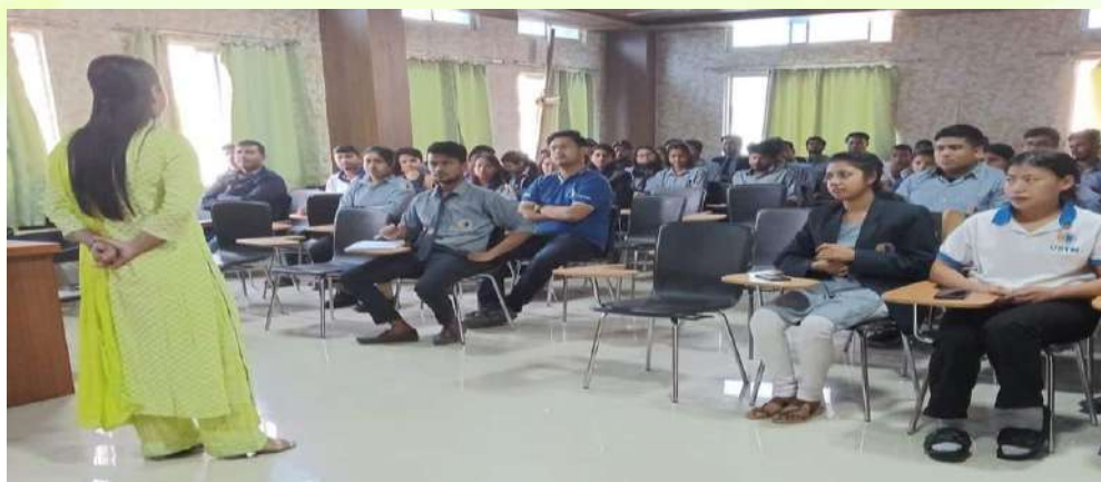
Students attending the lecture