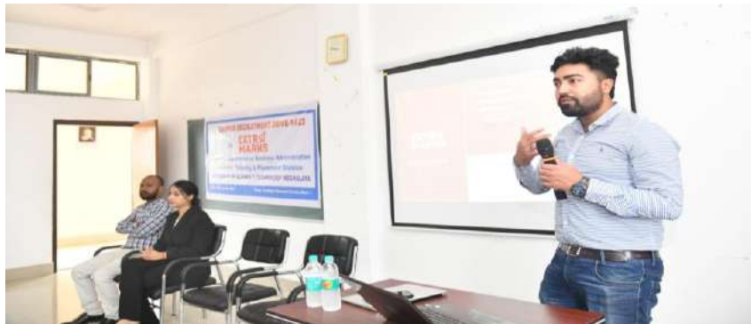
HR officials of Extramarks briefing the students about the company