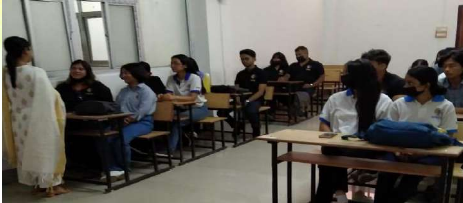
The students Department of Psychology during the session