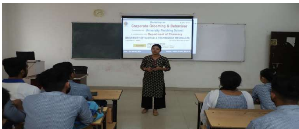
Resource person explaining the importance of right grooming and right behavior