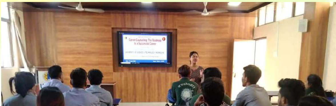
Resource person explaining the importance of career planning