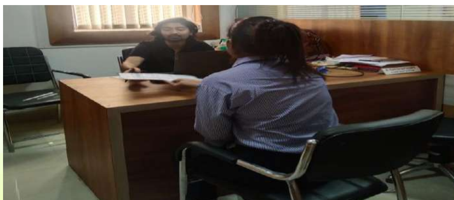
Student during interview of Samsung