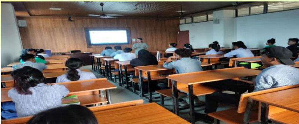
Resource person explaining the strategies to become successful