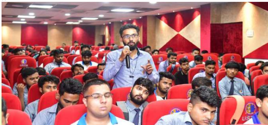
Students interacting with the speaker during the Q&A segment