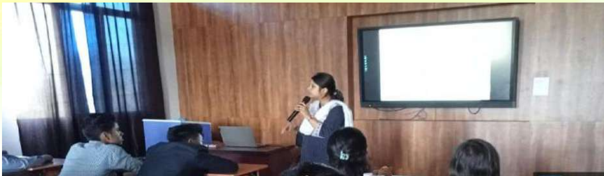
Resource person delivering the lecture