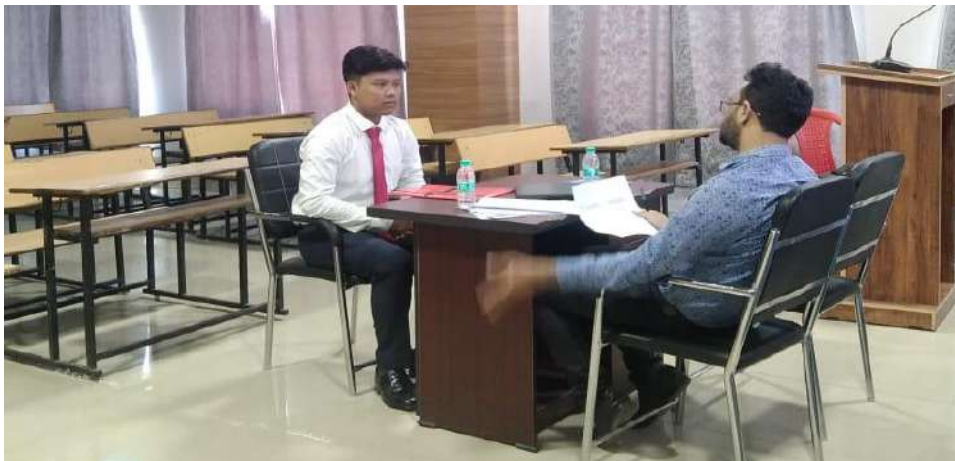
HR of Bandhan Bank during the interview