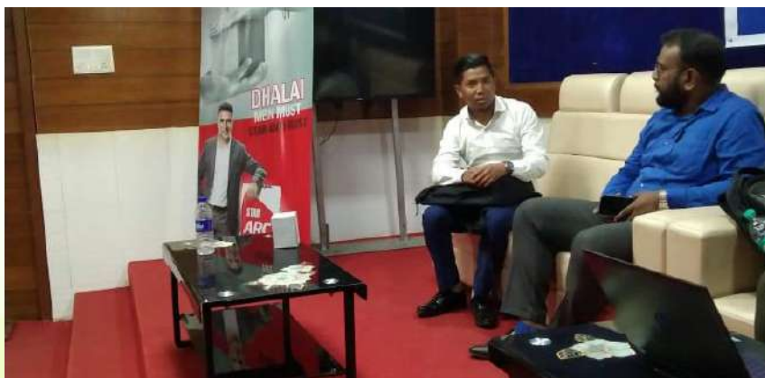
HR of Star Cement during interview