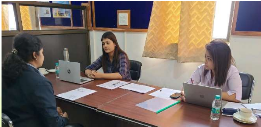
Personal interview round conducted by Marico