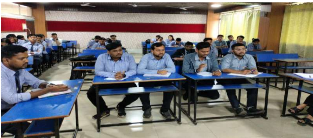
ULSR students during an activity