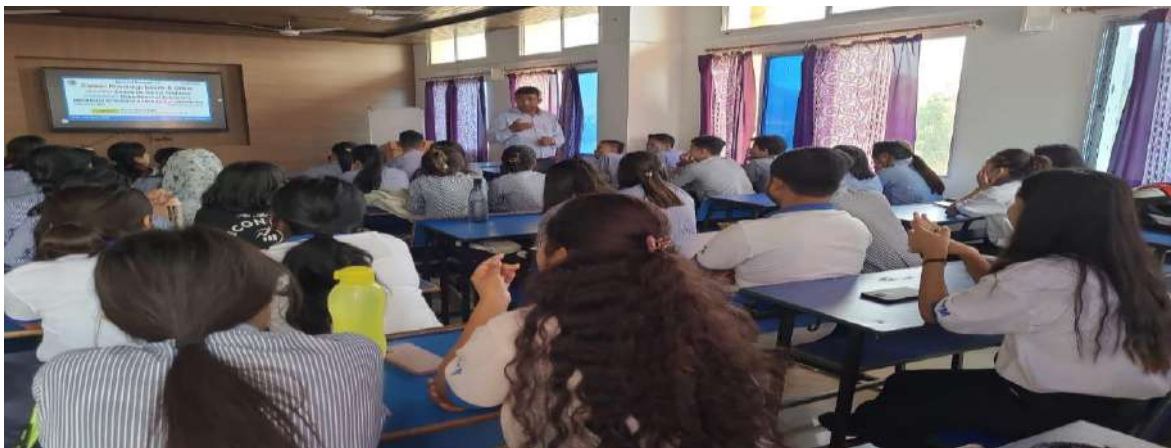
Resource person interacting with the students