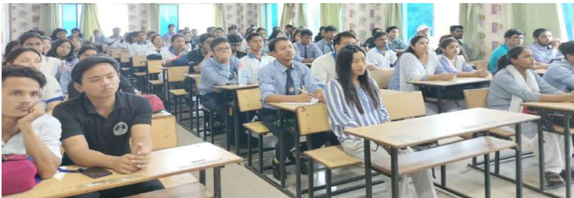
The students of Department of Commerce attending a session on “Preparation for a better tomorrow”