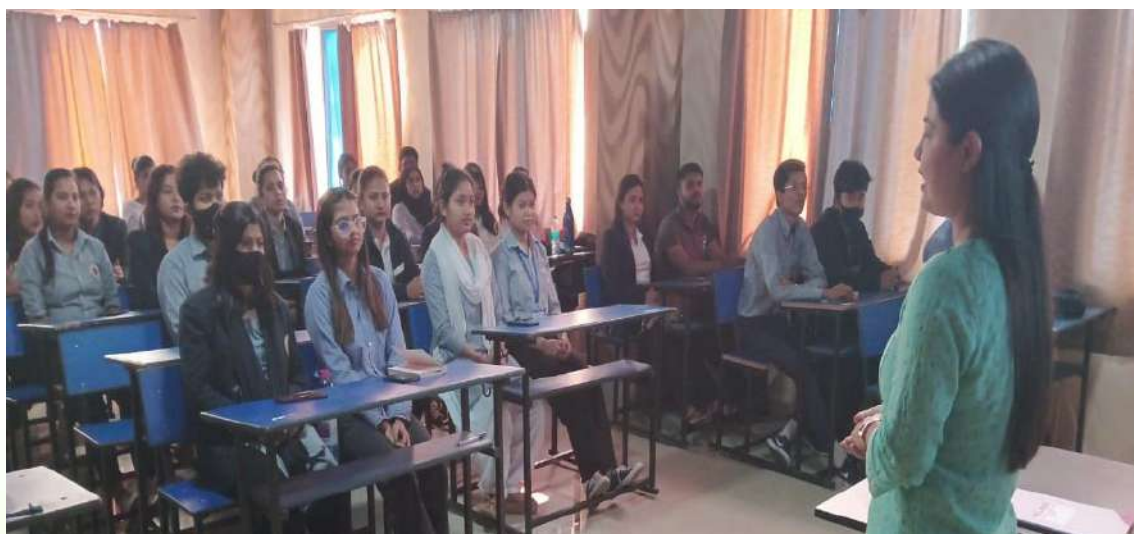
Students attending the session