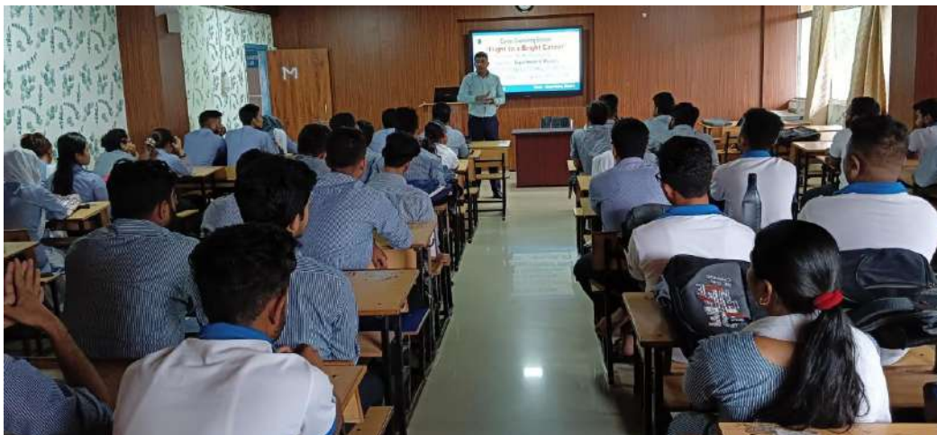
Resource person during the session