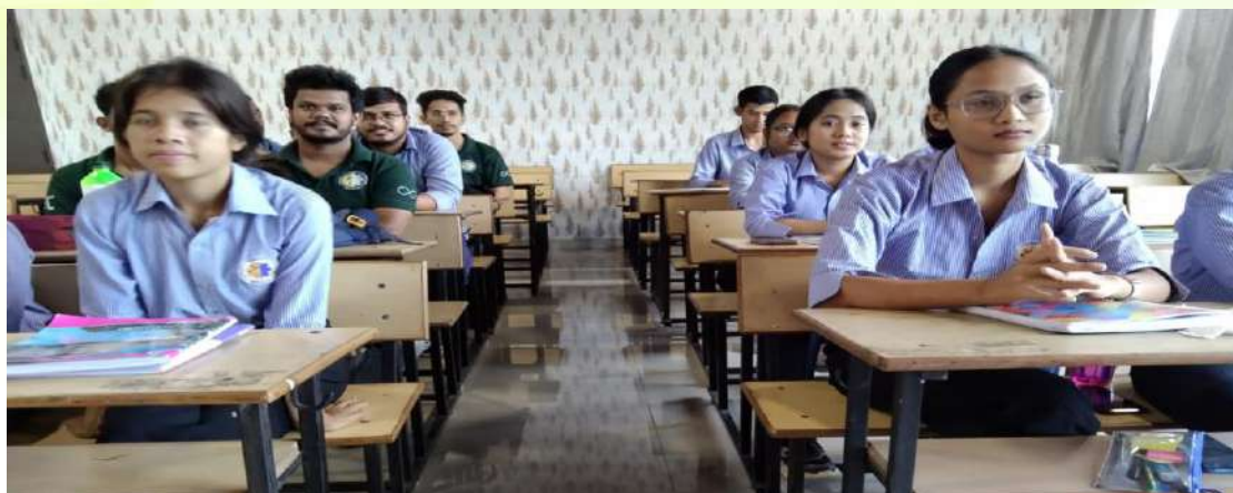
The resource person elaborating various opportunities and scope in the field Library and Information Science