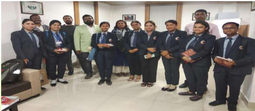
Selected students with the officials of ADP INDIA (Global HR shared Services)