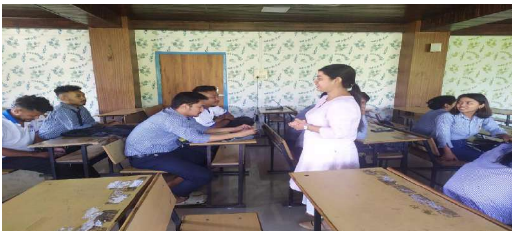
Final year students of Physics Department attending the session