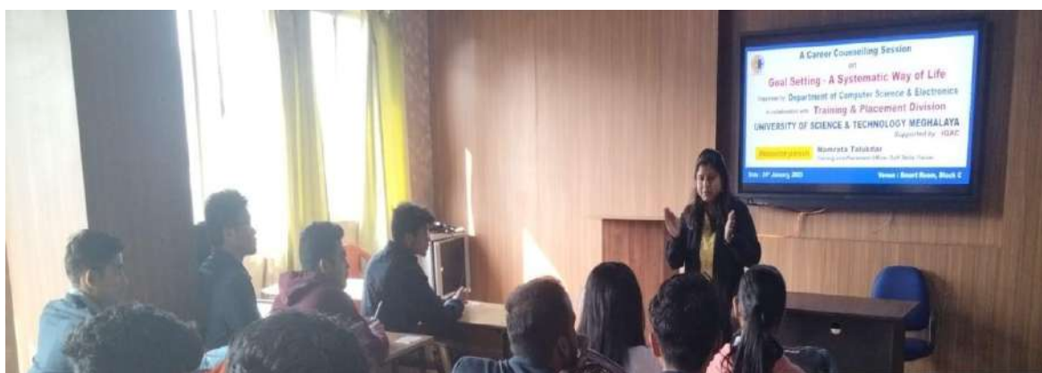
Resource person interacting with the students