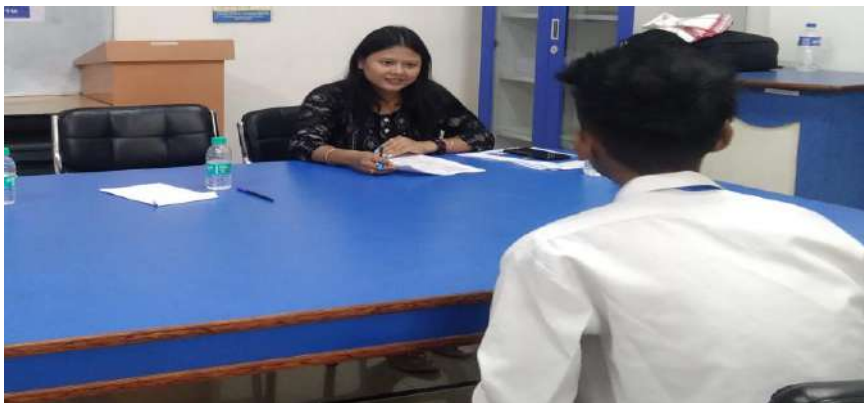
During interview of Bajaj Allianz