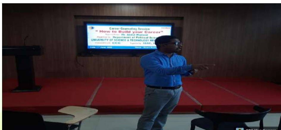
Speaker interacting with the students