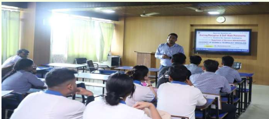
The students of MBA 2 nd semester during the session