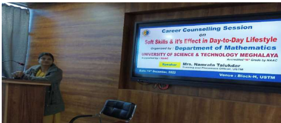
Resource Person starting the session