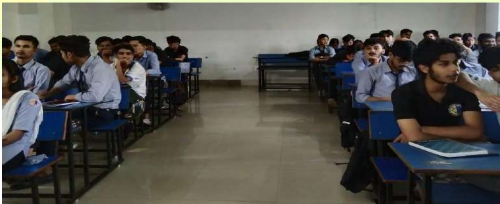
Students attending the session