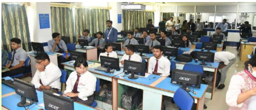
Candidates during online test conducted by TechVariable Pvt. Ltd.