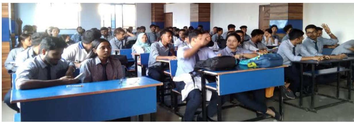
Final year students of USTM attending session