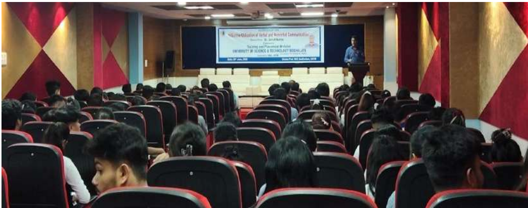
Students attending the session