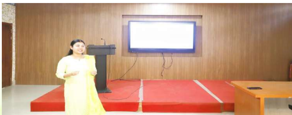
The trainer explaining steps for effective communication during the session