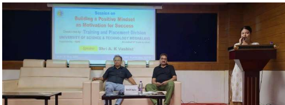
Welcome address to the dignitaries