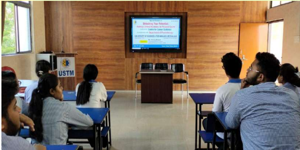
Students of Physiotherapy attending session