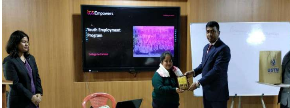
Felicitating the resource person