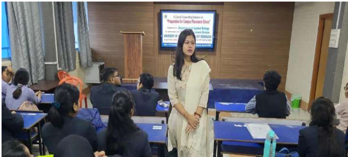
Resource Person briefing the session topic