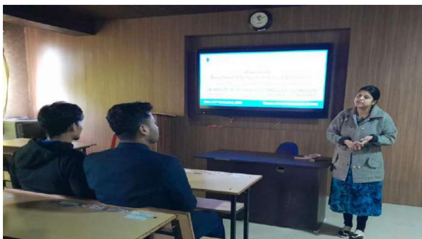
Resource Person briefing the students