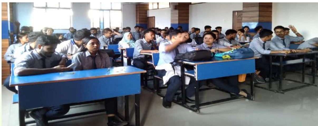
Students during an activity