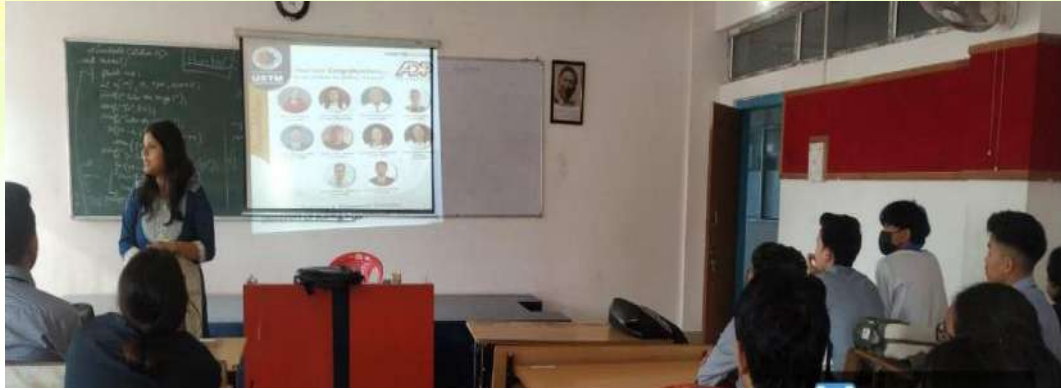
Resource person interacting with the student