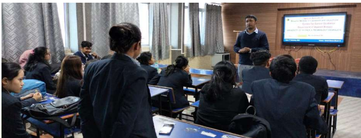
Resource person interacting with the students