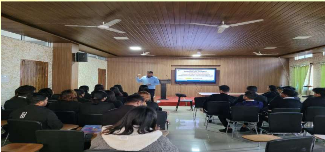
Resource person explaining the resume making techniques