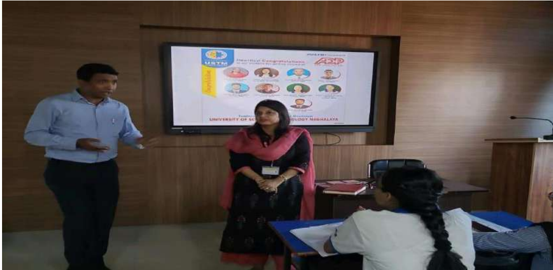
Resource person interacting with the students