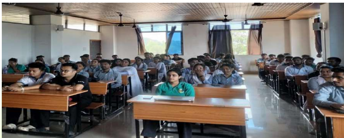
Students of Department of Physiotherapy attending the session