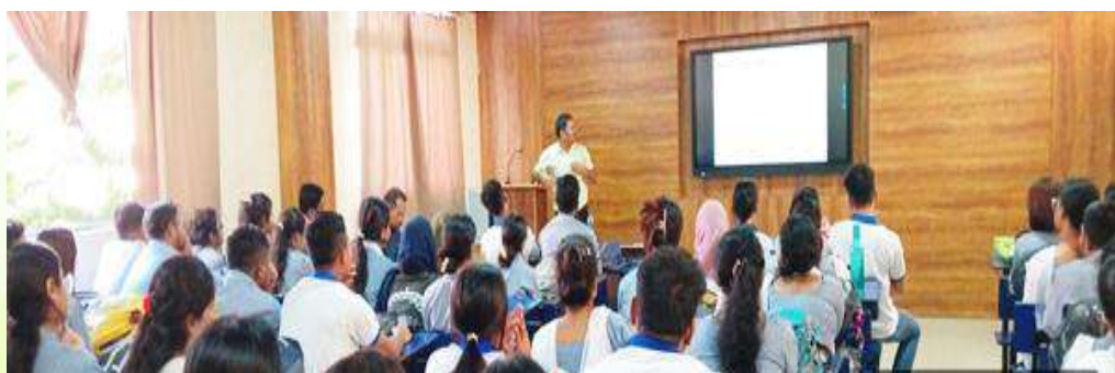
Students of B. Sc 6 th Semester attending career counseling session on “Flight to a Bright Career”