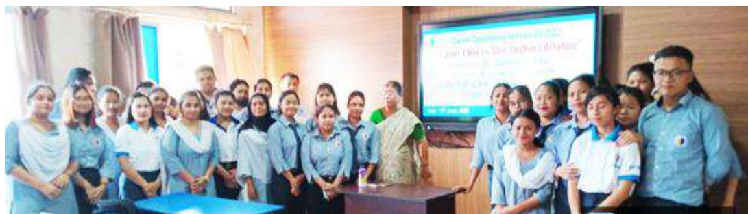
Students of Department of English attended a session