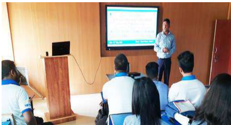
BBA and MBA Students attending a session