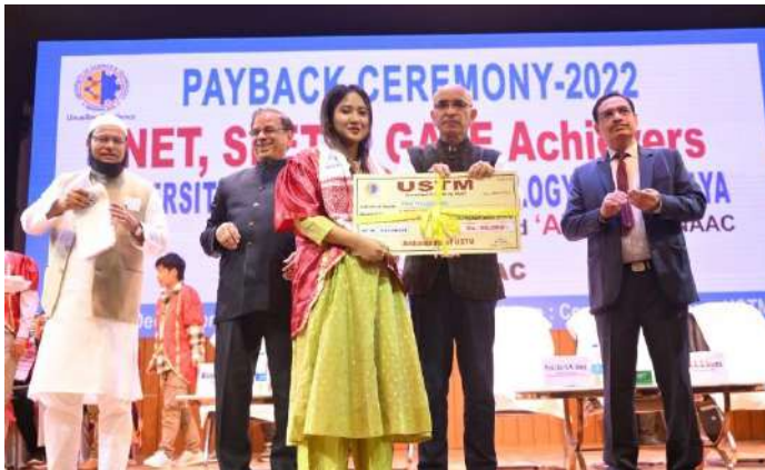
Students receiving payback cheque for clearing NET