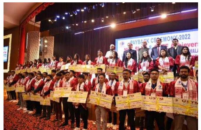
NET Achievers in Payback Ceremony 2022