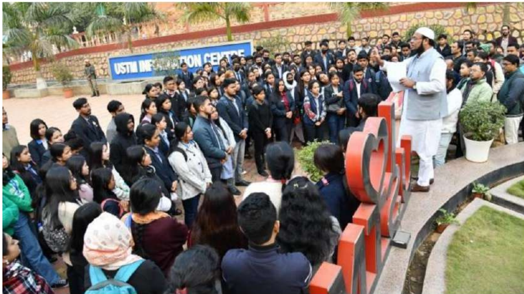
Honorable Chancellor's orientation to NET Aspirants, USTM