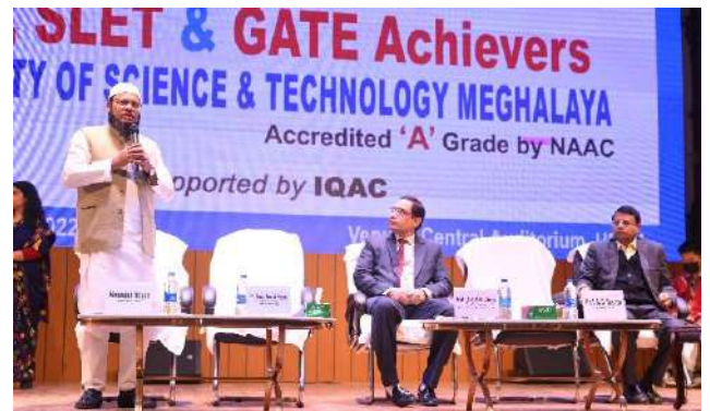
Honorable Chancellor, USTM speaking on further plans & programmes regarding University NET Classes and Payback Policies