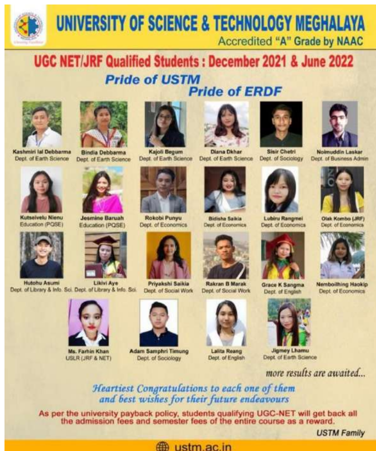
Some of the UGC NET Achievers December 2021- June 2022