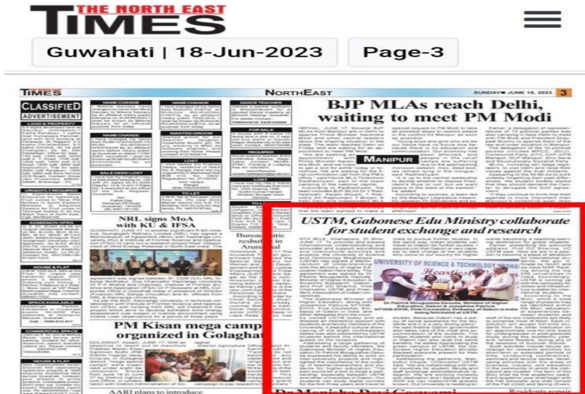
Coverage in The North East Times dated on 18 June 2023