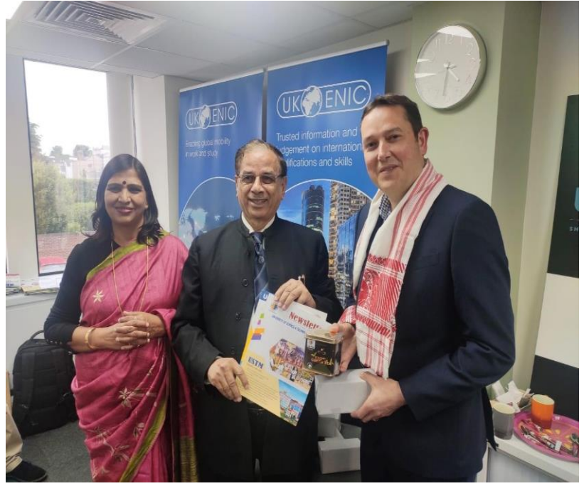
Vice Chancellor USTM presenting copies of USTM Newsletter to the British Council delegation members