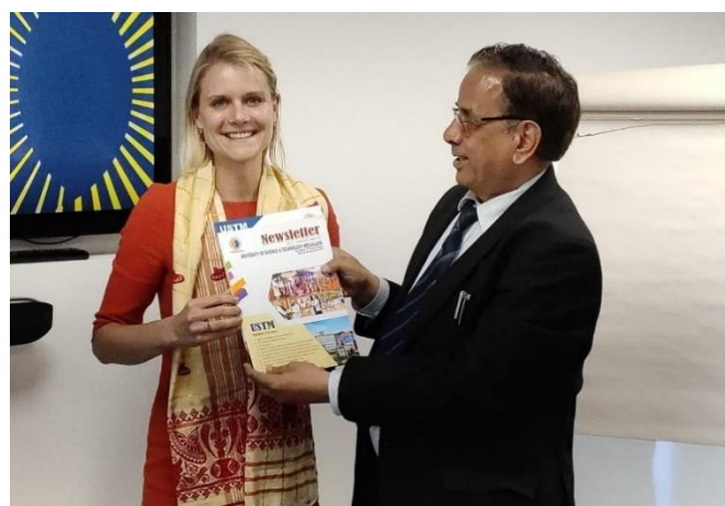
Vice Chancellor USTM presenting copies of USTM Newsletter to the British Council delegation members

The panel will deliberate on key challenges, opportunities, degree recognition, and equivalences between the two countries to get an understanding of methodologies and best practices in the UK to evaluate qualifications and the assessment process. The institutional visits will be done to develop an understanding of international degree programs, ODL in UK Higher Education Institutes.