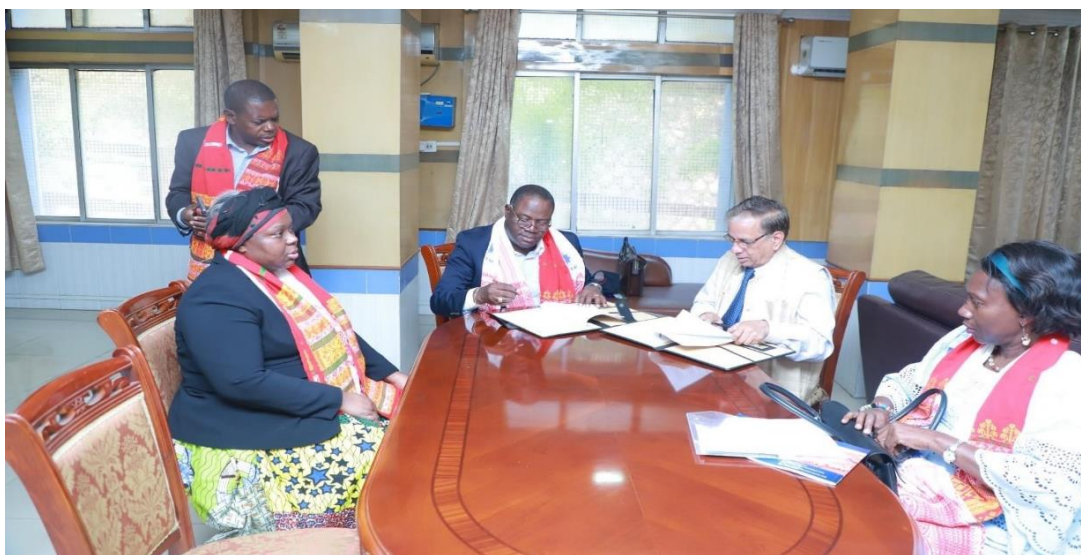
Mou Signed By VC of USTM & Minister of Gabon