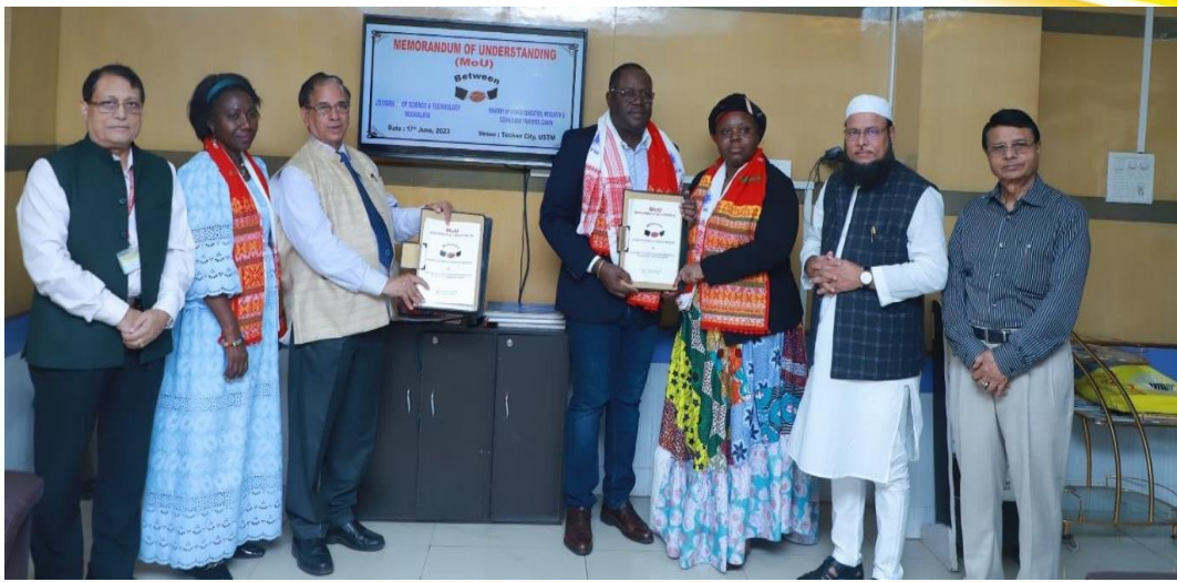
Group Photograph of Minister Gabon with Honorable Chancellor, Vice Chancellor and Pro VC and Advisor of USTM