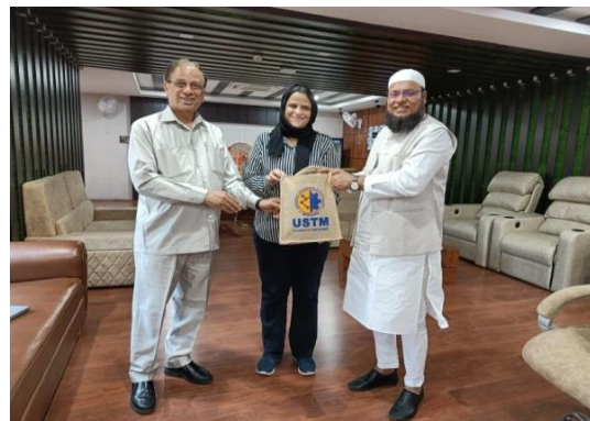
Hon'ble Chancellor & Hon'ble Vice Chancellor felicitating the Guests Officials on tour of the Ca