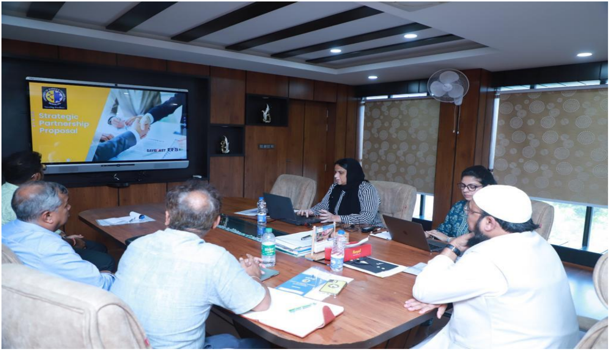
EFS Officials presenting presentation in front of Hon'ble Chancellor USTM