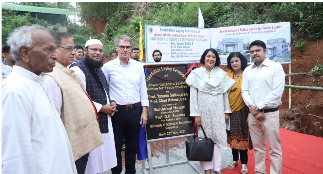
Foundation laid for AJ Saikia Centre for Peace Studies at USTM