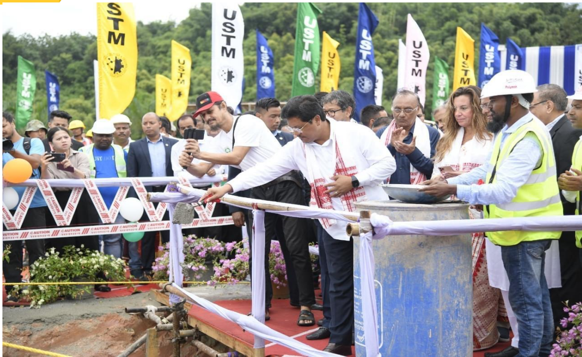
Honourable CM of Meghalaya laid the foundation of PA Sangma International Medical College & Hospital