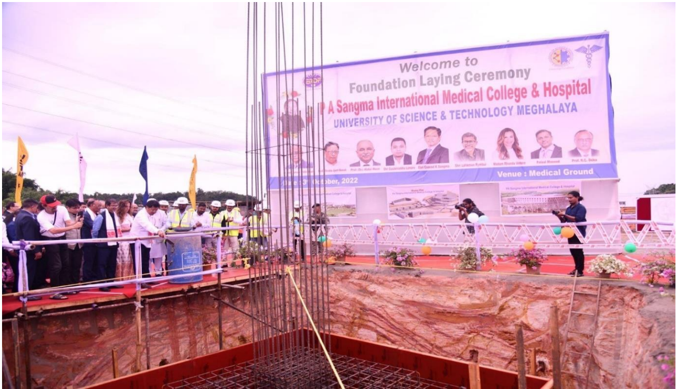
Foundation Laying Ceremony of PA Sangma International Medical College