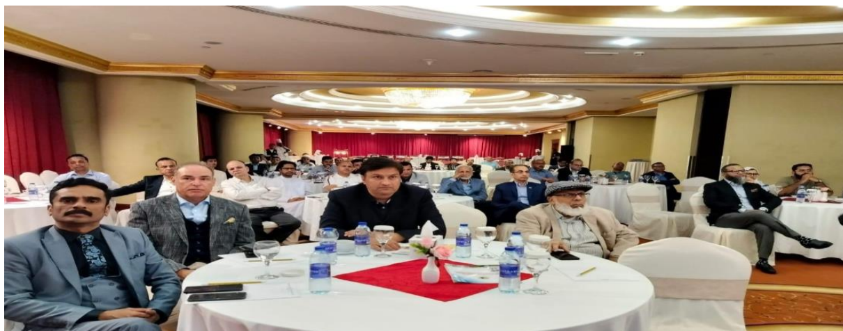
Hon'ble Chancellor of USTM Briefing upcoming PA Sangma International Medical College & Hospital in Font of the Investors in Dubai UAE