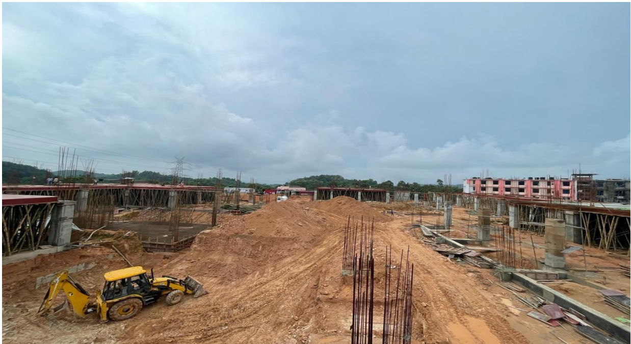
Construction Site of PA Sangma international Medical College & Hospital