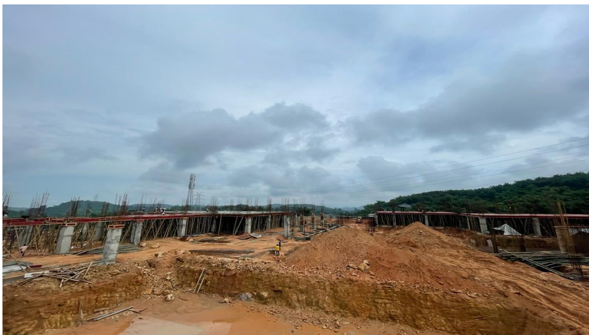
Construction Site of PA Sangma international Medical College & Hospital