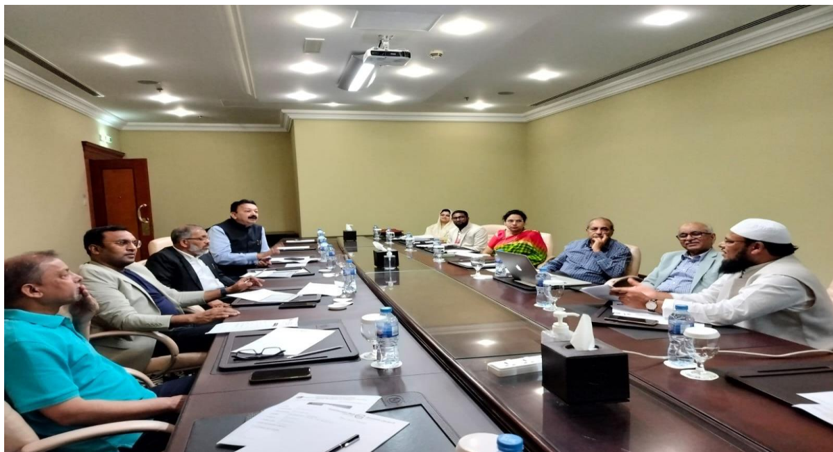
Hon'ble Chancellor of USTM Briefing upcoming PA Sangma International Medical College & Hospital in Font of the Investors in Dubai UAE