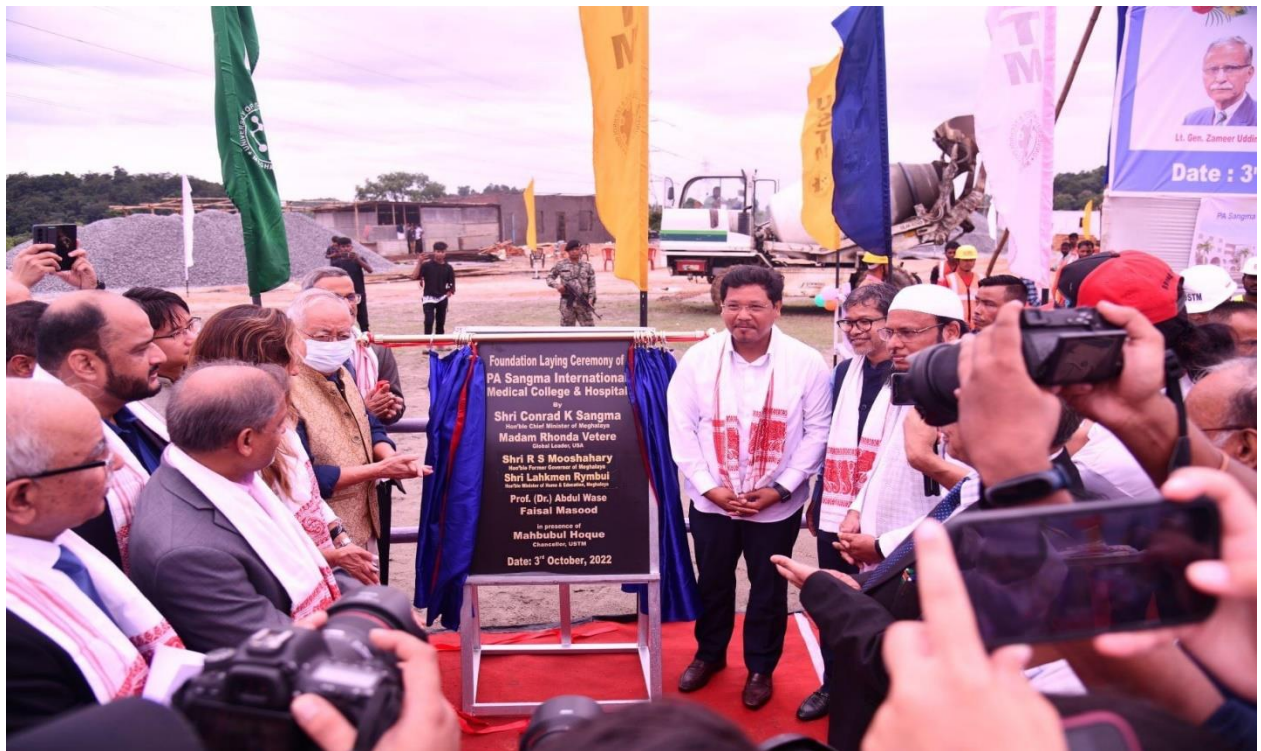
laid the foundation of PA Sangma International Medical College & Hospital