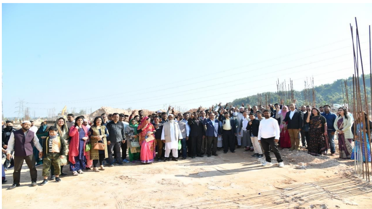
Parents united to support the healthcare and medical college project of USTM, seen in the upcoming hospital ground as a part of Fund raising initiatives