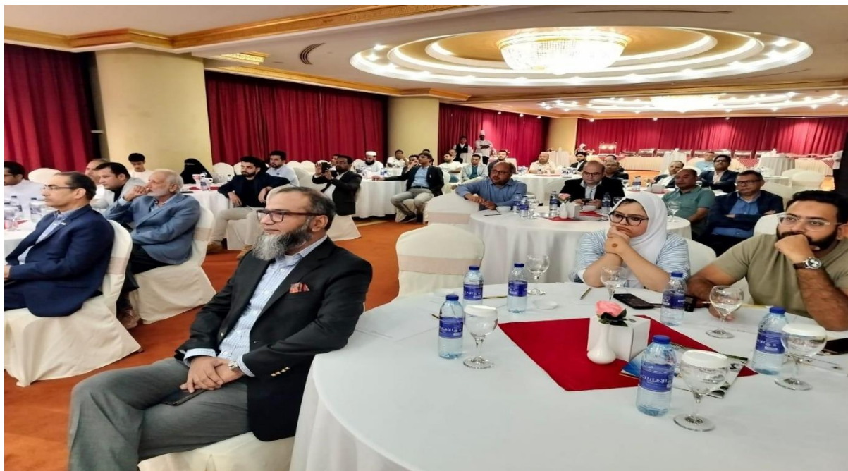
Chancellor of USTM given presentation for upcoming PA Sangma International Medical College & Hospital in Front of the Investors in Dubai UAE