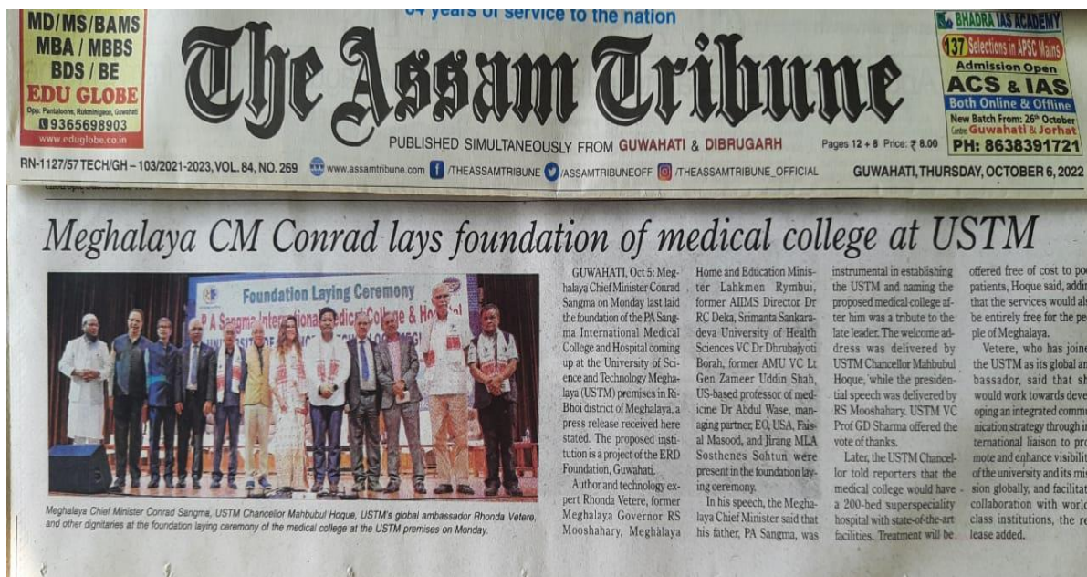
Coverage on The Assam Tribune dated on October 6 2022