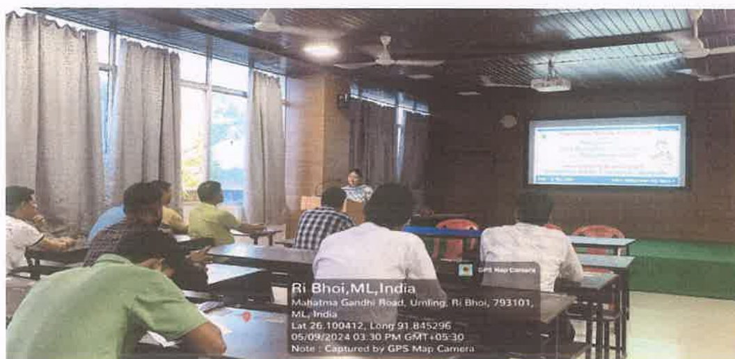
Resource Person Delivering Speech