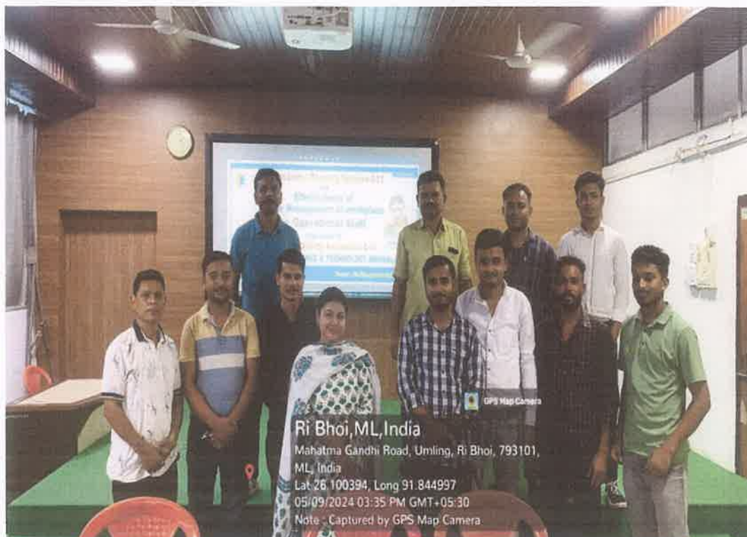
Group photo with the speaker