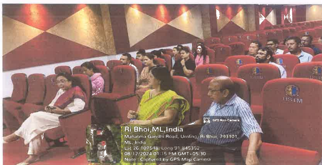
Faculty Member attending the session